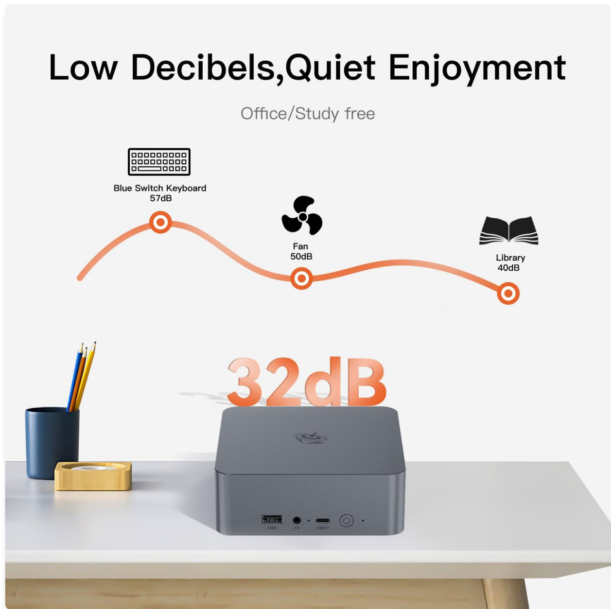
Image 3.1: Illustration of the Beelink EQR5 Mini PC operating at a low noise level, emphasizing its quiet performance for an undisturbed work environment.