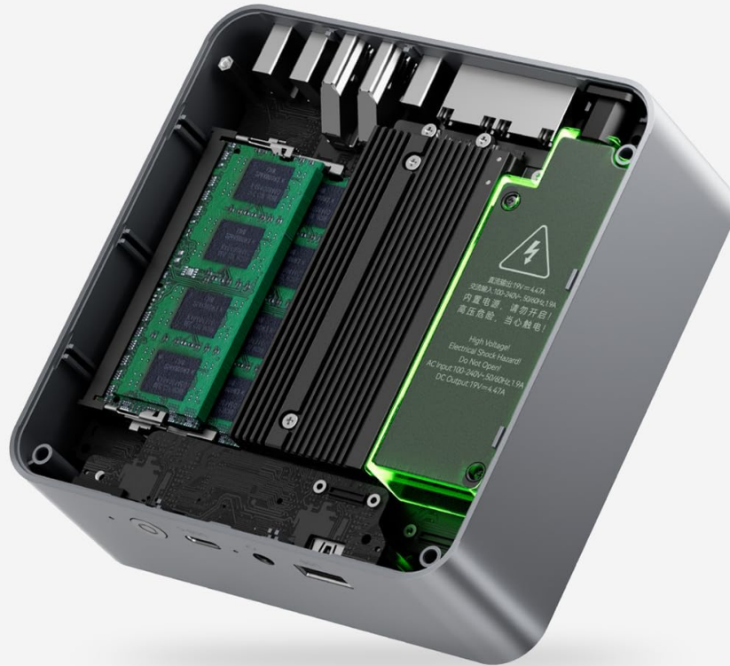
Image 6.1: Visual representation of the Beelink EQR5 Mini PC with its dimensions, highlighting its compact form factor.

Simplify your space with less cable clutter and fewer power strips