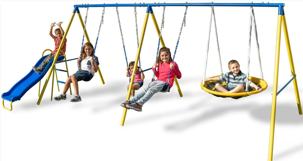
Image 1: The Sportspower Triple Swing & Saucer Backyard Swing Set, featuring a slide, saucer swing, and three sling swings.

This swing set is designed to provide a fun and engaging outdoor play experience for children aged 3 to 8 years, with a maximum individual weight capacity of 100 lbs per user, and a total maximum capacity of 600 lbs. It meets or exceeds ASTM safety standards.