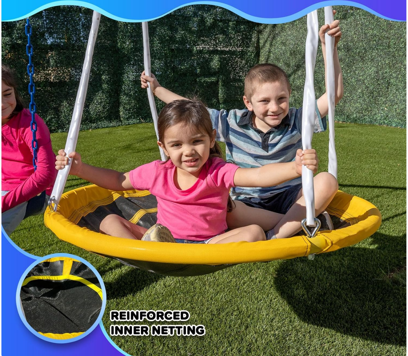
Image 5: Two children enjoying the spacious 2-person saucer swing.