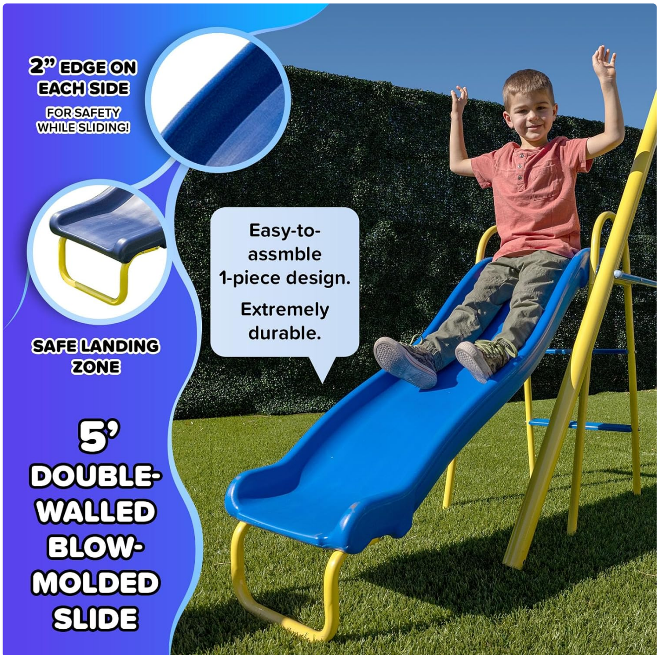
Image 7: A child preparing to use the 5-foot blow-molded slide, highlighting its safe landing zone and side edges.