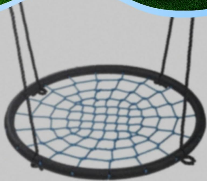
Image 6: A comparison illustrating the secure 'Bird's Nest' design of the Sportspower saucer swing.