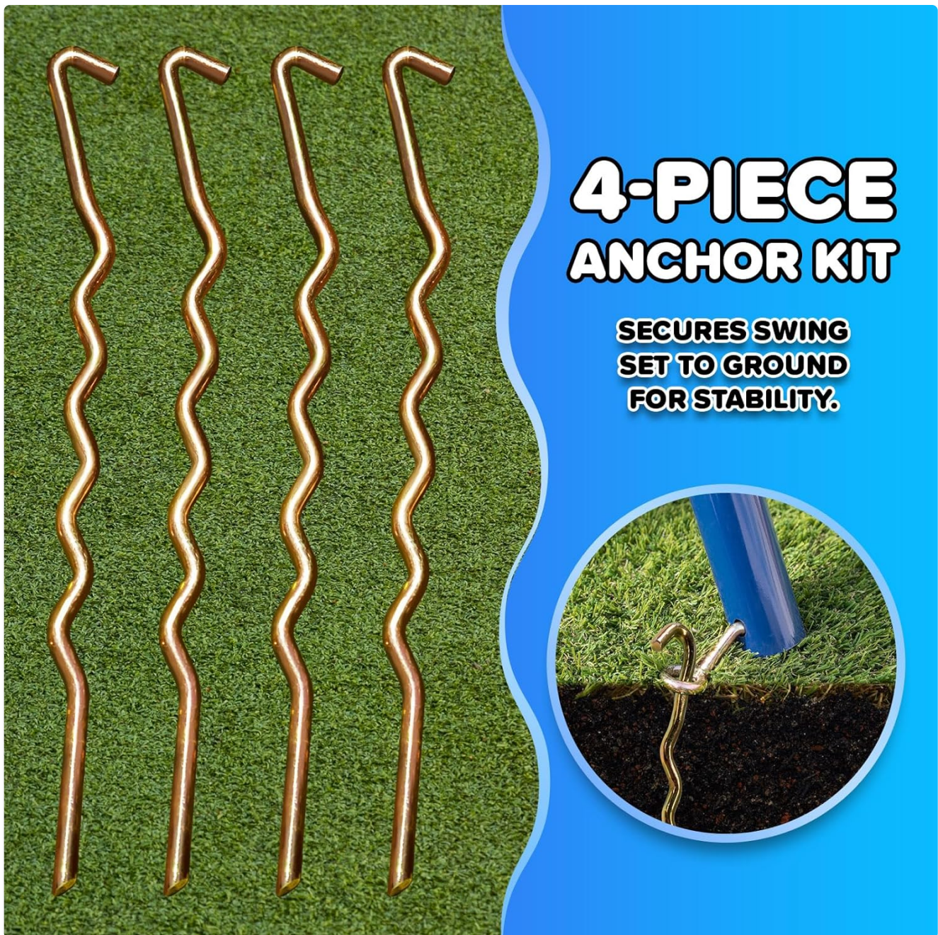
Image 3: The 4-piece anchor kit, essential for securing the swing set to the ground for stability.

Your browser does not support the video tag.