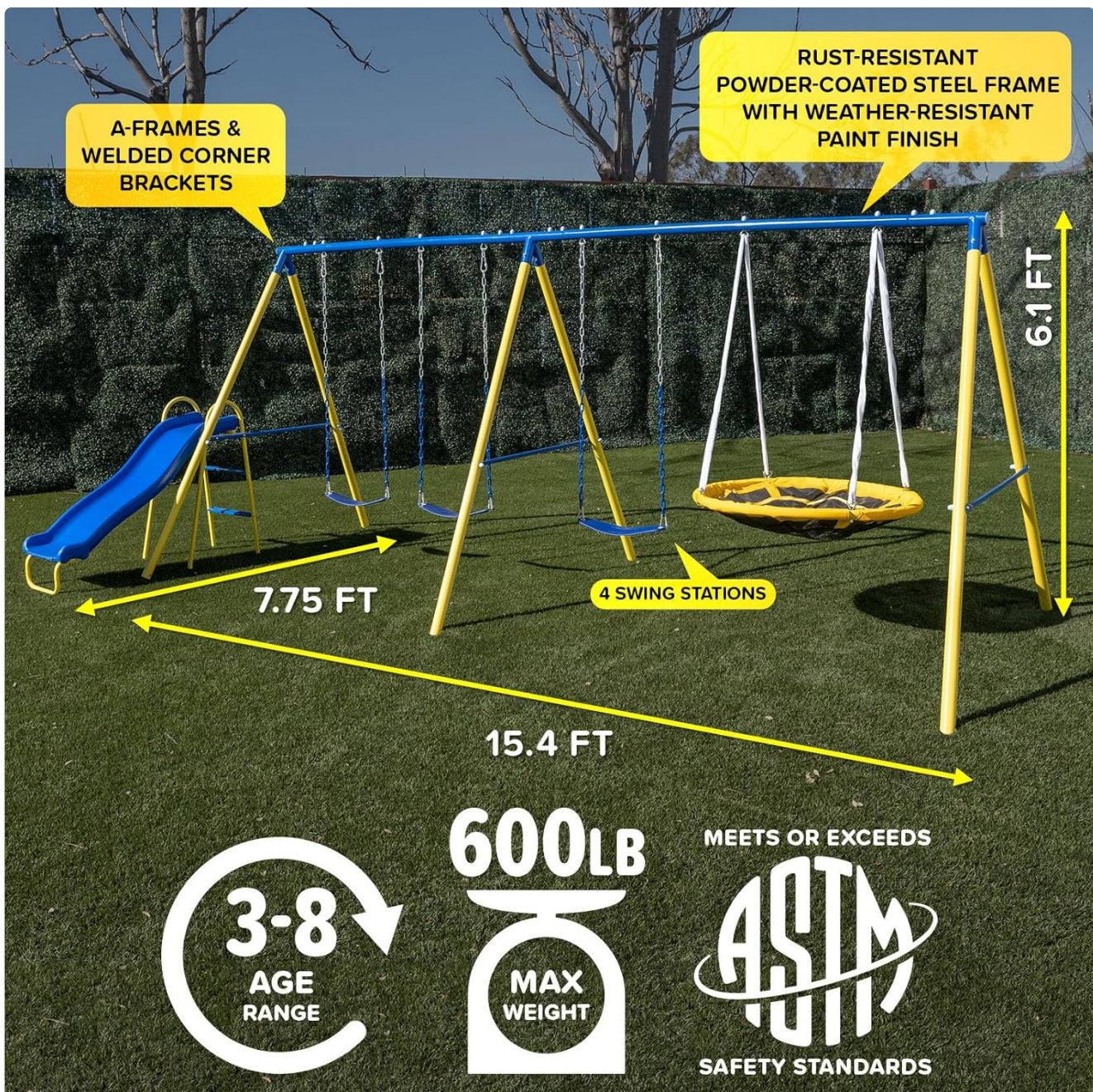
Image 8: Overview of the swing set's dimensions, weight capacity, age range, and adherence to ASTM safety standards.