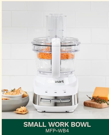
SMALL WORK BOWL MFP-WB4