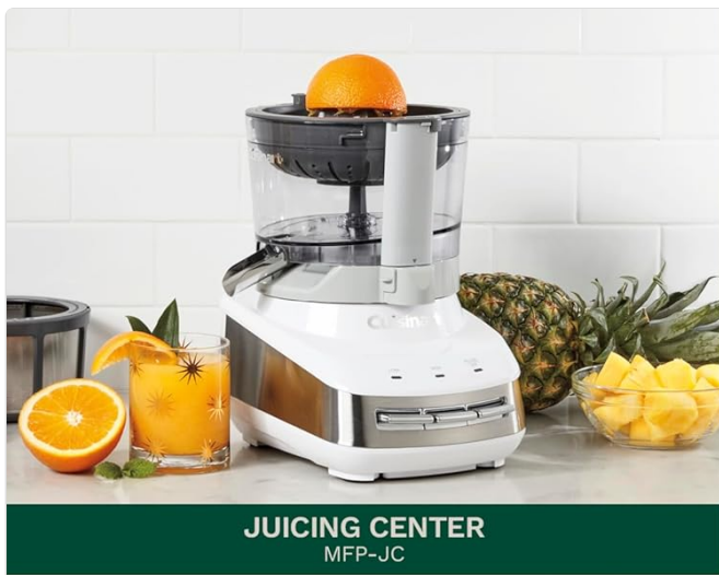
JUICING CENTER MFP-JC