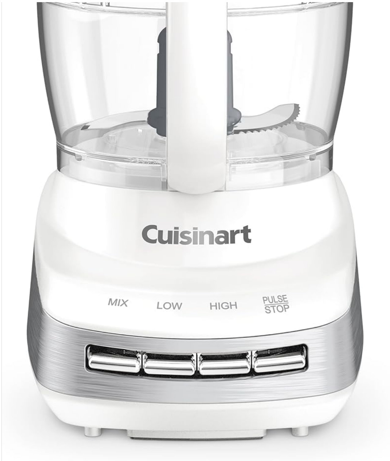
Front view of the Cuisinart Core Custom 13-Cup Food Processor.