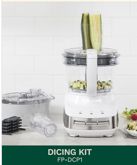
DICING KIT FP-DCP1