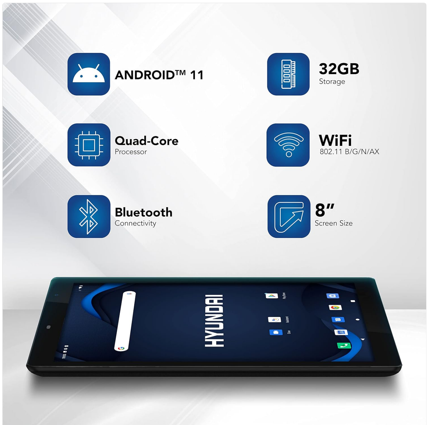
Image: Overview of the HYUNDAI HYtab Pro 8WB1's core specifications and features.