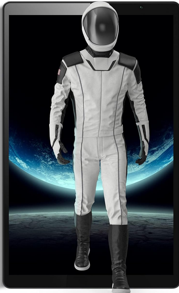
Image: The tablet's display showcasing its Full HD IPS screen quality.

8" / 1200x1920 FHD IPS / Integrated Speaker / 32GB