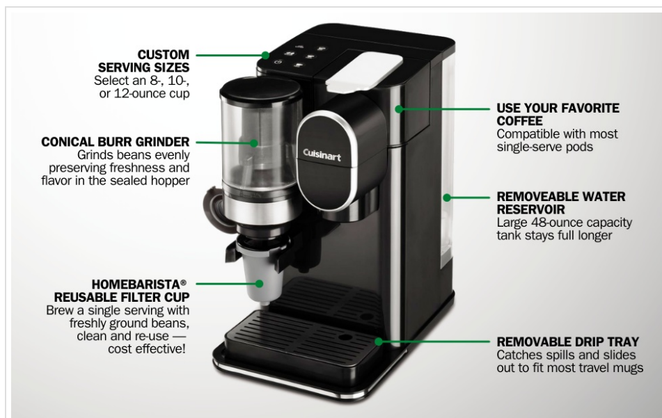
Image: Key components of the Cuisinart DGB-2 Single-Serve Coffee Maker + Coffee Grinder, including the conical burr grinder, water reservoir, control panel, and drip tray.

The Cuisinart Single-Serve Coffee Maker + Coffee Grinder is designed for convenience and versatility. Familiarize yourself with its key components: