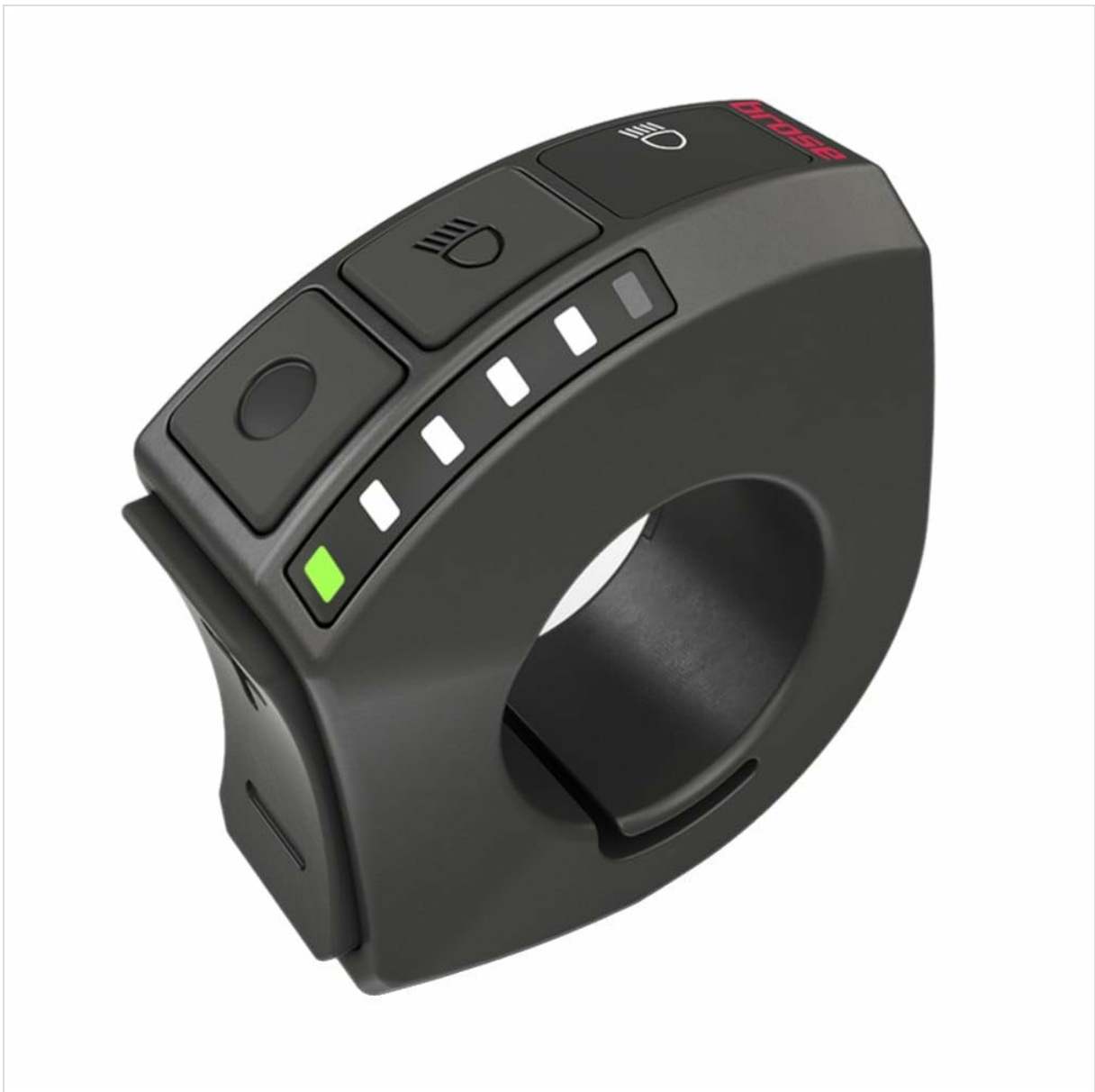
Image 1: BROSE Display Unit Remote e41227. This image shows the compact design of the display unit, typically used for controlling e-bike functions or similar applications.