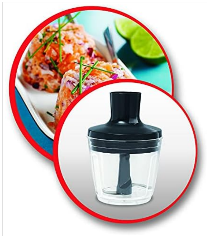
Figure 4.2: The 500ml chopper bowl efficiently processes various ingredients.