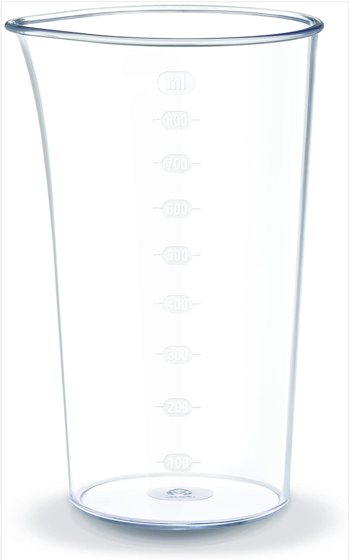
Figure 2.3: The 800ml measuring beaker.