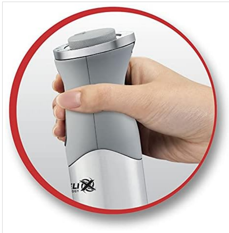
Figure 4.1: Ergonomic design for comfortable and secure handling.