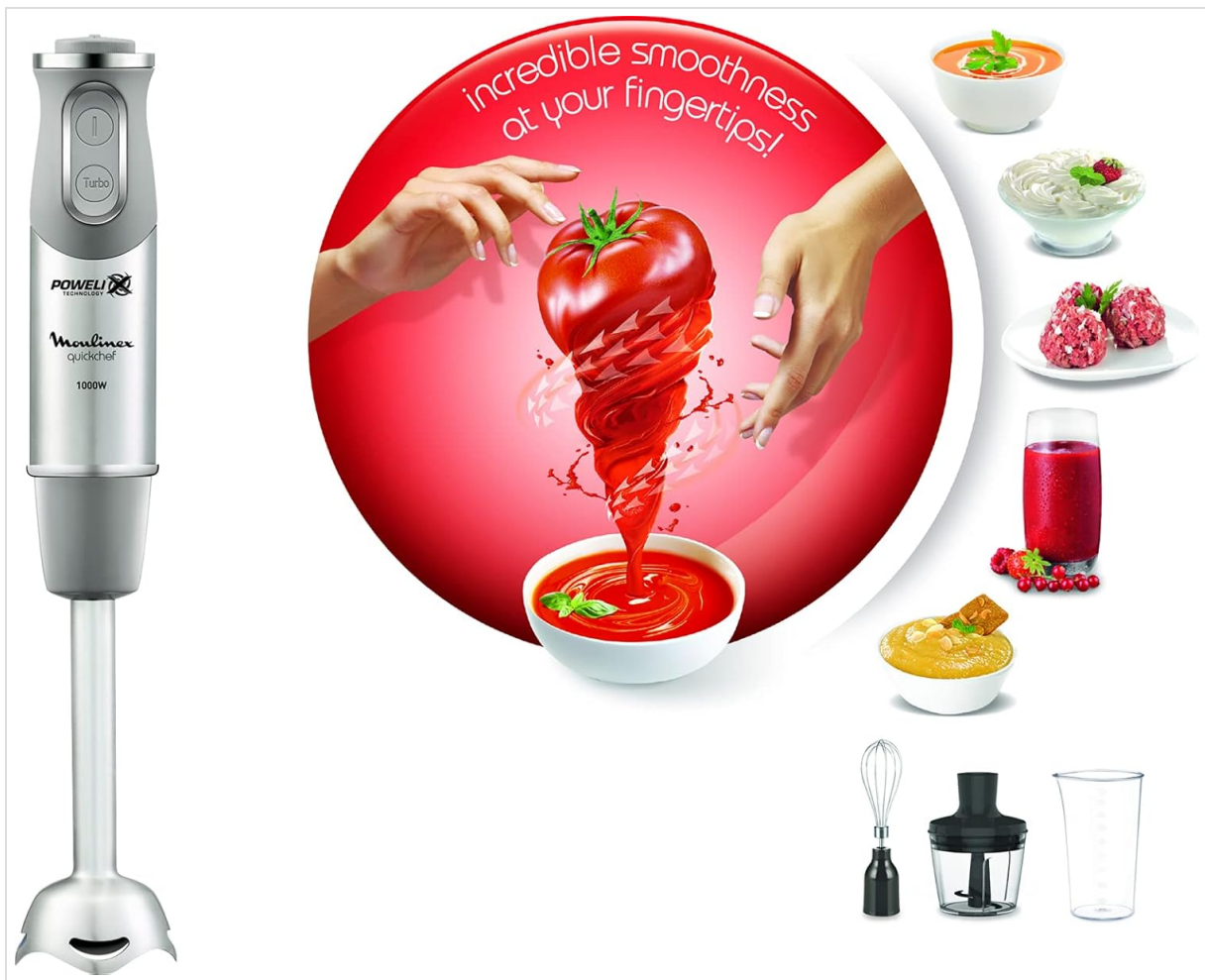
Figure 2.1: Moulinex Quickchef Lite Hand Blender with all included attachments.