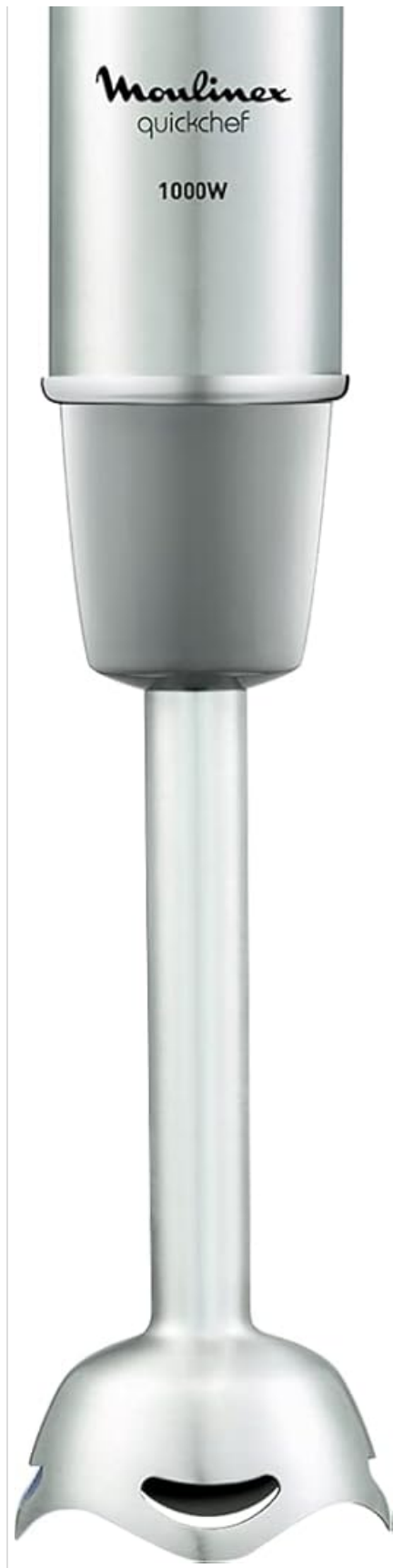
Figure 2.2: The main motor unit of the hand blender.