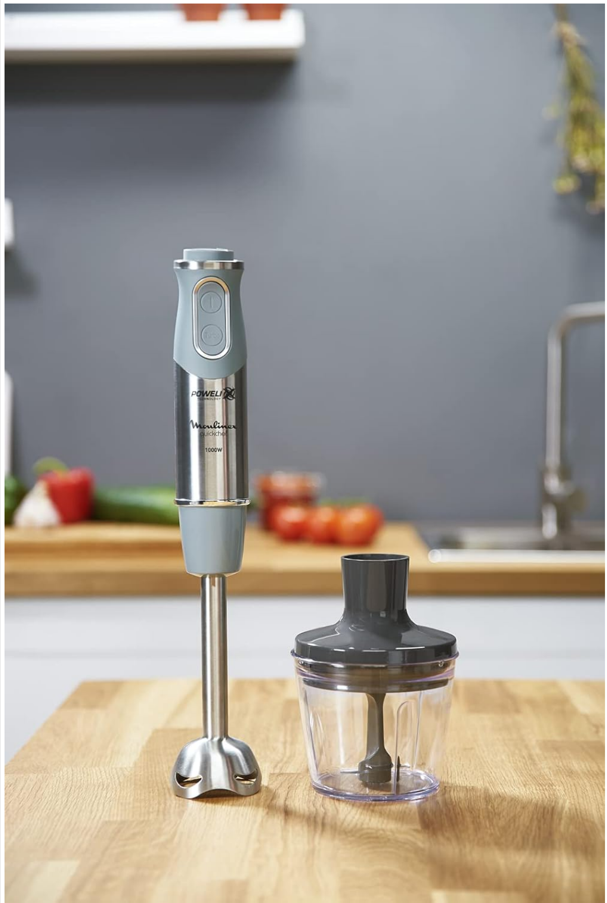
Figure 2.4: The hand blender assembled with the chopper attachment.