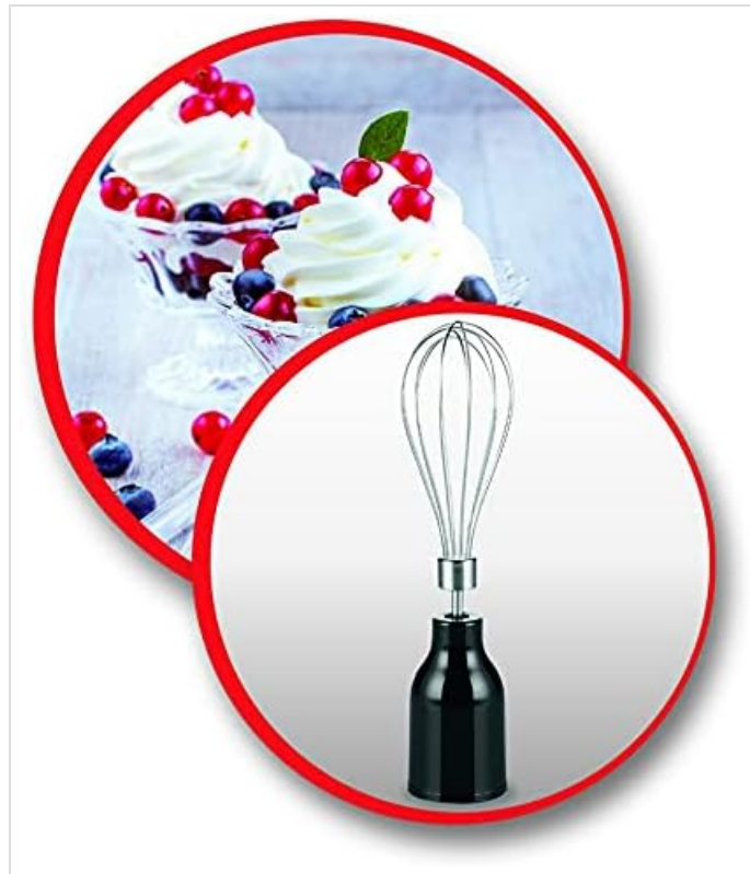
Figure 4.3: The whisk attachment is ideal for whipping cream or beating eggs.