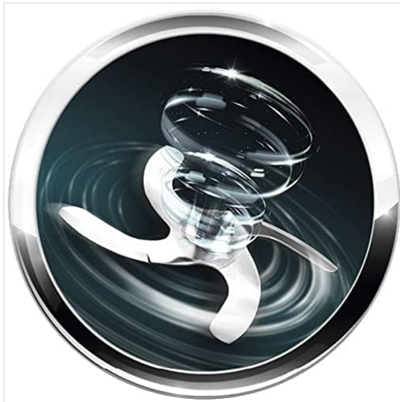
Figure 4.4: Close-up of the Powelix blades, engineered for superior blending.