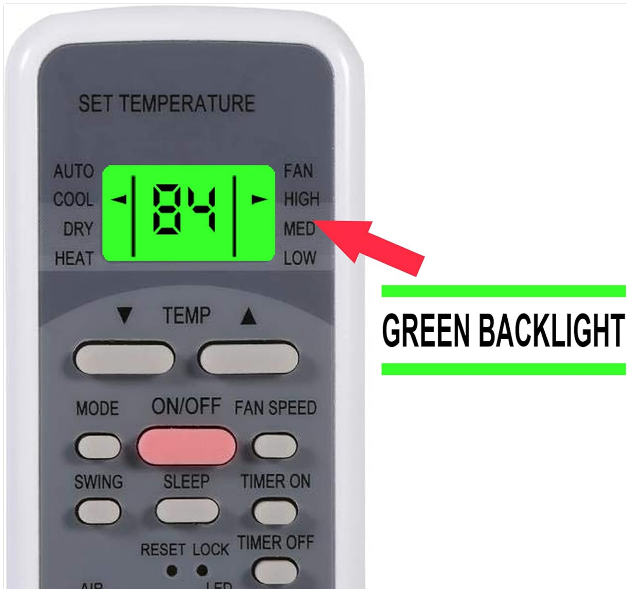
Image 5.2: Detailed view of the remote's buttons and green backlit display.