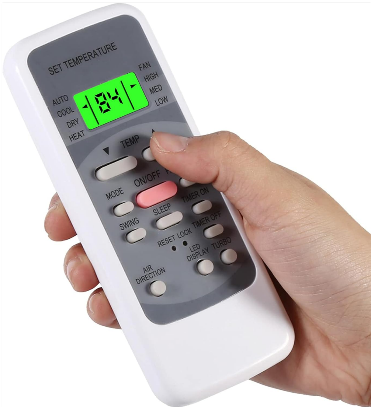
Image 5.1: Proper handling of the remote control during operation.