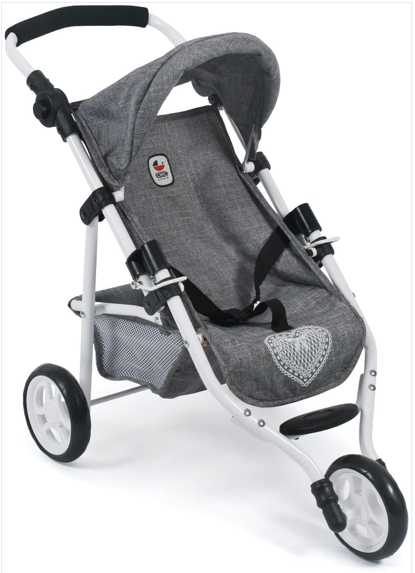
Image 1: Front view of the assembled doll's jogging buggy. This image shows the main structure, seat, canopy, and front wheel.