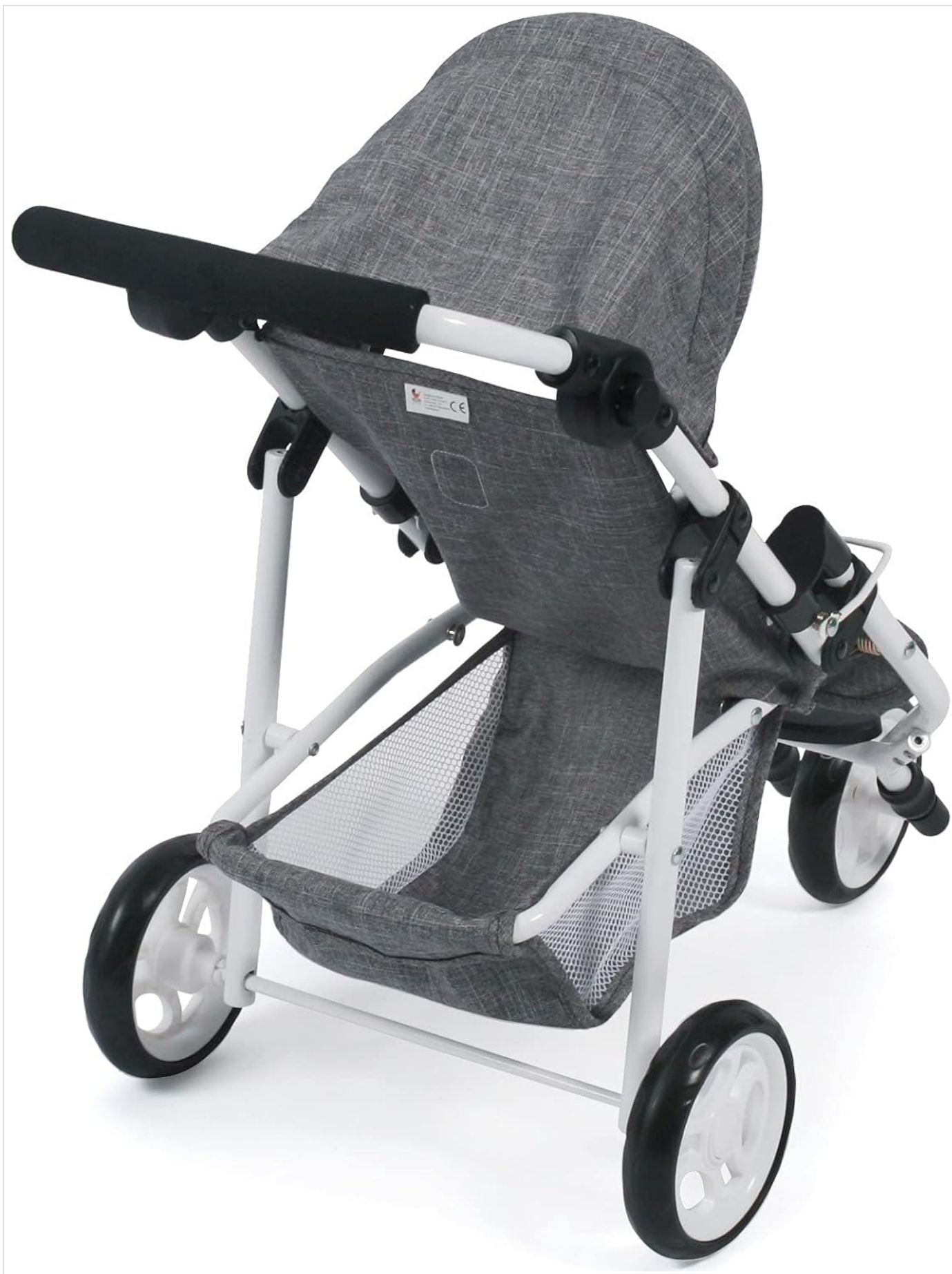
Image 2: Rear view of the doll's jogging buggy, highlighting the storage net beneath the seat.