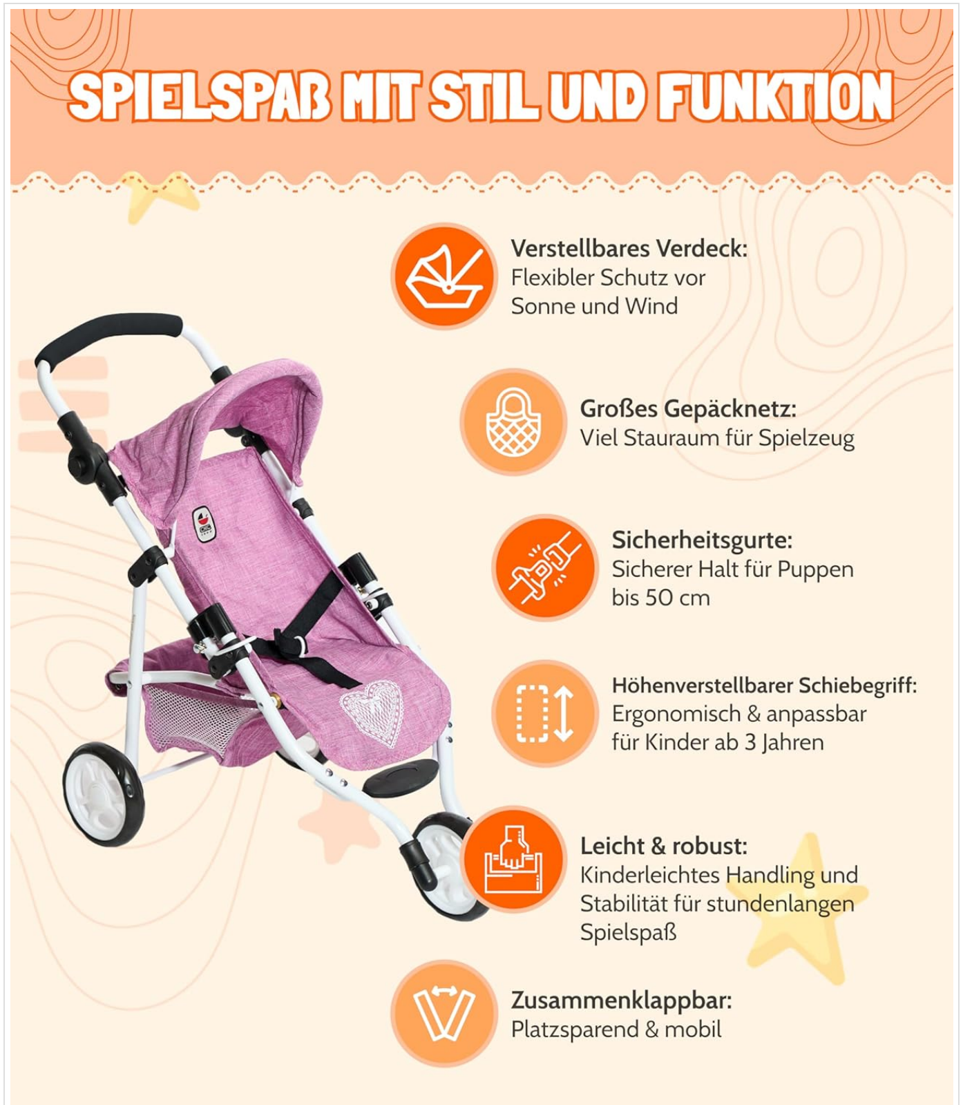
Image 3: Overview of key features, including the adjustable canopy for sun/wind protection, large luggage net for storage, safety belts for