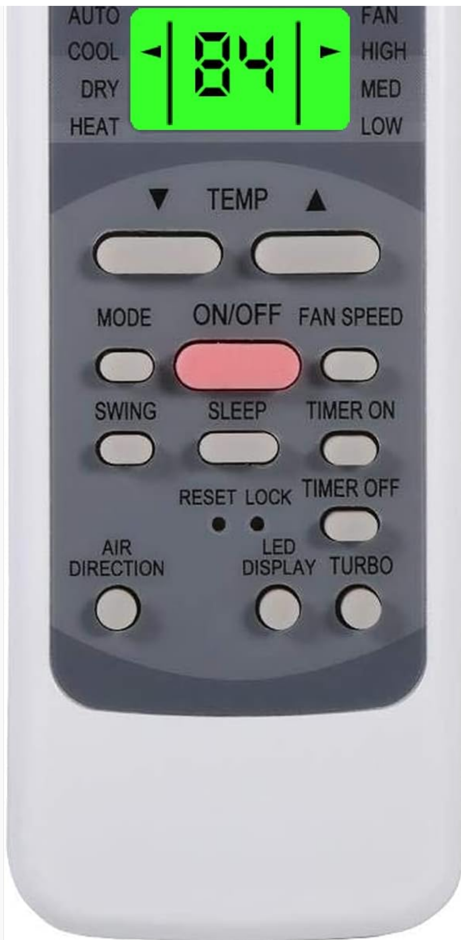
Image: Front view of the YAOHUI MI Replacement Remote Control.