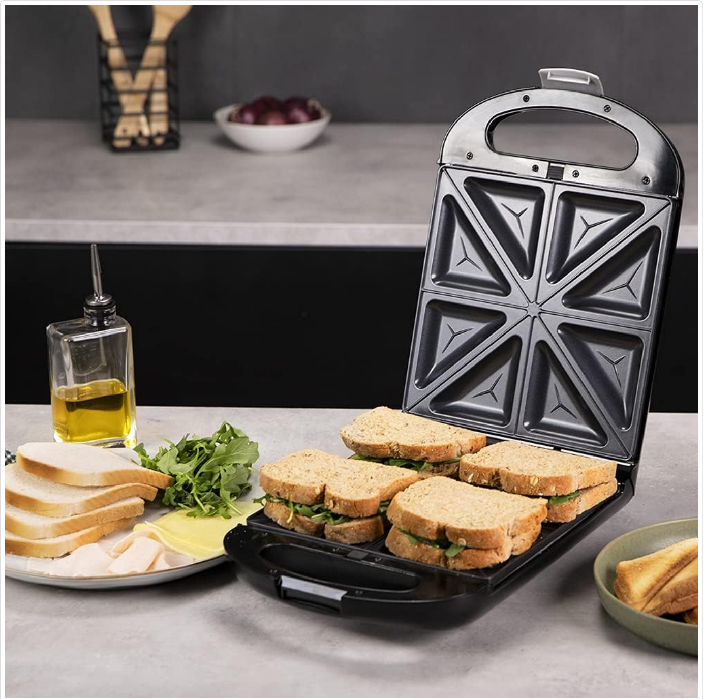
Figure 5.1: Preparing sandwiches on the dedicated sandwich plates.