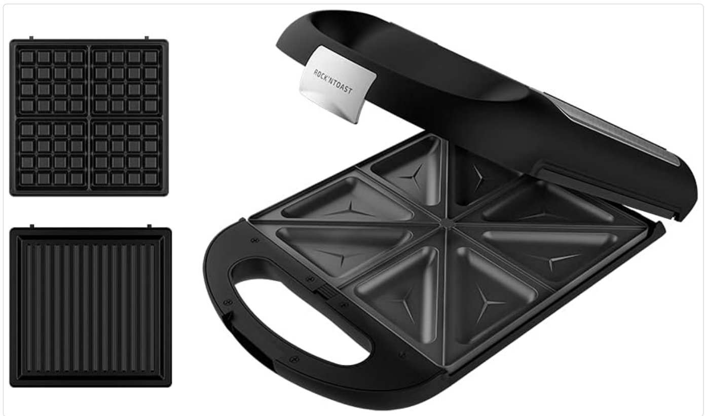
Figure 2.1: Cecotec Rock'nToast Family 3-in-1 Sandwich Maker in its closed position.