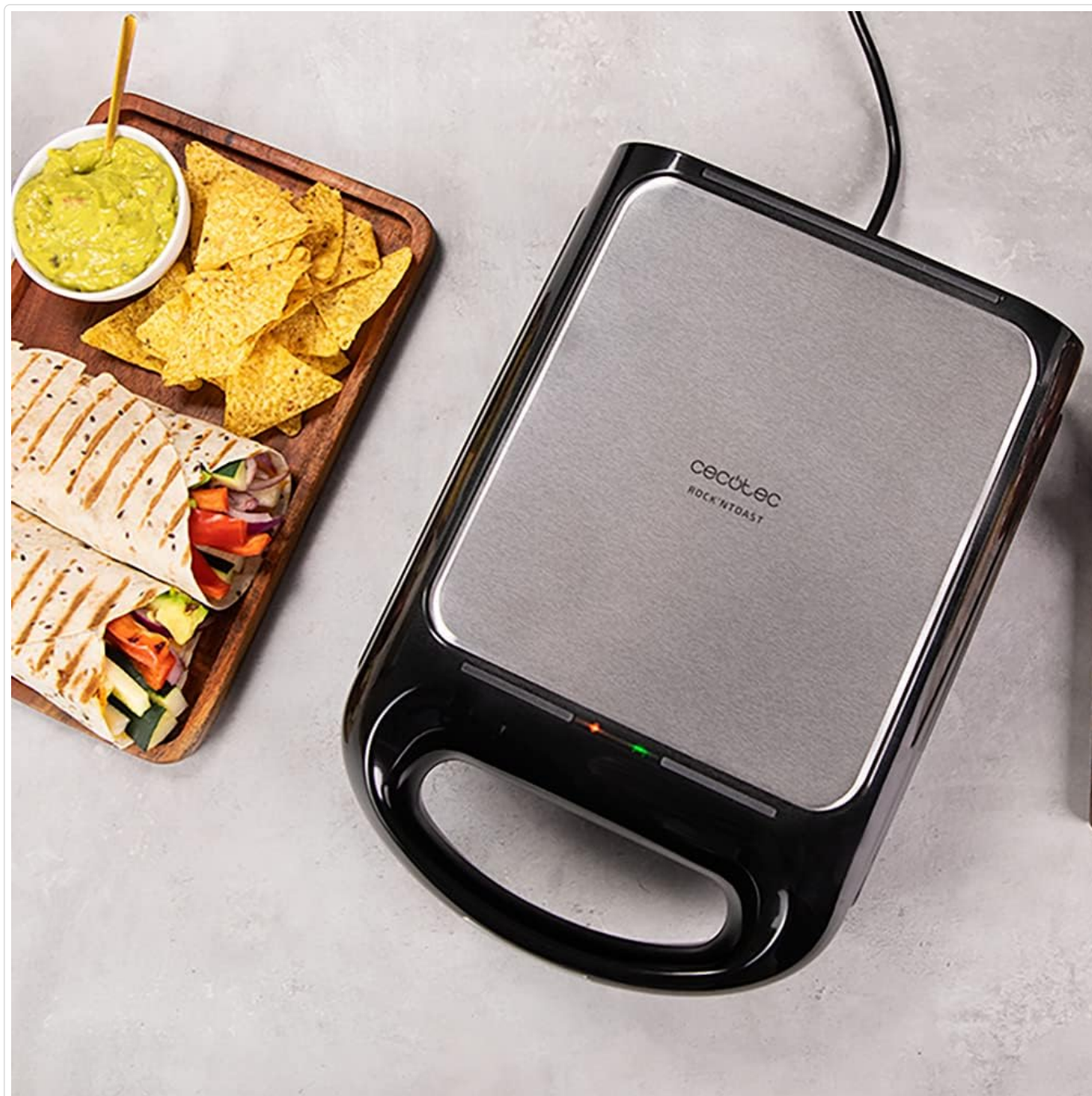
Figure 5.3: Grilling wraps on the grill plates.