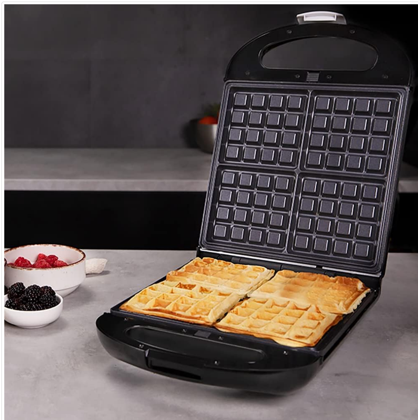
Figure 5.2: Cooking waffles using the waffle plates.