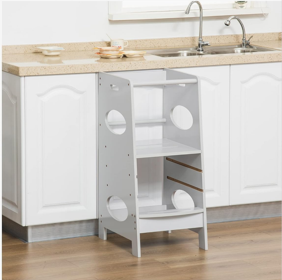
Image: The toddler tower highlighting its features, including assembly required.