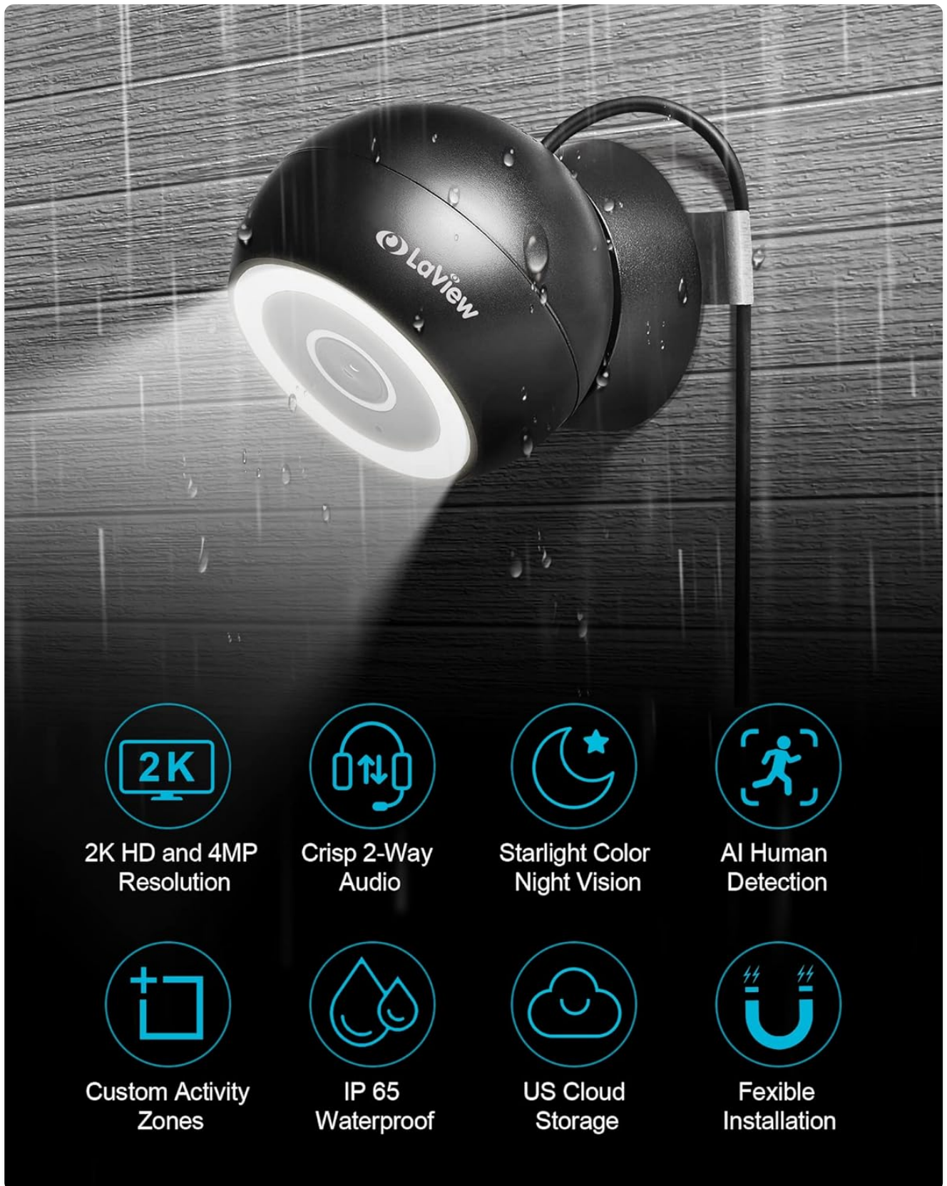
Image: LaView camera with rain droplets, highlighting its 2K HD resolution and IP65 waterproof rating.

The LaView cameras are designed with IP65 weather resistance, making them suitable for both indoor and outdoor environments. They deliver 4MP 2K clarity, ensuring detailed surveillance footage day and night.