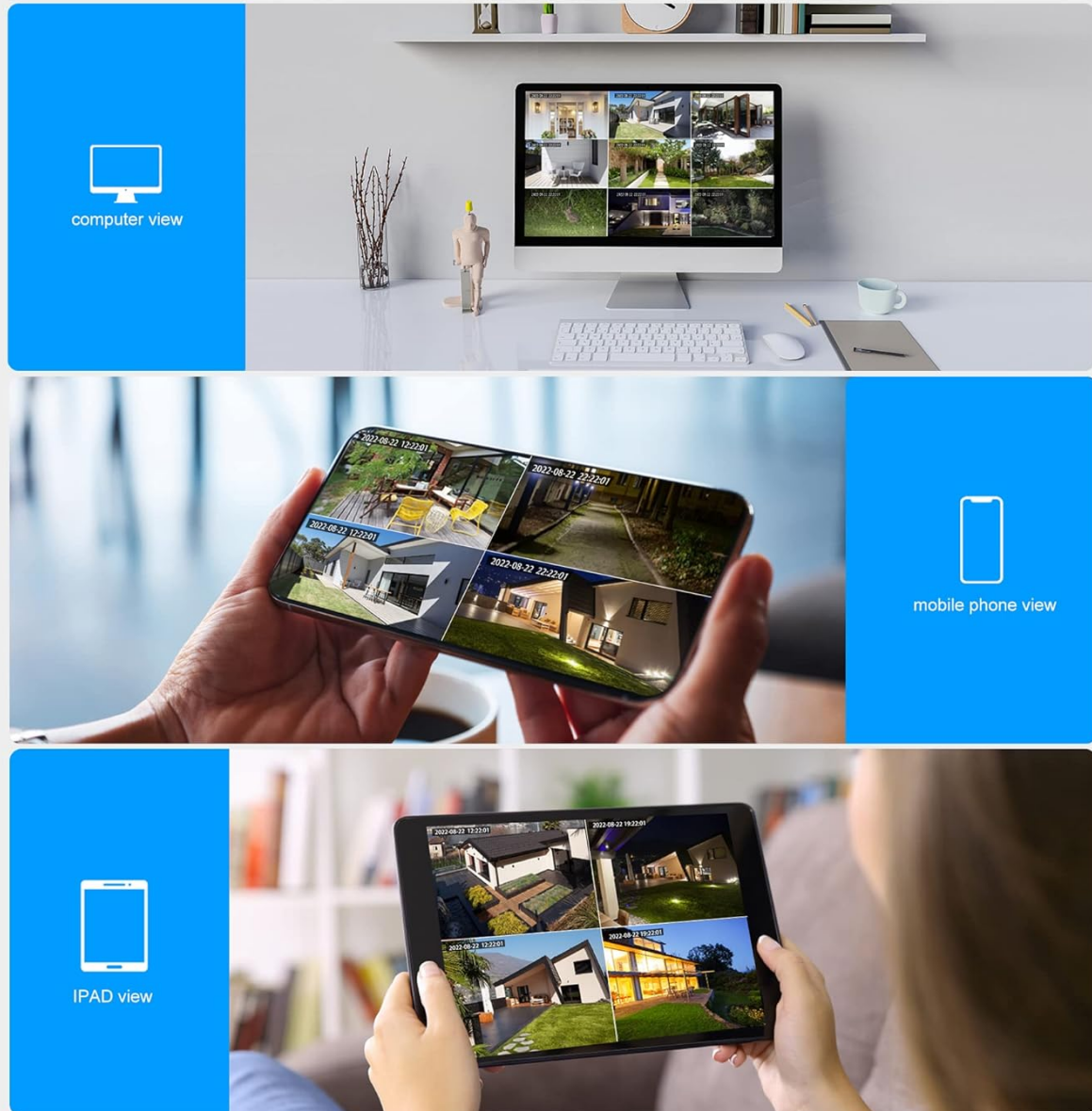
Image: Displays simultaneous viewing across multiple devices including computer, mobile phone, and iPad.