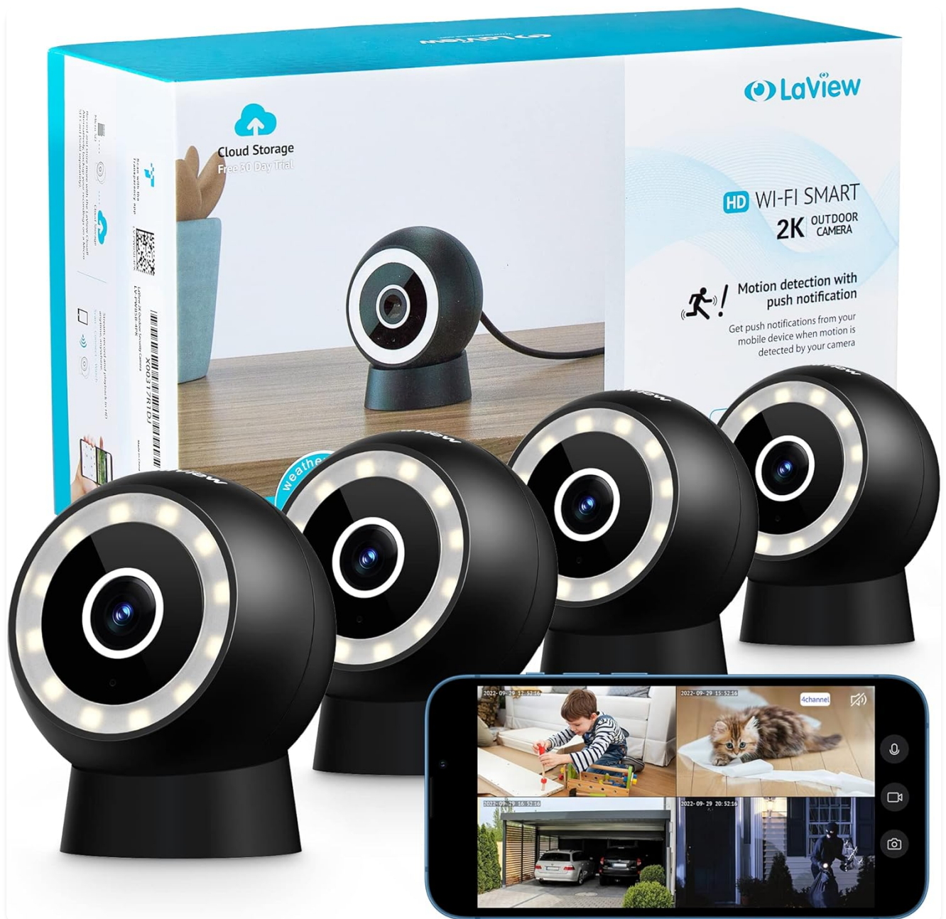
Image: LaView 4MP 2K Security Camera 4-Pack, showcasing the product and packaging.