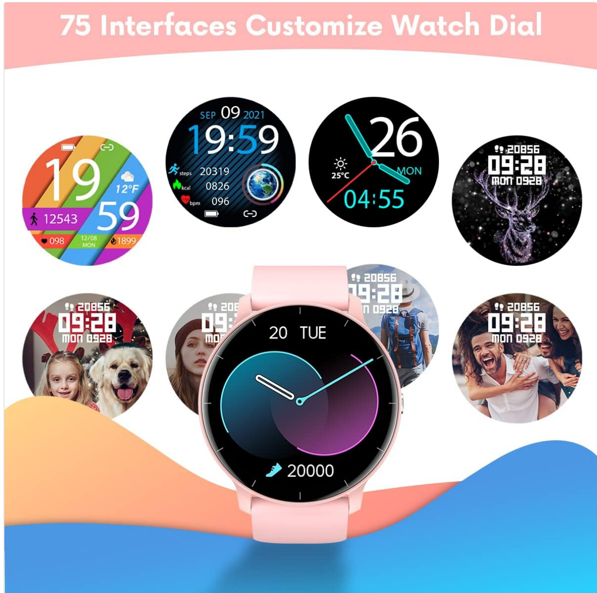
Image: Examples of customizable watch faces.

The smartwatch offers multiple watch faces. You can select from 5 main interfaces directly on the watch or choose from over 75 customizable options within the "Da Fit" app. The app also allows you to set personal photos as your watch face.