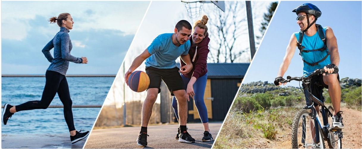
Image: Smartwatch supporting 8 different sports modes.