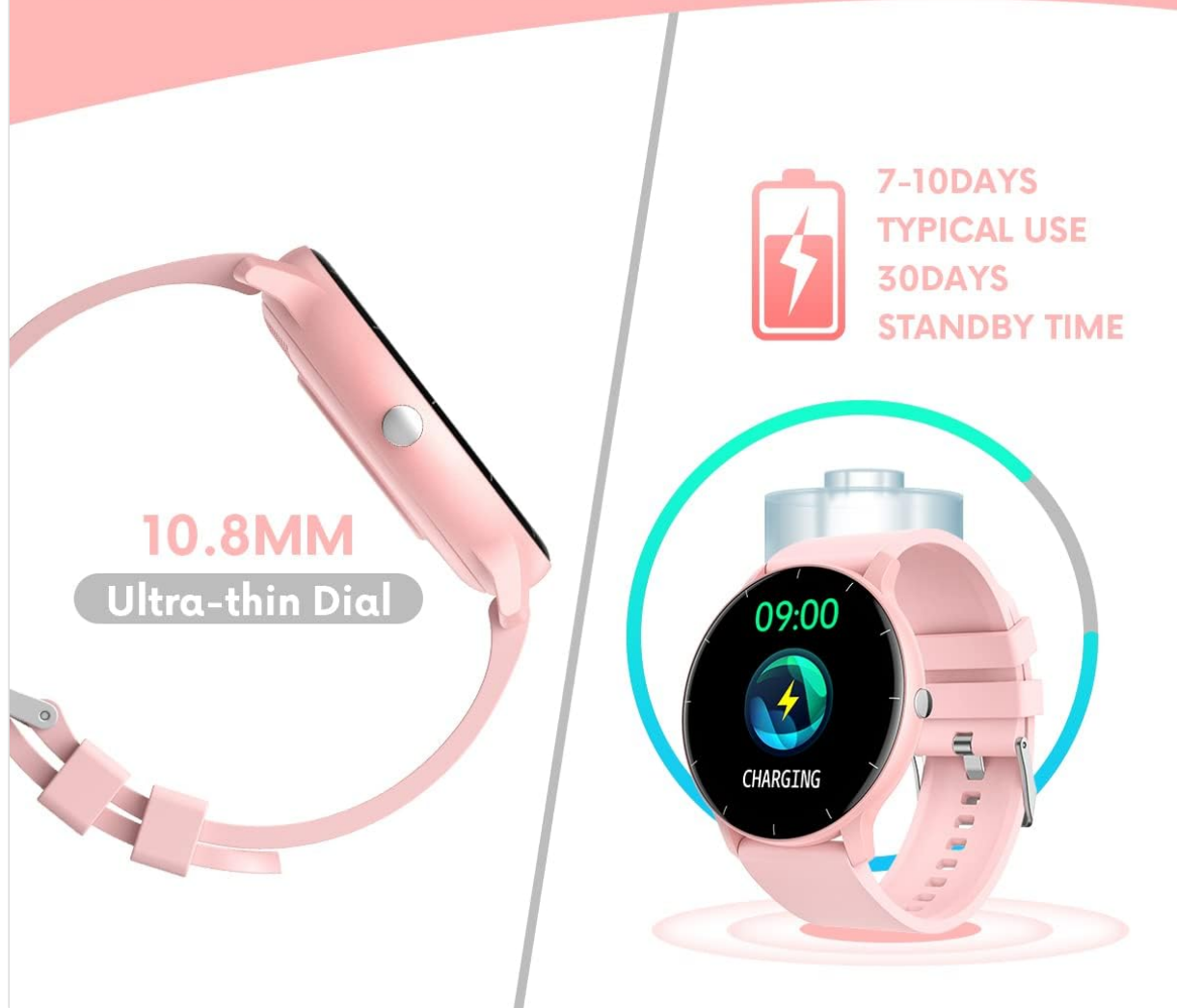
Image: Smartwatch displaying charging status and battery life details.