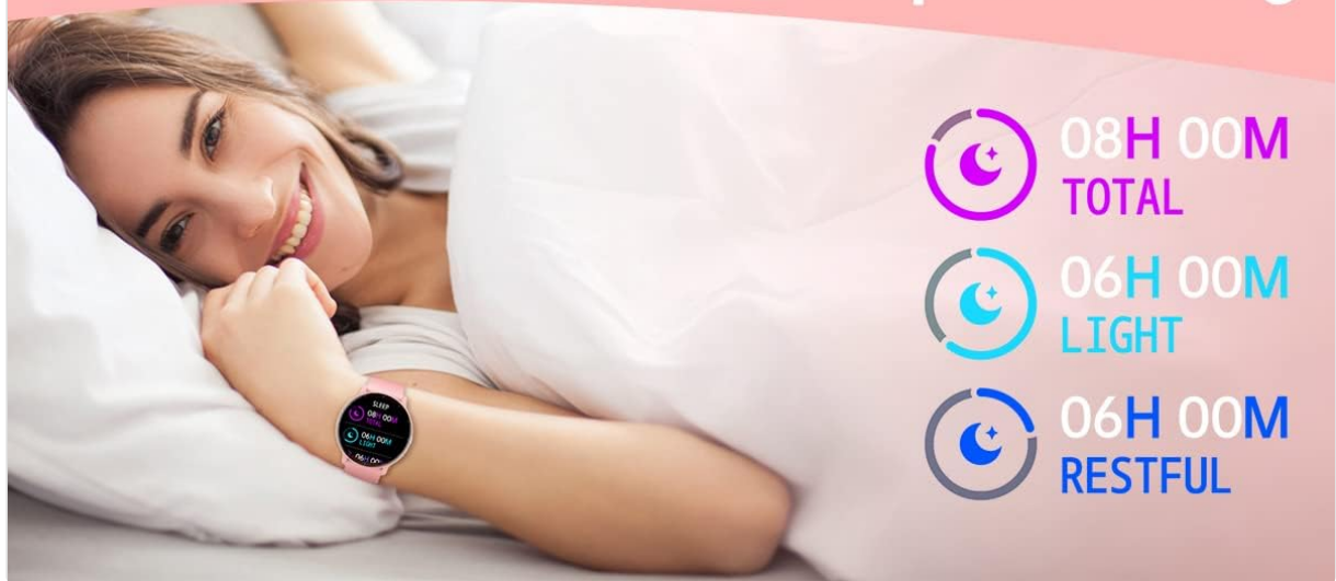
Image: Health and sleep monitoring features.