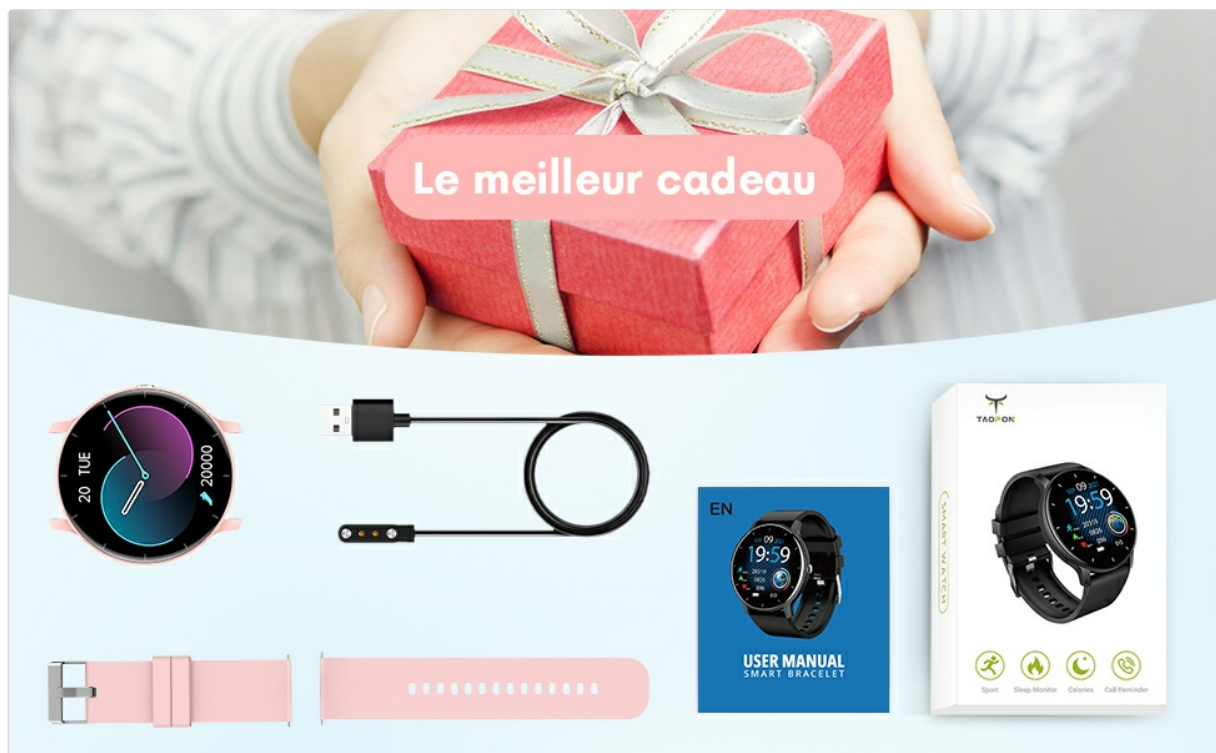
Image: Package contents of the TAOPON Smartwatch ZL02G.