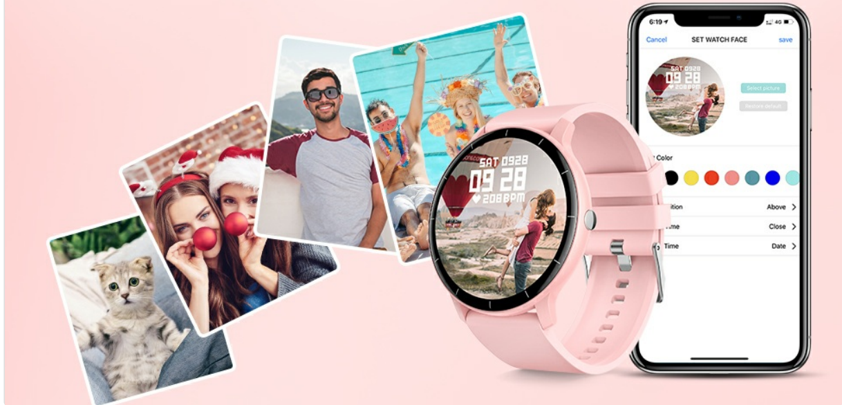
Image: Customizing watch faces using the companion app.

Personnalisez le cadran de la montre. Montrez votre personnalité