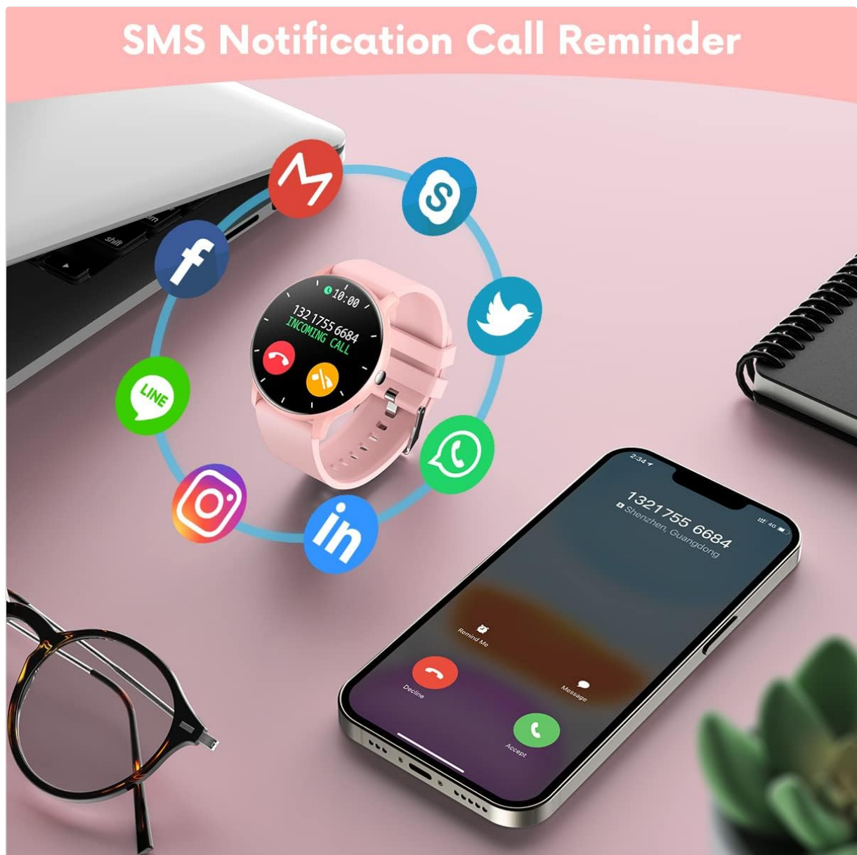
Image: Smartwatch displaying call and message notifications.