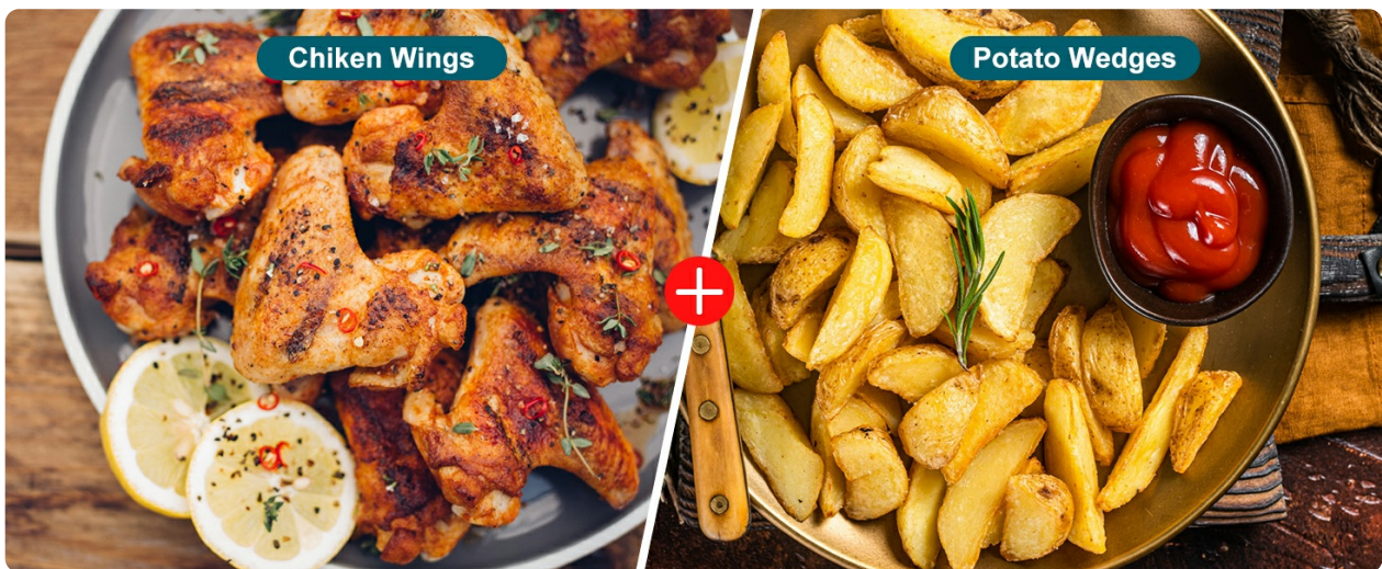
Figure 5.3: Example of Dual Cook: Air Roast followed by Broil for enhanced flavor.