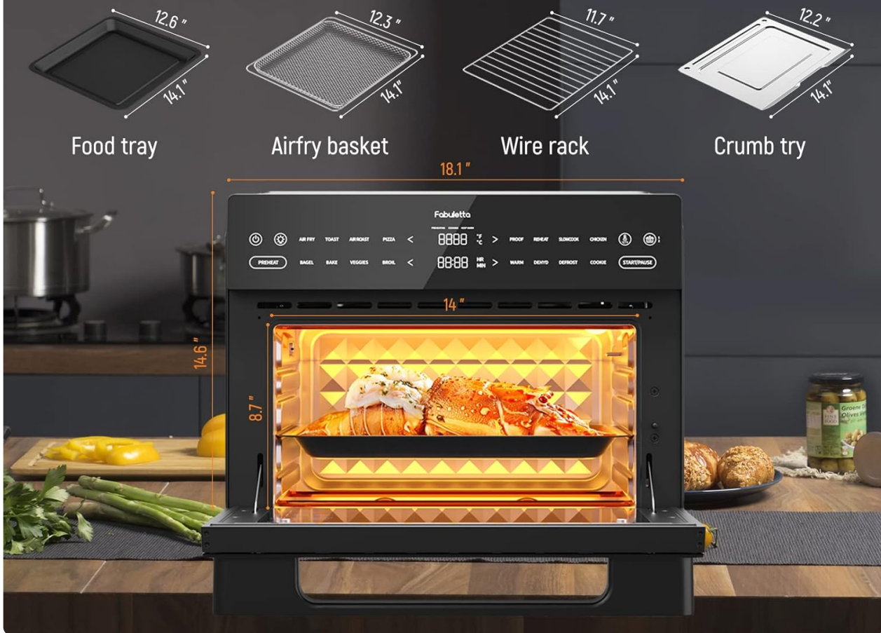
Figure 3.2: Included accessories for the Fabuletta FAO002.