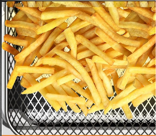
Fabuletta Air Fryer Toaster Oven