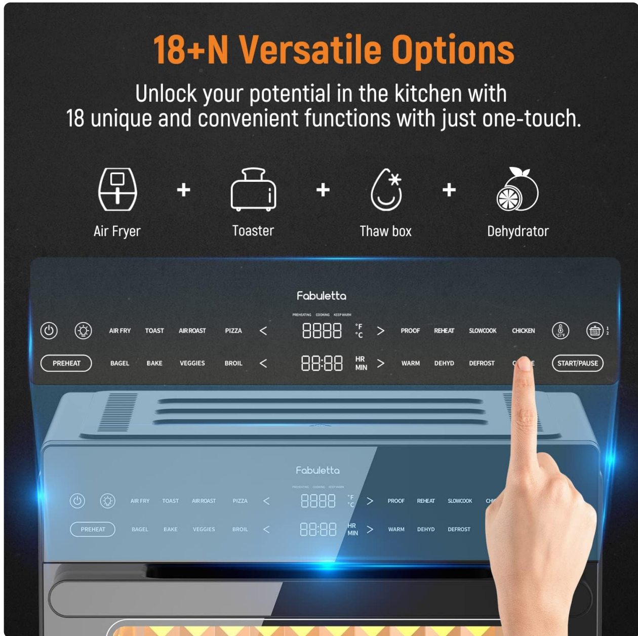
Figure 5.1: Digital Control Panel with 10 Preset Functions.

The Fabuletta FAO002 features an intuitive digital control panel for easy operation.