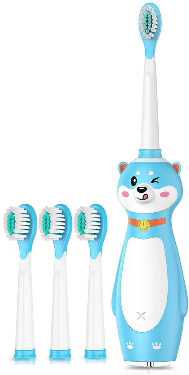
Image: The DADA-TECH DT-KE9 Kids Electric Toothbrush, showcasing its design.

Your browser does not support the video tag.