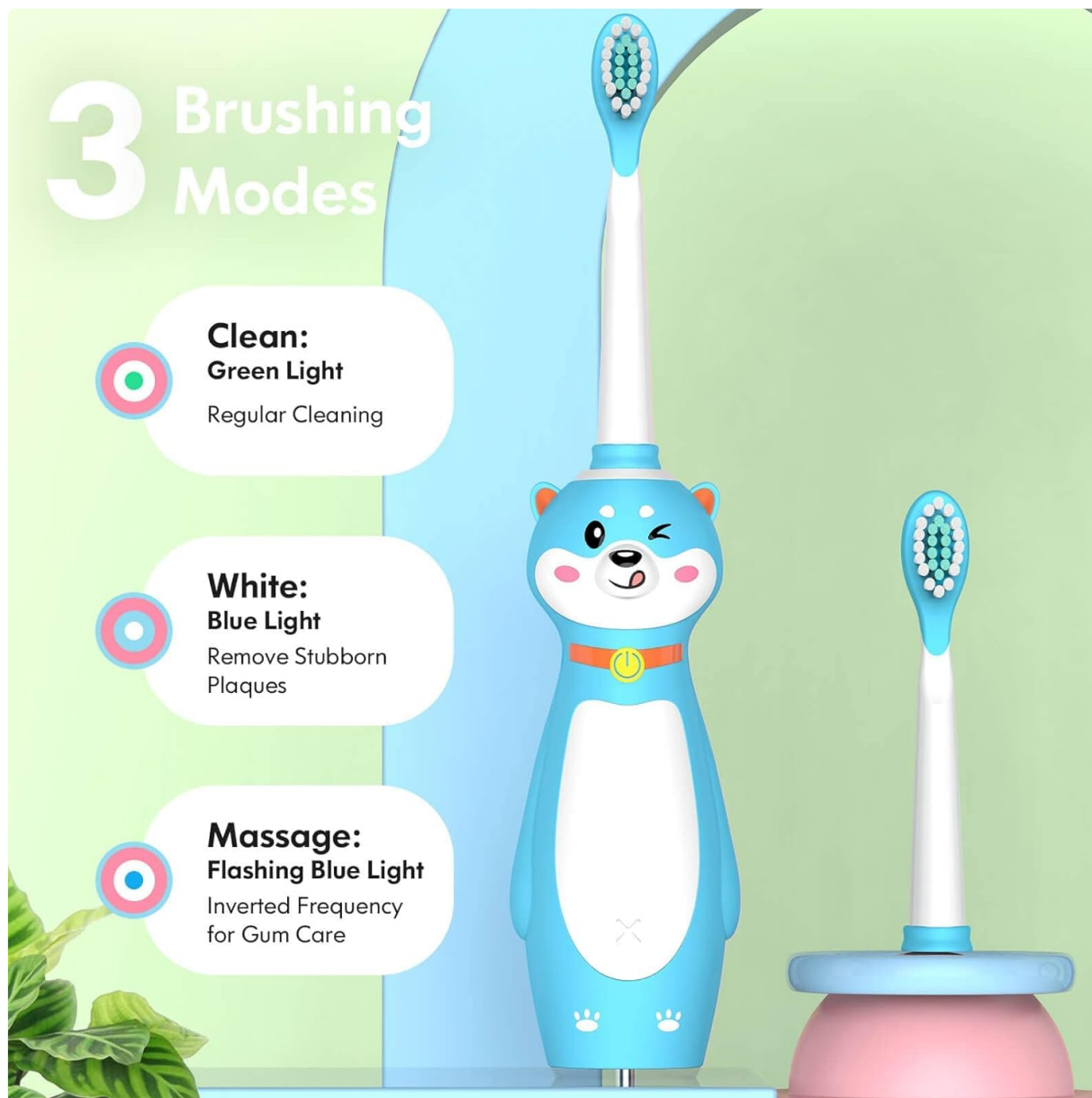
Image: Illustration of the three brushing modes and their indicators.

hold the power button for a few seconds in any mode.