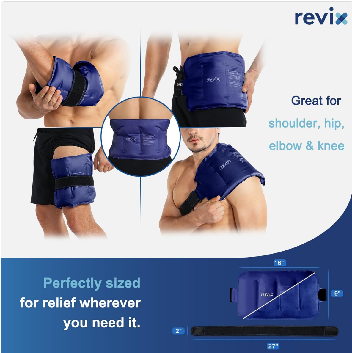
Image: The REVIX Ice Pack wrapped around a person's elbow, showing its use for joint pain and injuries.

Your browser does not support the video tag.