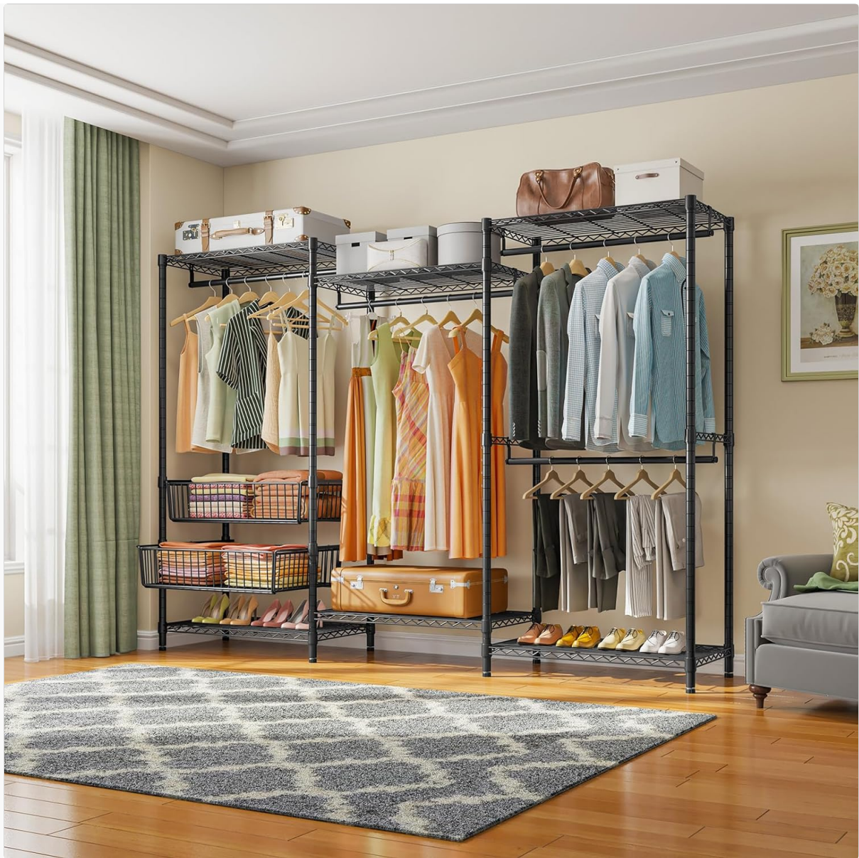
Image 1: The VIPEK V10 Garment Rack in a bedroom setting, showcasing its storage capacity with various clothing items, shoes, and boxes.