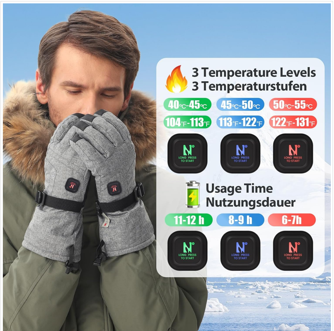
Image: A visual guide showing the three temperature levels (Red for High, Orange for Medium, Green for Low) with corresponding temperature ranges in Celsius and Fahrenheit, and approximate usage times for each setting.