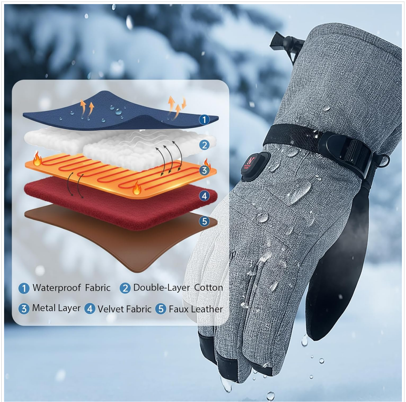
Image: A cross-section diagram of the glove's construction, illustrating its five layers: 1) Waterproof Fabric, 2) Double-Layer Cotton, 3) Metal Layer (heating element), 4) Velvet Fabric, and 5) Faux Leather palm.