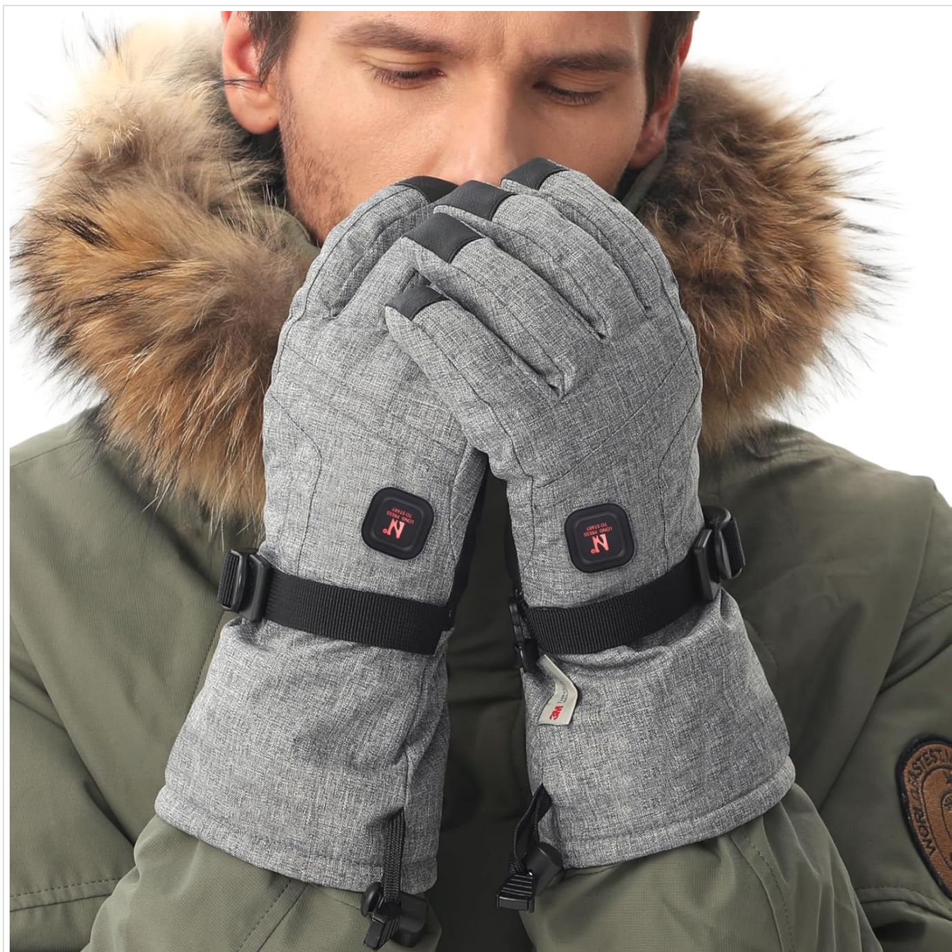
Image: A man wearing the gray Aroma Season Heated Gloves, bringing his hands to his face, demonstrating their use in cold weather. The gloves feature a subtle heating indicator button on the back of each hand.