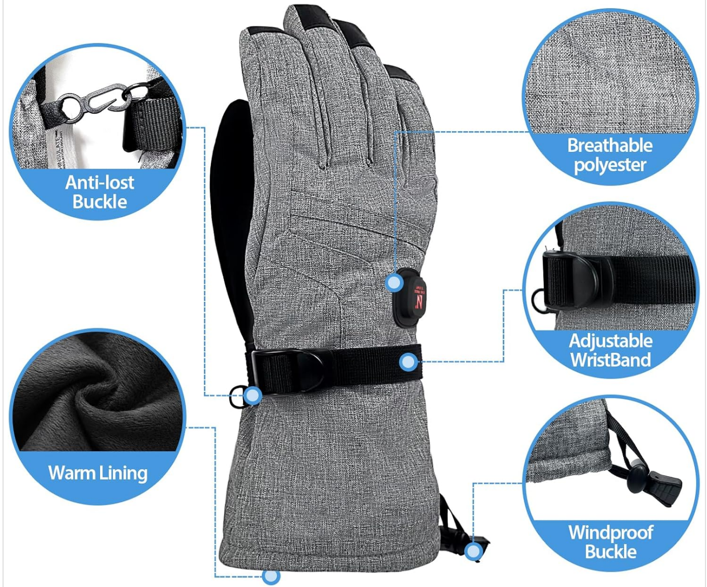
Image: An exploded view of the glove highlighting key design features such as the anti-lost buckle, breathable polyester fabric, adjustable wristband, warm lining, and windproof buckle at the cuff.