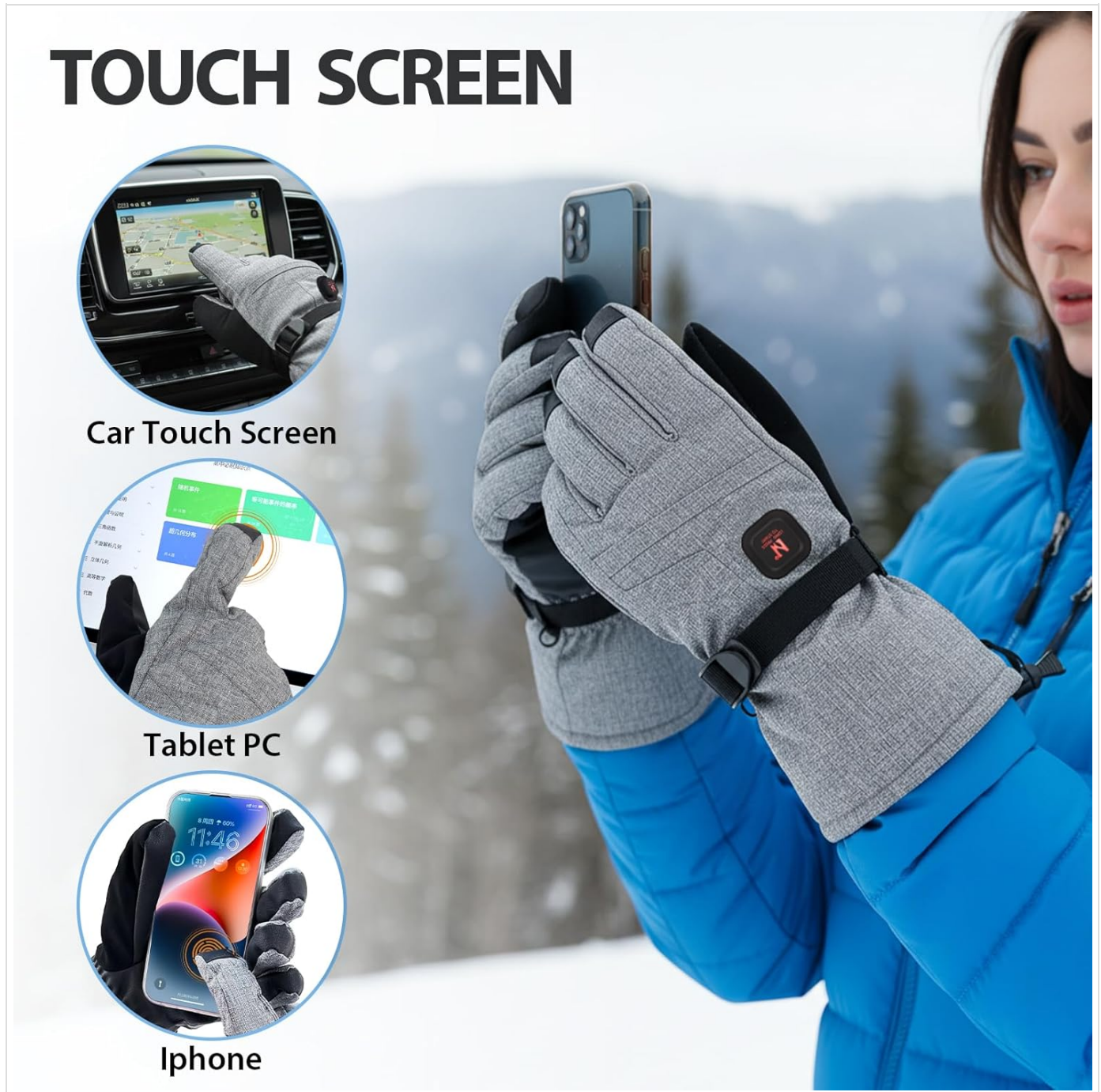
Image: A person wearing the heated gloves interacting with a smartphone, demonstrating the touch screen compatibility of the glove fingertips. Smaller insets show interaction with a car touch screen and a tablet.

The fingertips of these gloves are equipped with special conductive material, allowing you to operate touch screen devices without removing your gloves.