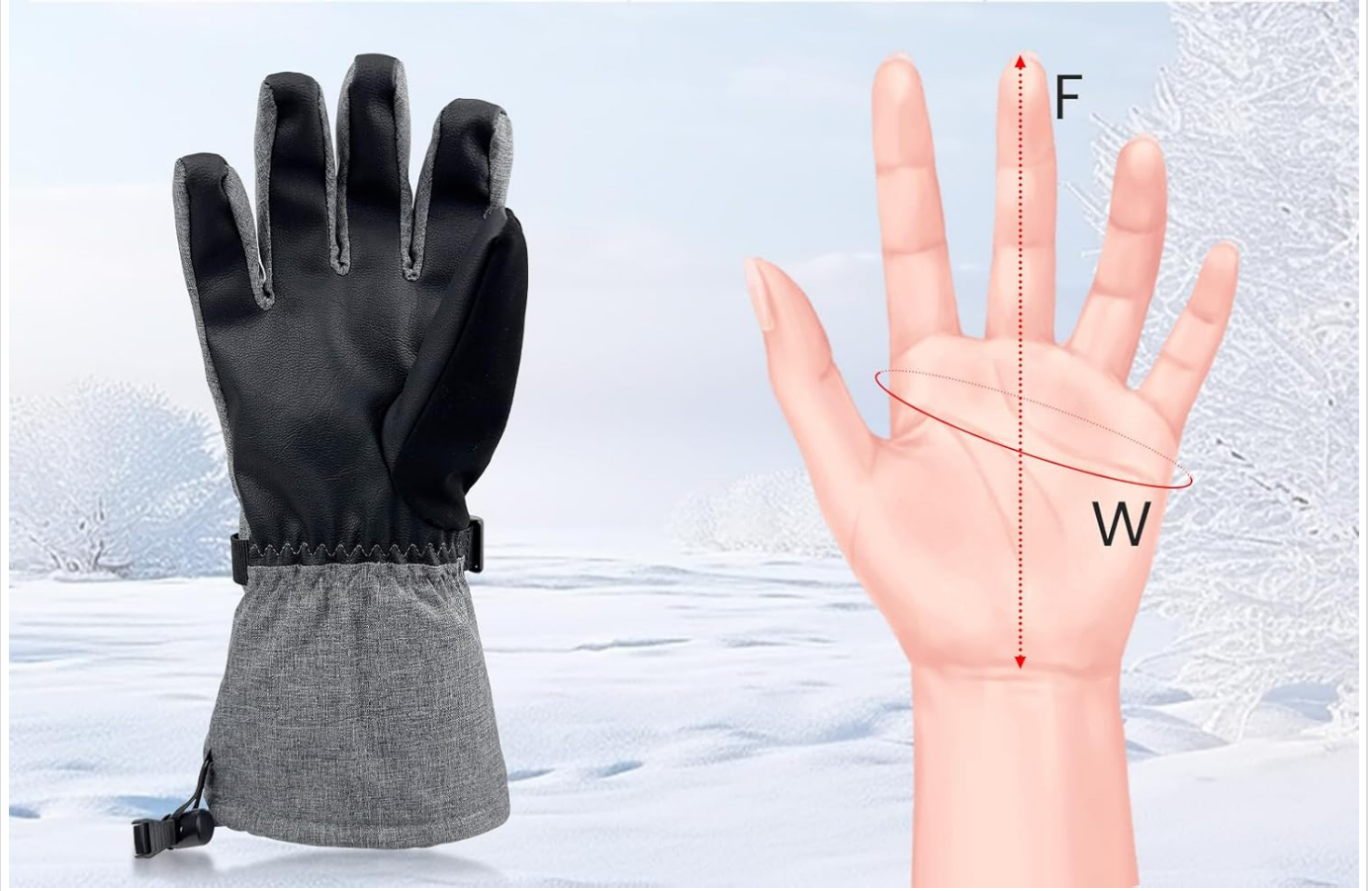
Image: A visual guide for measuring hand size, showing how to measure middle finger length (F) and palm width (W), accompanied by a table with S/M and L/XL size ranges in inches.