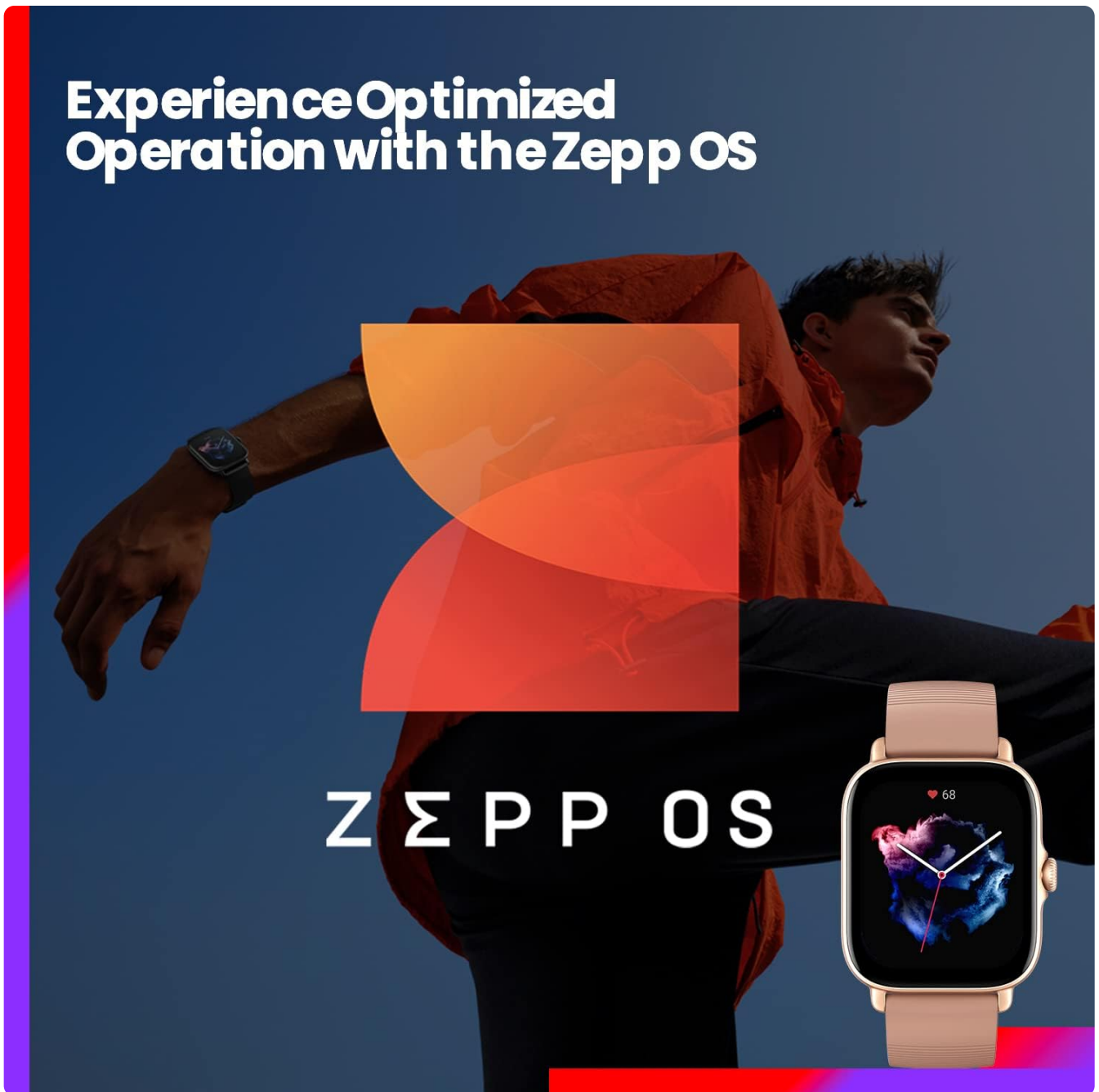
Figure 2: The Amazfit GTS 3 is available in multiple colors, offering a sleek and stylish design.