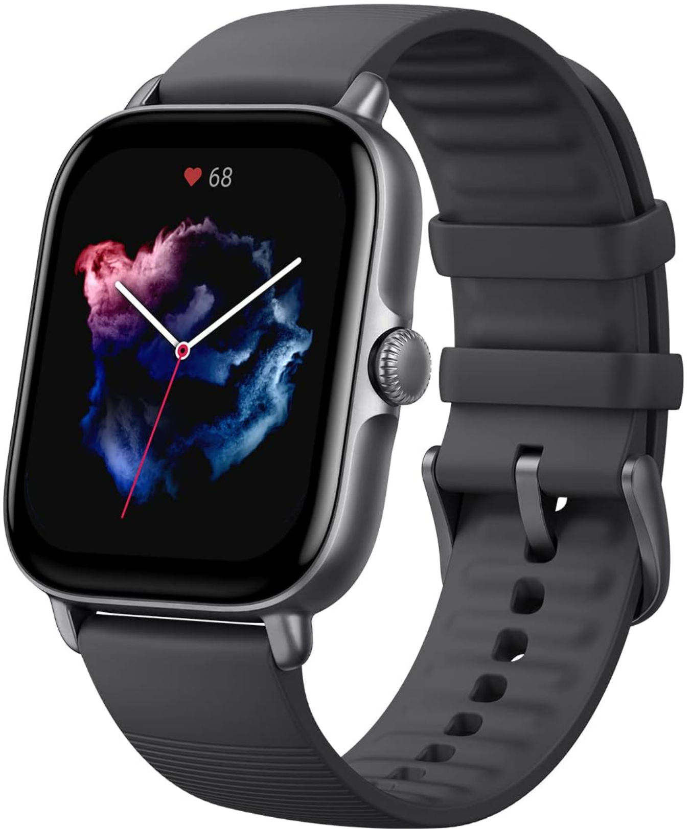
Figure 1: Amazfit GTS 3 Smart Watch in Graphite Black, showcasing its sleek design and vibrant display.