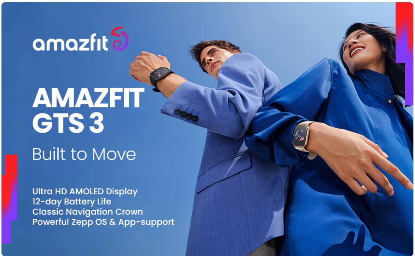
Figure 3: The Amazfit GTS 3 supports Alexa Built-In and an offline voice assistant for convenient control.

Alexa Built-In: Set alarms, ask questions, get translations, and more by speaking to your watch when connected to the internet.