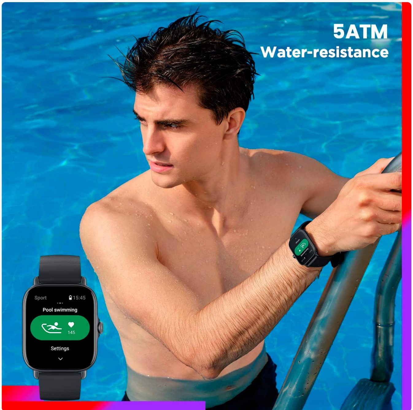
Figure 7: The Amazfit GTS 3 offers over 150 sports modes for diverse fitness tracking.