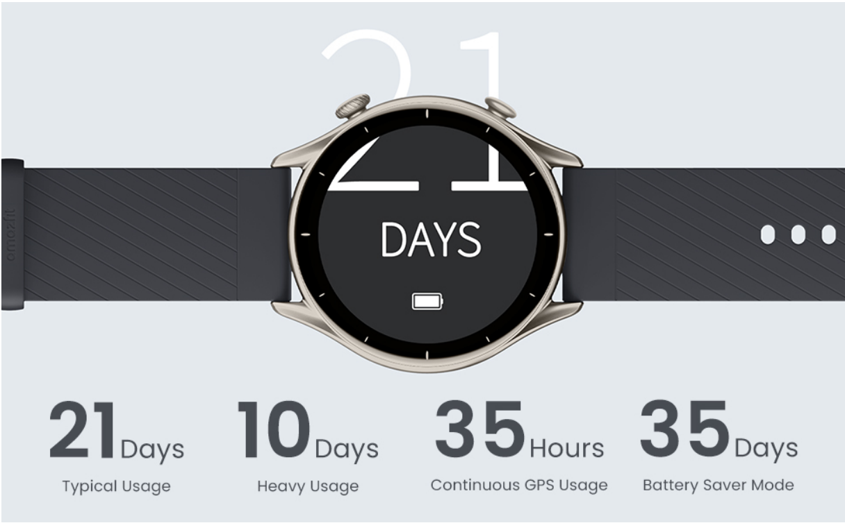
Image: Infographic detailing the battery life of the Amazfit GTR 3 under various usage scenarios.