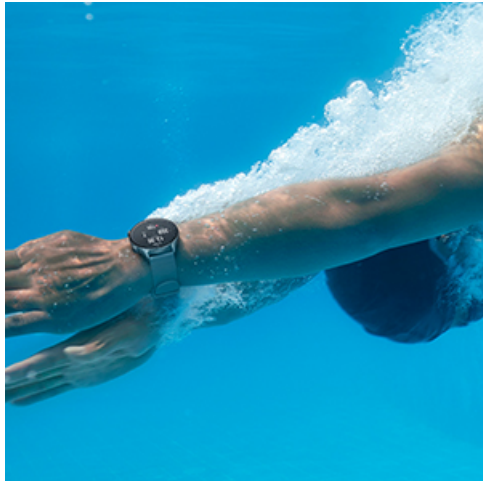
Image: The Amazfit GTR 3 Smart Watch displaying blood oxygen levels.