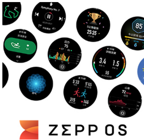
Image: The Amazfit GTR 3 Smart Watch displaying heart rate data.