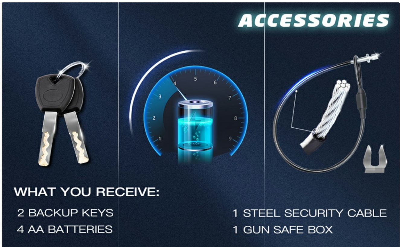
Image 3.1: Visual representation of the items included with the SOULYI gun safe, including the safe, keys, batteries, security cable, and decorative stickers.