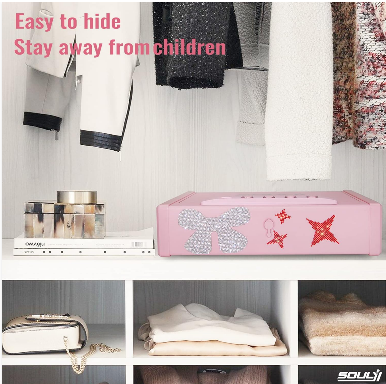
Image 6.2: The SOULYI gun safe discreetly placed on a shelf in a closet, illustrating its ease of concealment.