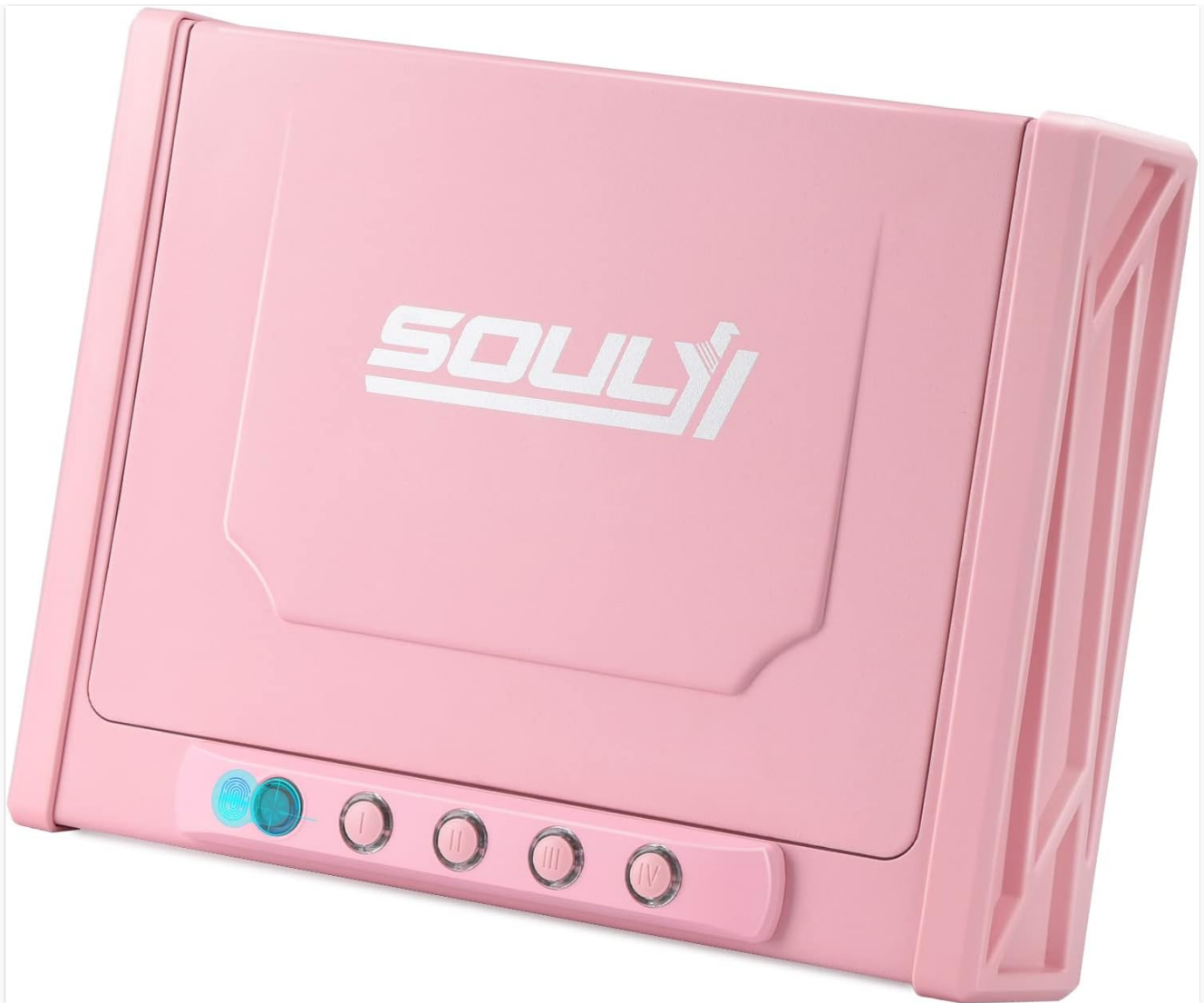
Image 1.1: The SOULYI Biometric Gun Safe in pink, featuring a biometric scanner and digital keypad.