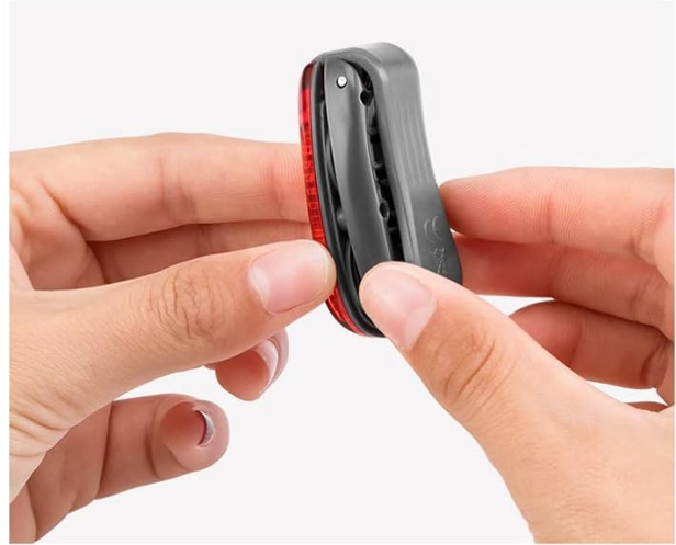
2. Open the back cover