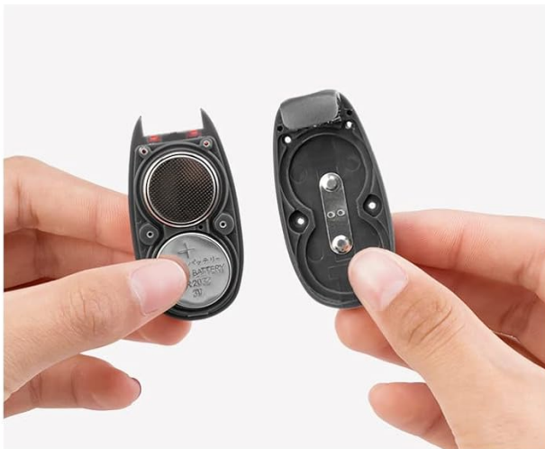
3. Replace the battery