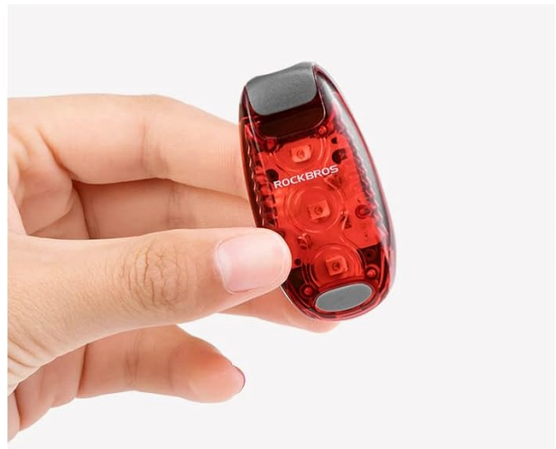
4. Turn all the screws back

Image: A step-by-step visual guide for replacing the batteries in the ROCKBROS bike light, including unscrewing the back cover and inserting new CR2032 batteries.