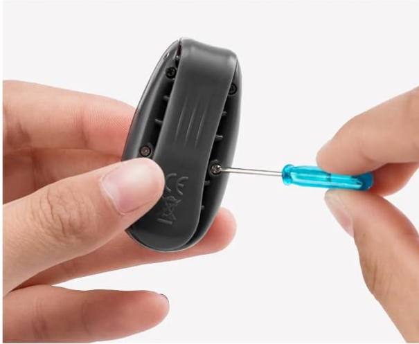
1. Unscrew all 4 screws