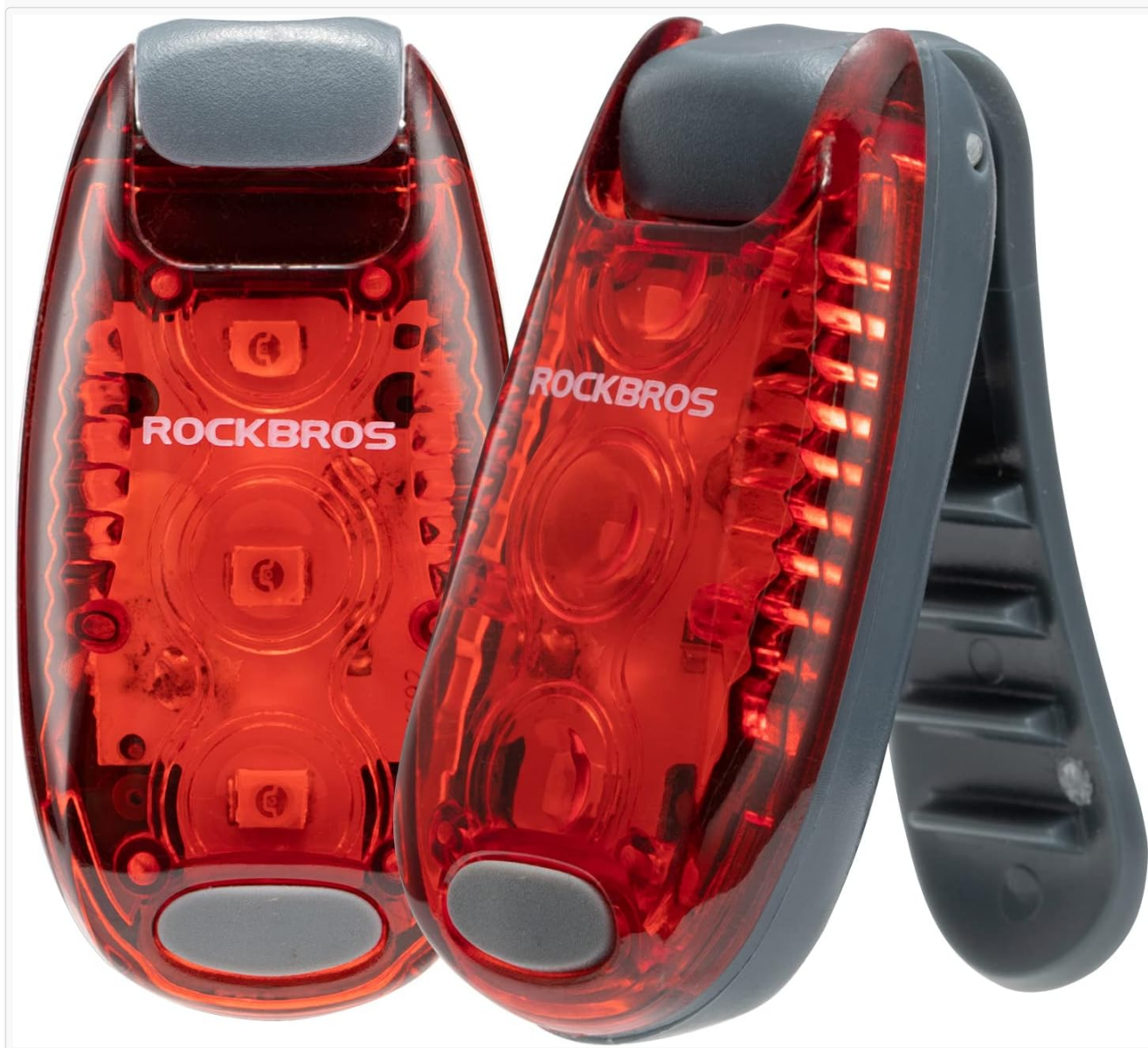
Image: Two ROCKBROS Small Bike Lights, showcasing their compact design and red casing with grey clips.

The light comes with two CR2032 batteries pre-installed. If the light does not turn on or is dim, you may need to replace the batteries. Refer to the "Battery Replacement Procedure" section for detailed steps.