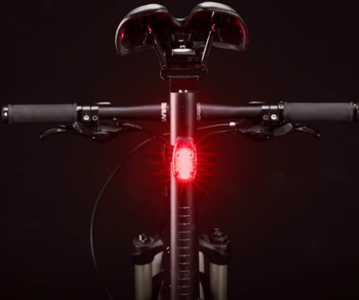
Image: The ROCKBROS bike light securely mounted on a bicycle's seat post, demonstrating its rear visibility.