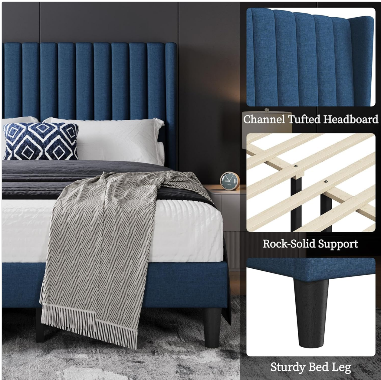
Image: Detailed view of the bed frame's construction. This image showcases the channel tufted headboard, the robust wooden slat support system, and the sturdy bed legs, emphasizing the quality and design elements.