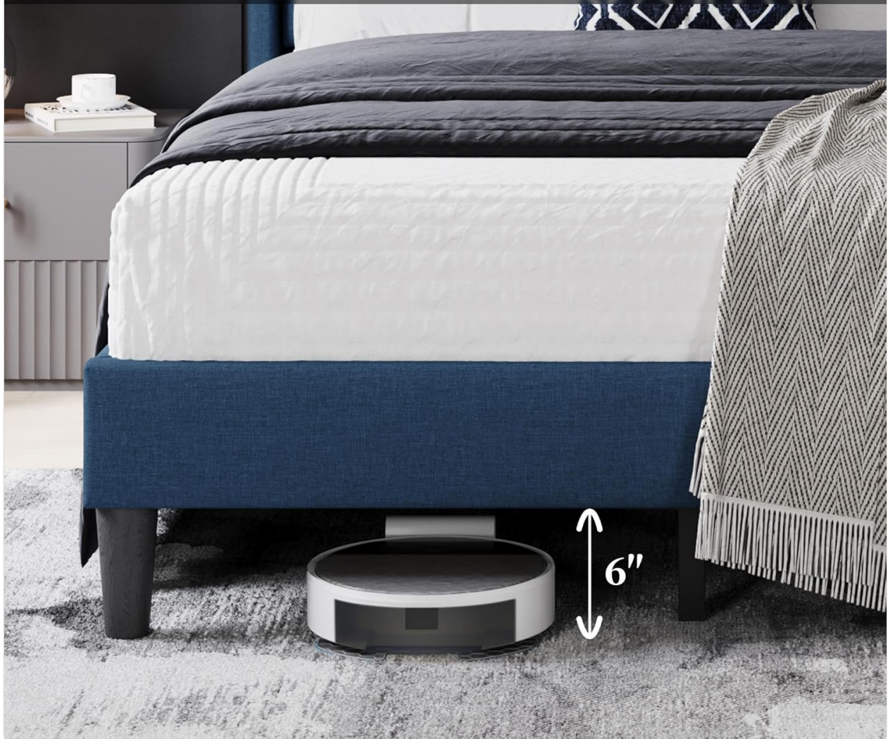
Image: Under-bed space for cleaning. This image illustrates the 6-inch clearance beneath the bed frame, demonstrating how a robot vacuum can easily pass underneath for convenient cleaning.

A 6" under-bed space allows the robot cleaner to pass freely.