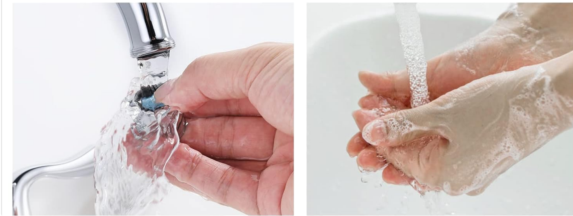
Figure 6: Removable Neoperl Aerator for easy cleaning.