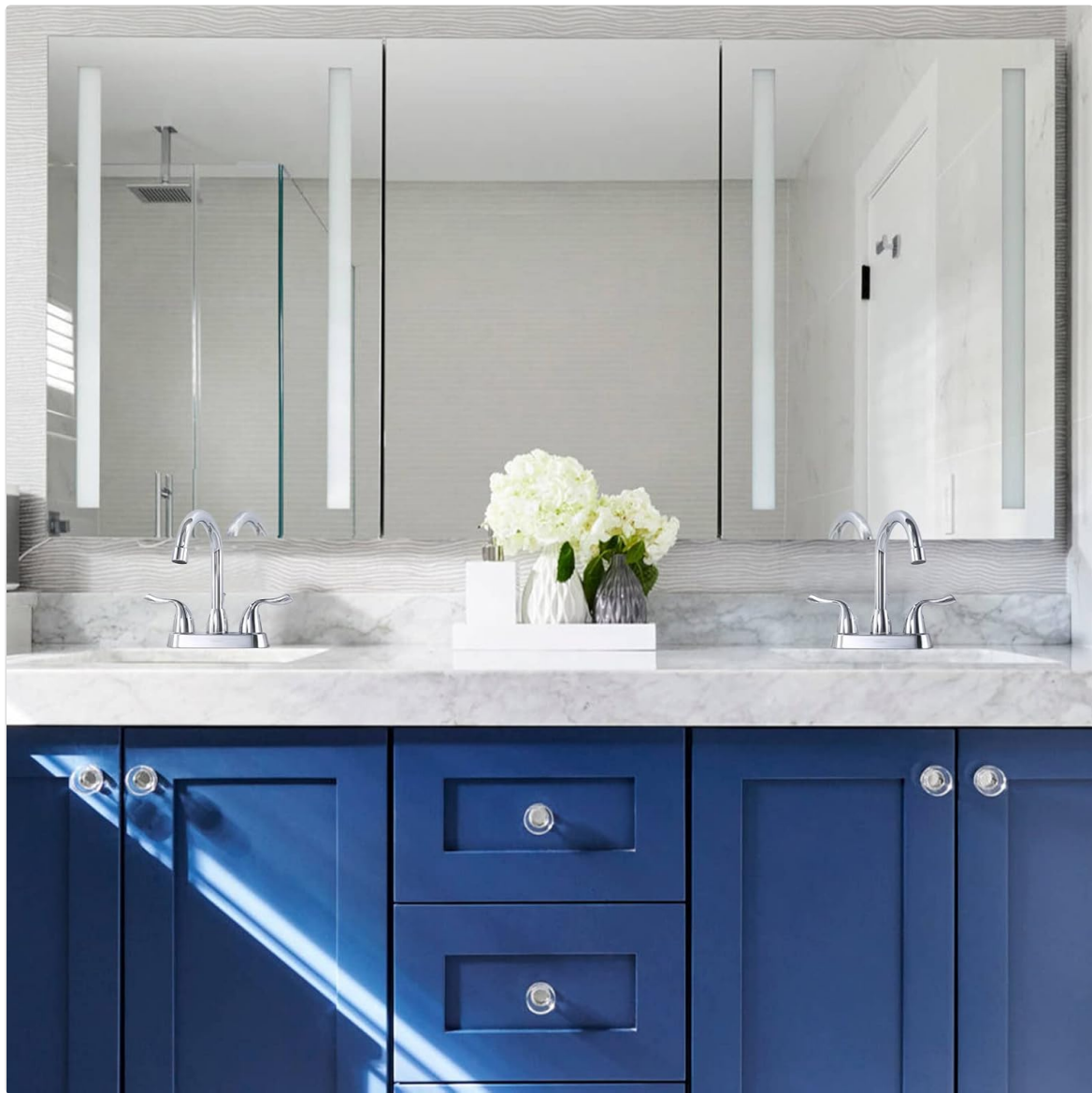
Figure 3: Example of installed ARCORA faucets.