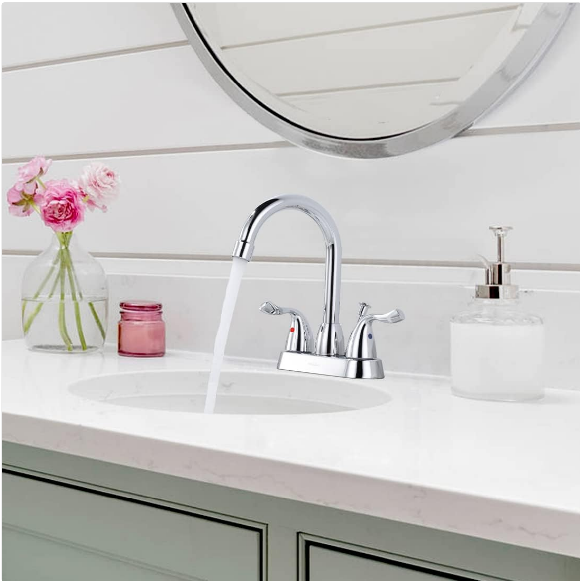
Figure 5: Faucet in operation.