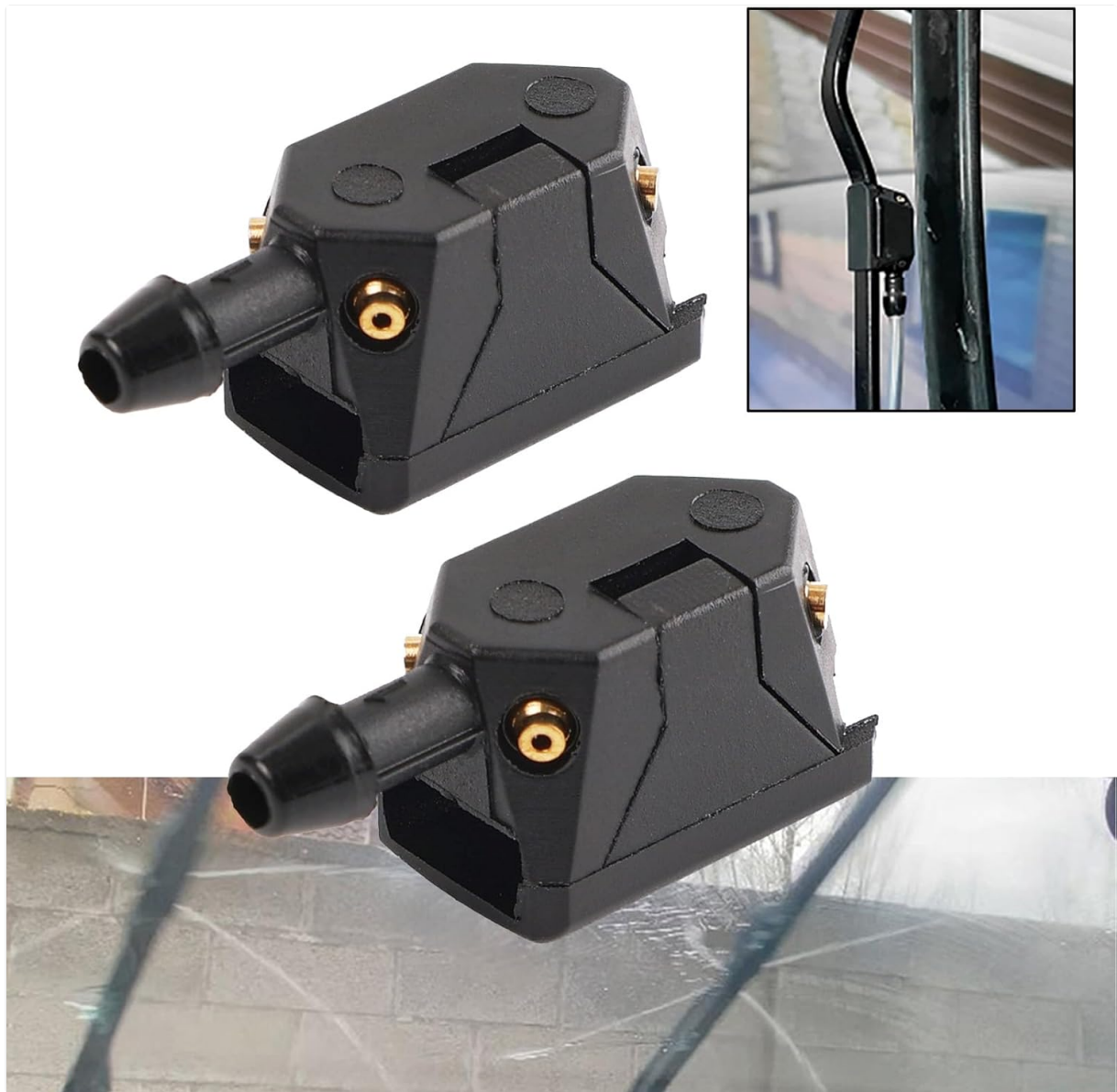
Image 1.1: XUKEY Universal 4-Way Windshield Washer Nozzles. These nozzles are designed to provide an efficient spray pattern for windshield cleaning.