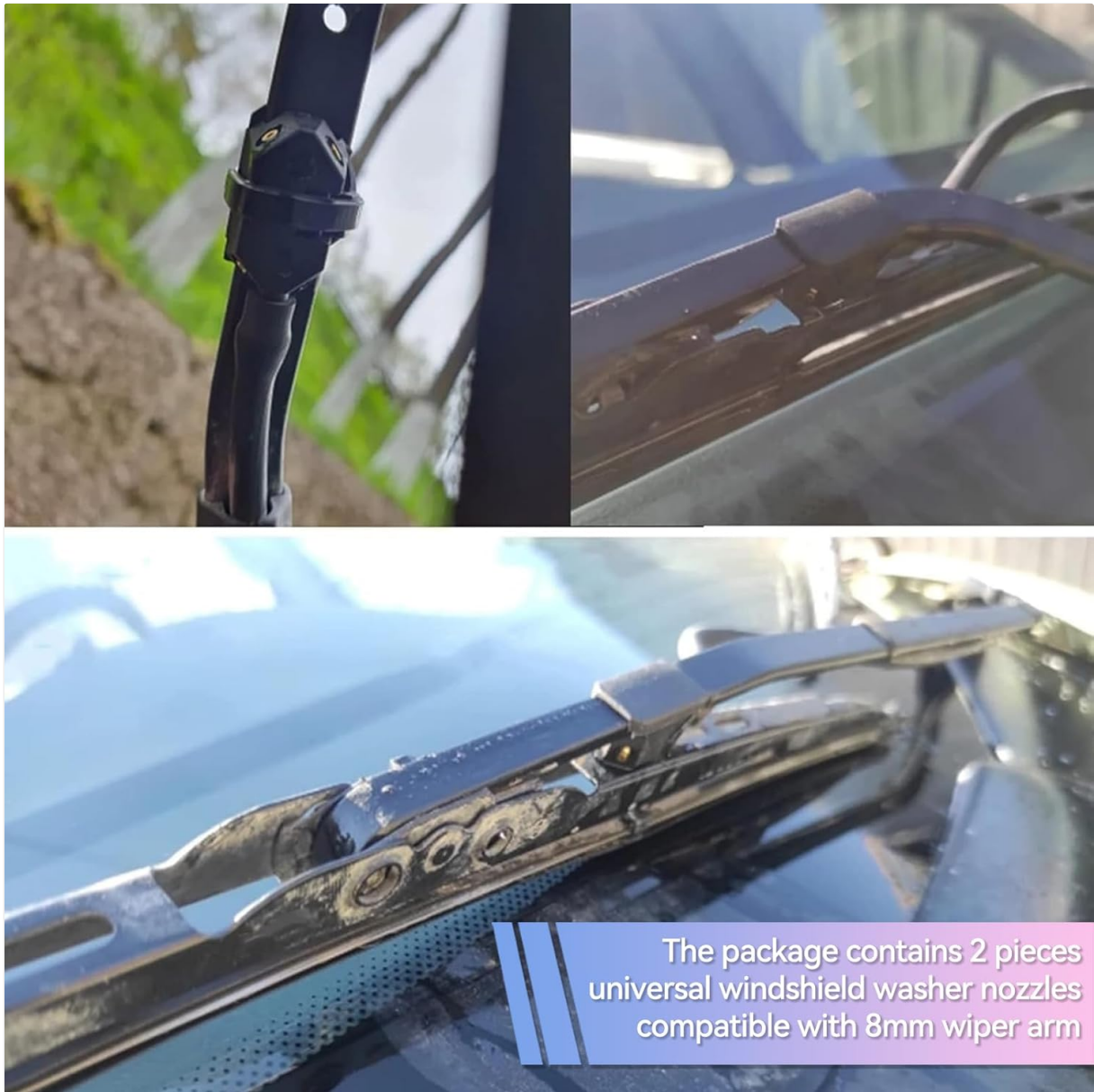
Image 5.2: Visual guide for attaching the nozzle and connecting the fluid tube.