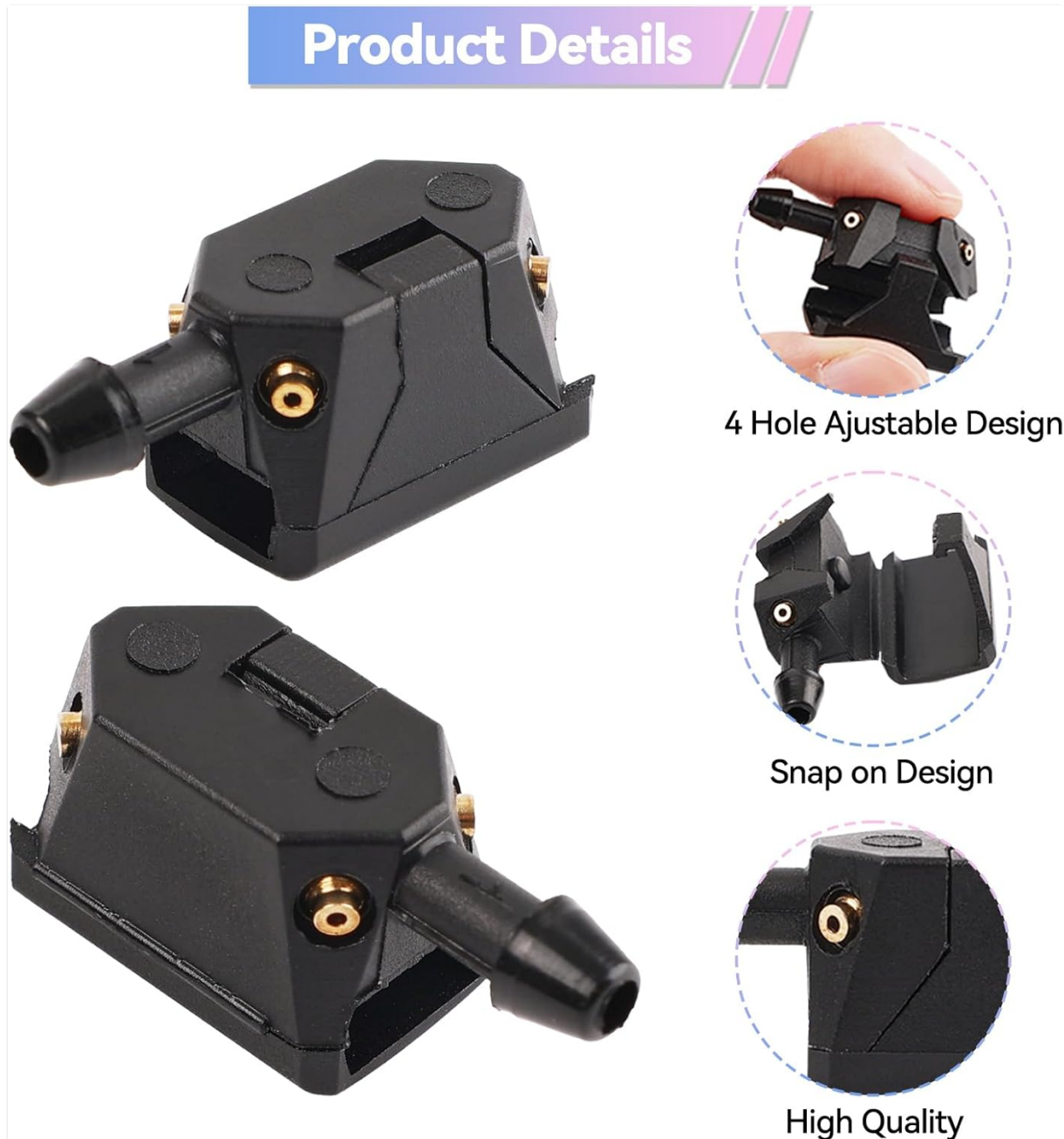
Image 4.1: Detailed view of the nozzle features, including the 4-hole adjustable design and snap-on mechanism.