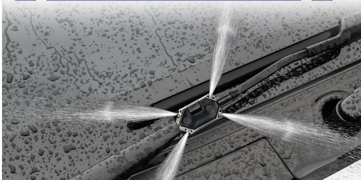
Image 6.1: The nozzle in operation, showing the effective spray pattern on the windshield.