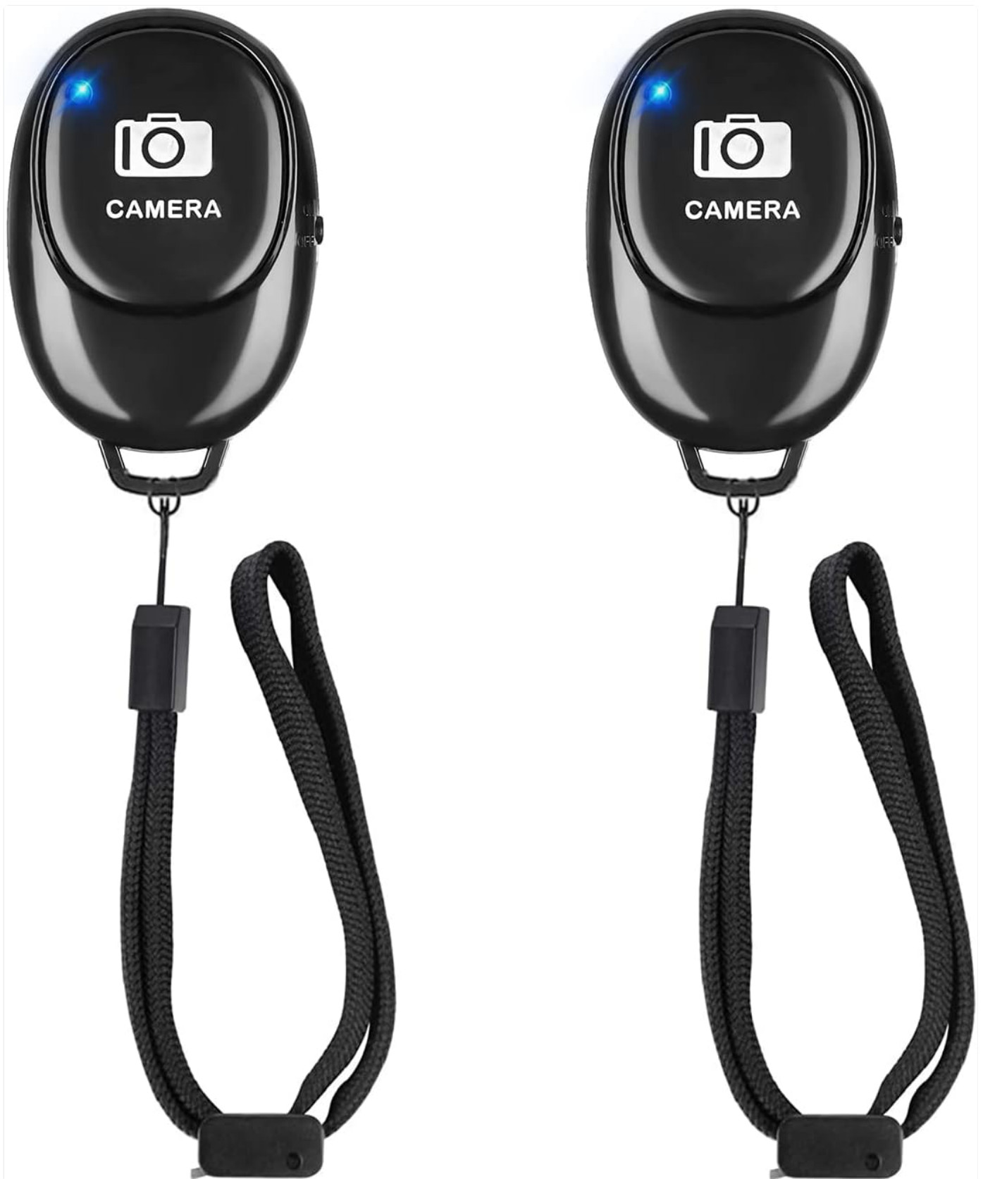
Image: The package includes two remote controls, each with an adjustable wrist strap, ready for use.