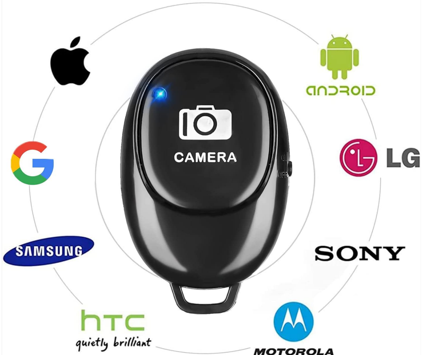
Image: The remote control is compatible with a wide range of Android and iOS devices.