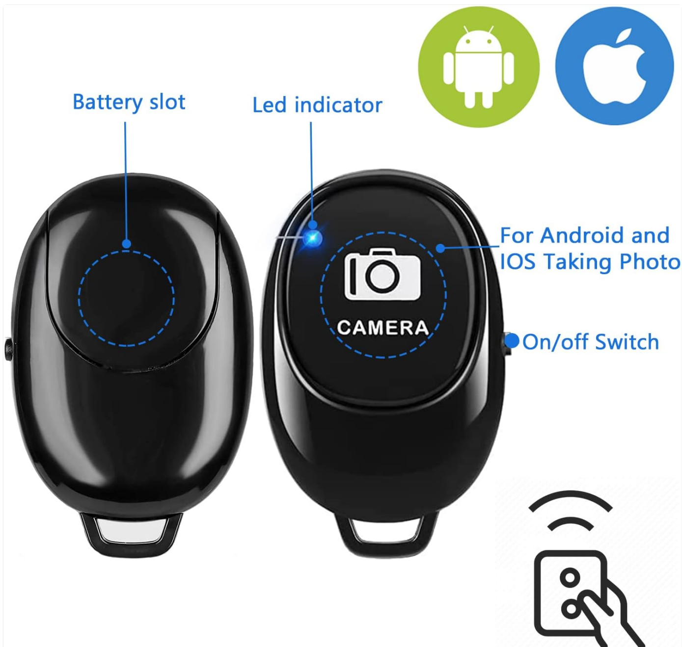
Image: Detailed view of the remote control's features, including the battery compartment and power switch.