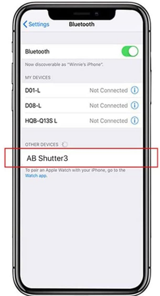
Image: Visual guide for the easy pairing and connection process of the remote shutter with a smartphone.