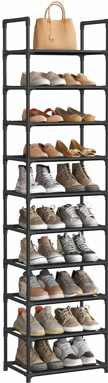
Image: The SONGMICS 10-Tier Shoe Rack in its full height, showcasing its capacity to hold multiple pairs of shoes on each of its ten tiers. A handbag is placed on the top shelf.