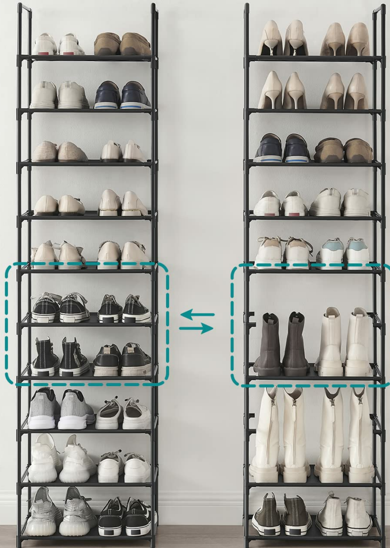
Image: This illustration highlights the large capacity of the shoe rack, showing how it can organize up to 20 pairs of shoes. It also demonstrates the flexibility of assembling it as a full 10-tier unit or splitting it into two 5-tier units, with options to remove shelves for boots.