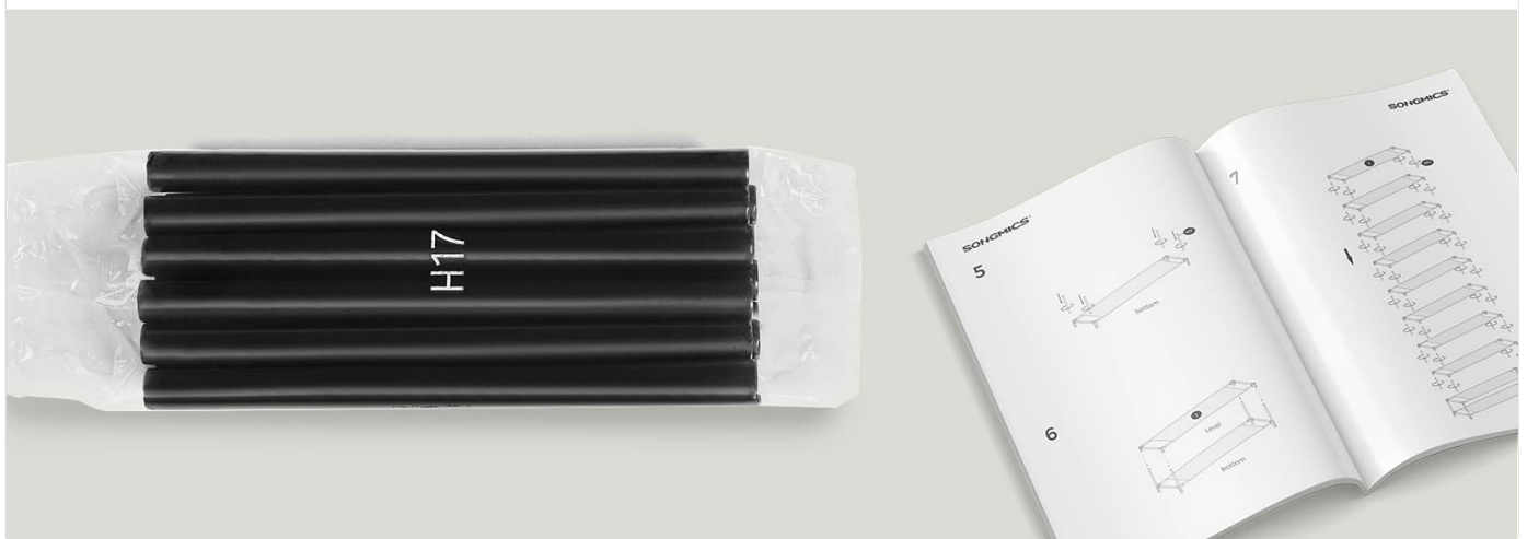
Image: This graphic illustrates the ease of assembly, showing how the simple structure requires no tools. It depicts the process of connecting the pipes and placing the fabric shelves.