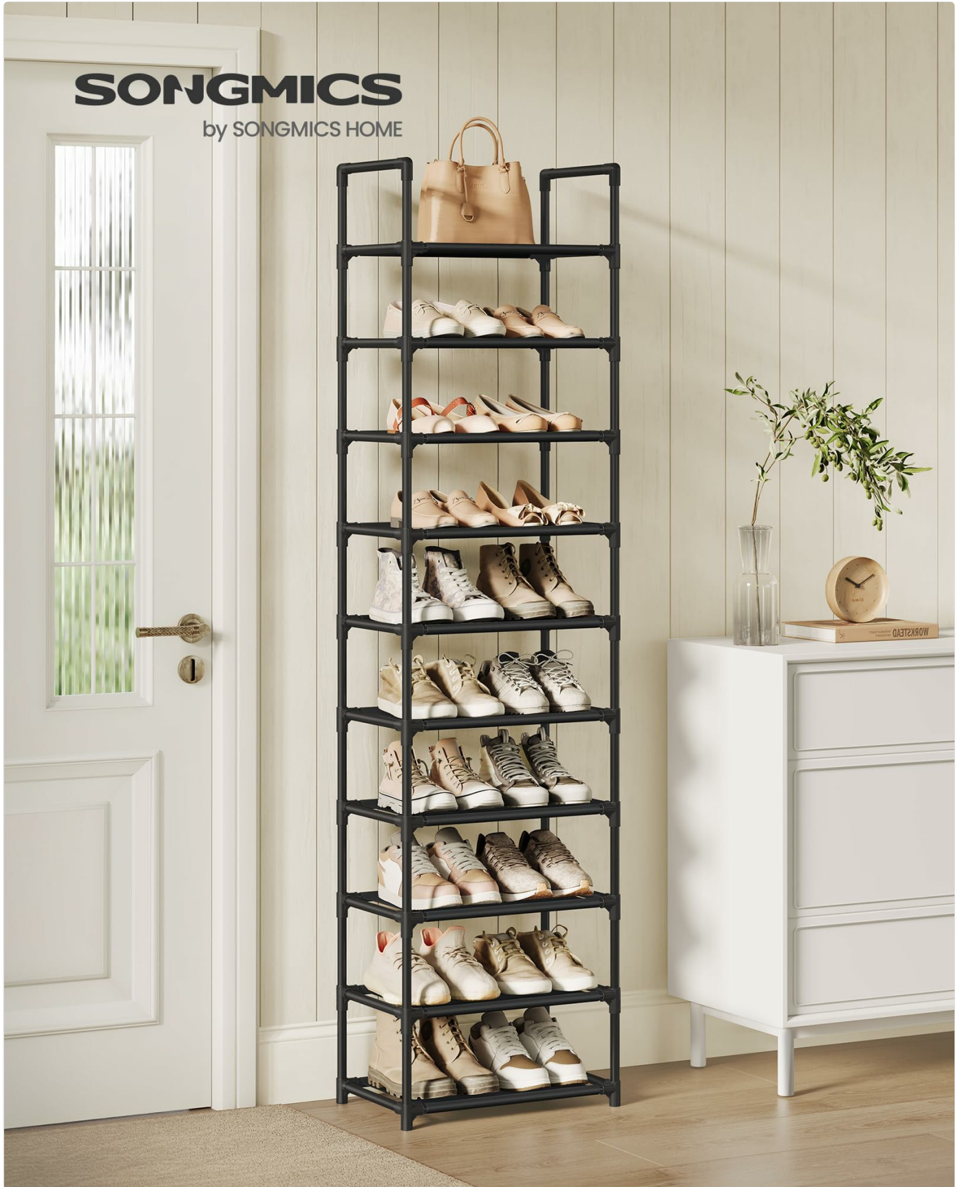
Image: The shoe rack is shown in an entryway, fully utilized with shoes, highlighting its functional integration into a home environment.