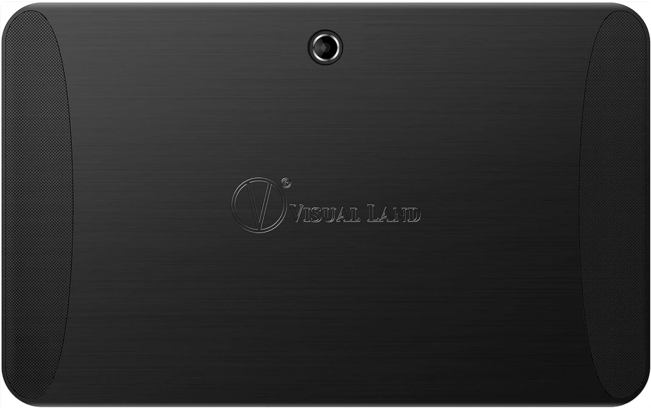
Figure 2: Back view of the Prestige Elite 10QH Tablet, showing the rear camera and Visual Land logo.