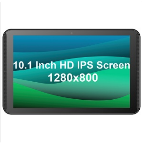
Figure 3: Visual representation of the 10.1-inch HD IPS screen.