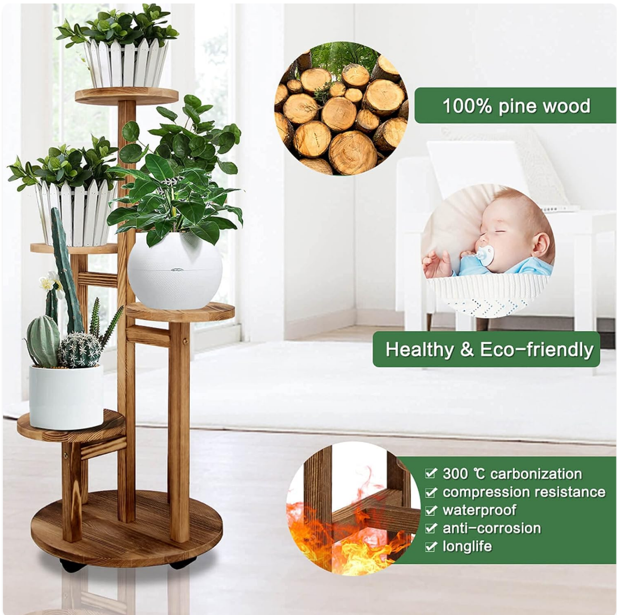
Image: Visual representation of the pine wood material and carbonization process, highlighting product durability.