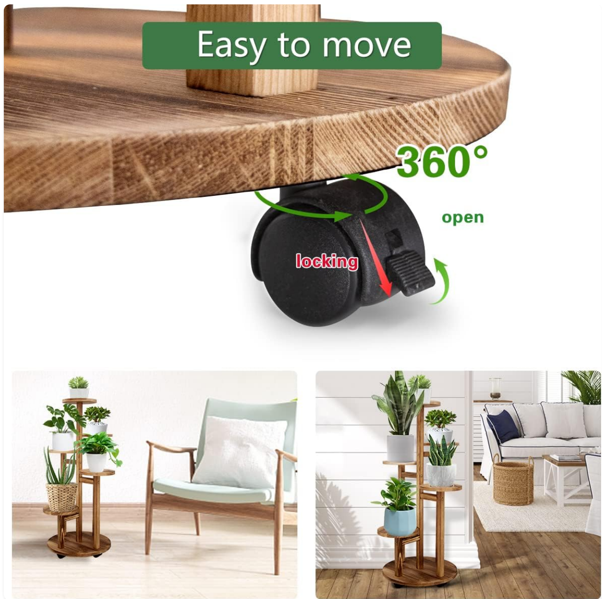
Image: Detail of the movable wheel feature, highlighting its locking mechanism for stability.