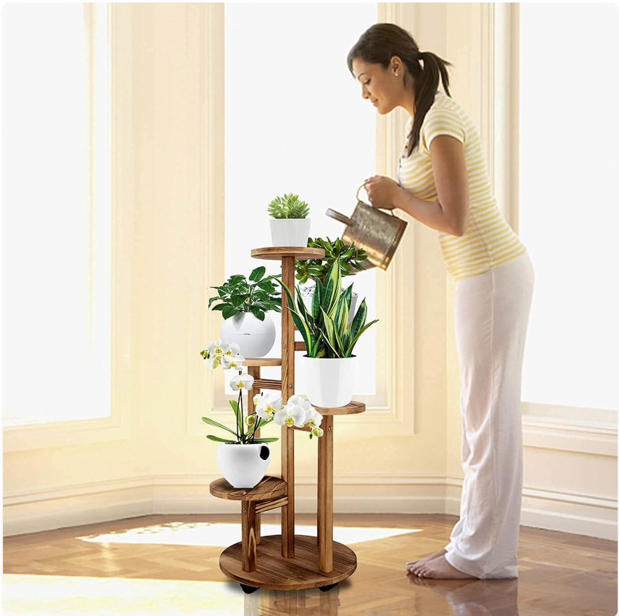
Image: A woman watering plants displayed on the GEEBOBO 5-tiered plant stand, showcasing its use in a home environment.