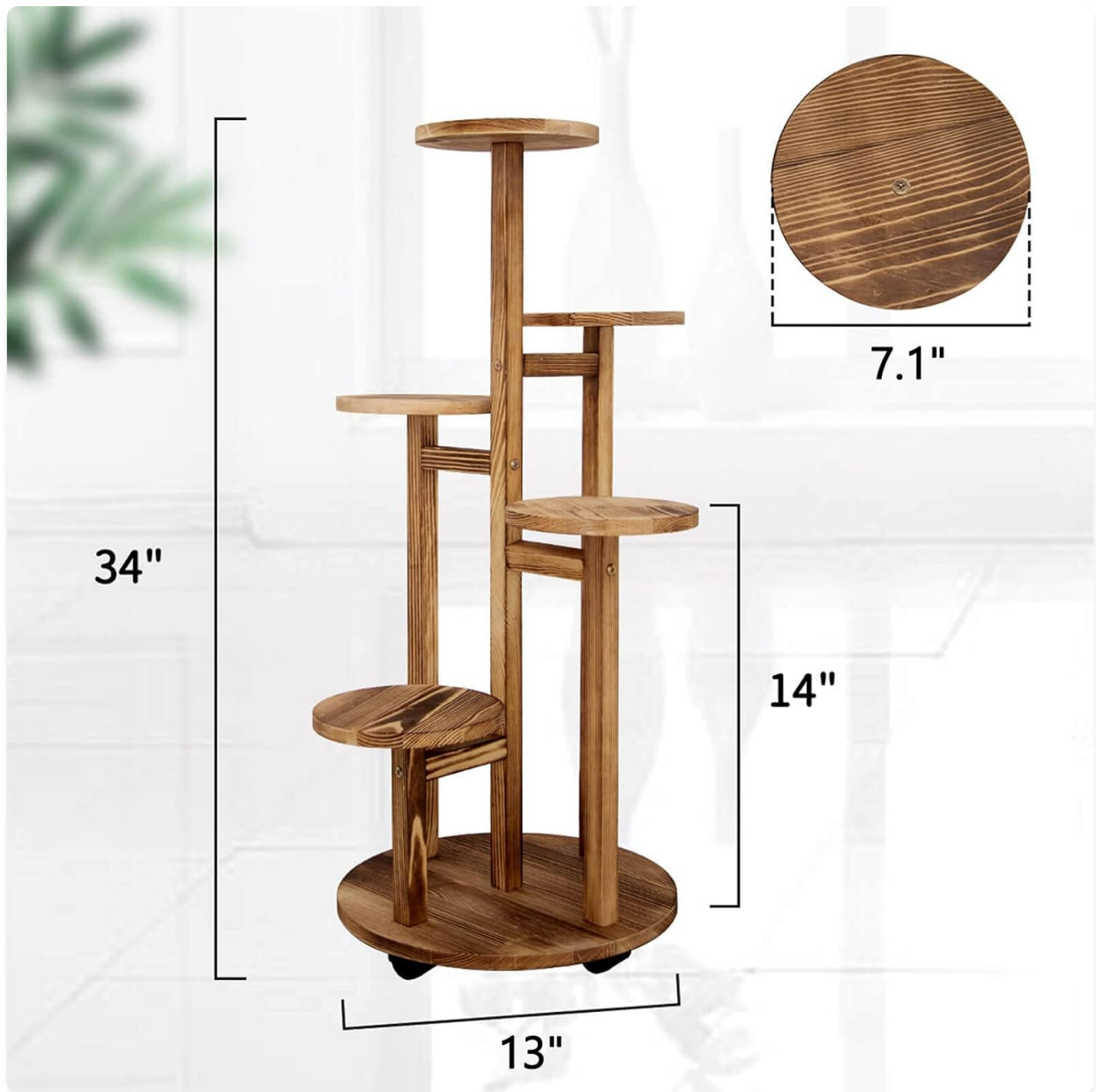
Image: Dimensional drawing of the plant stand, indicating height, width, and shelf diameter.