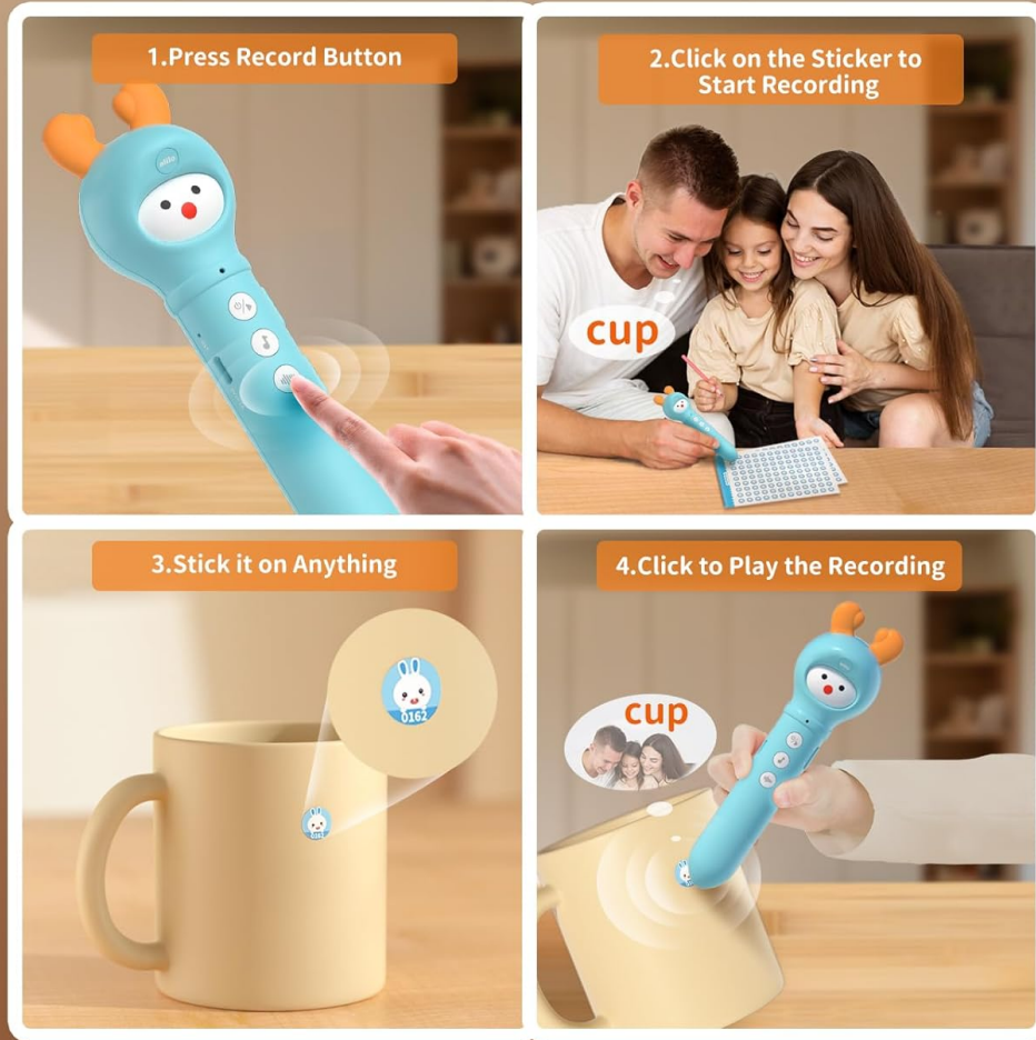
Image: A four-step guide demonstrating how to use the recording stickers: 1. Press Record Button, 2. Click on the Sticker to Start Recording, 3. Stick it on Anything, 4. Click to Play the Recording.