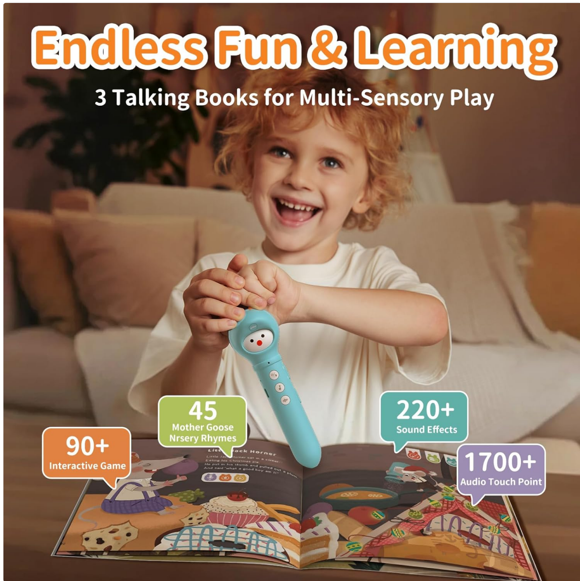
Image: A child interacting with a nursery rhyme book using the alilo Talking Pen, which reads content aloud when touched to the page.