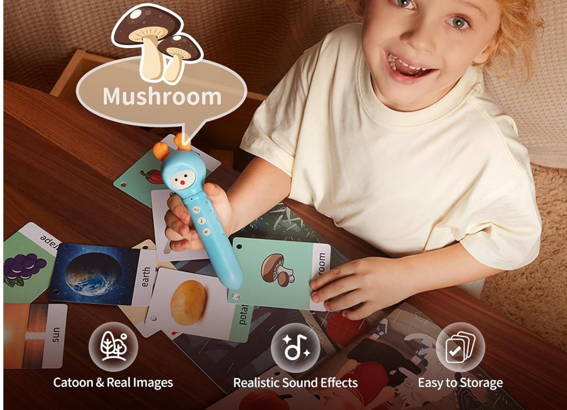
Image: A child using the alilo Talking Pen to interact with flash cards, learning words and sounds.