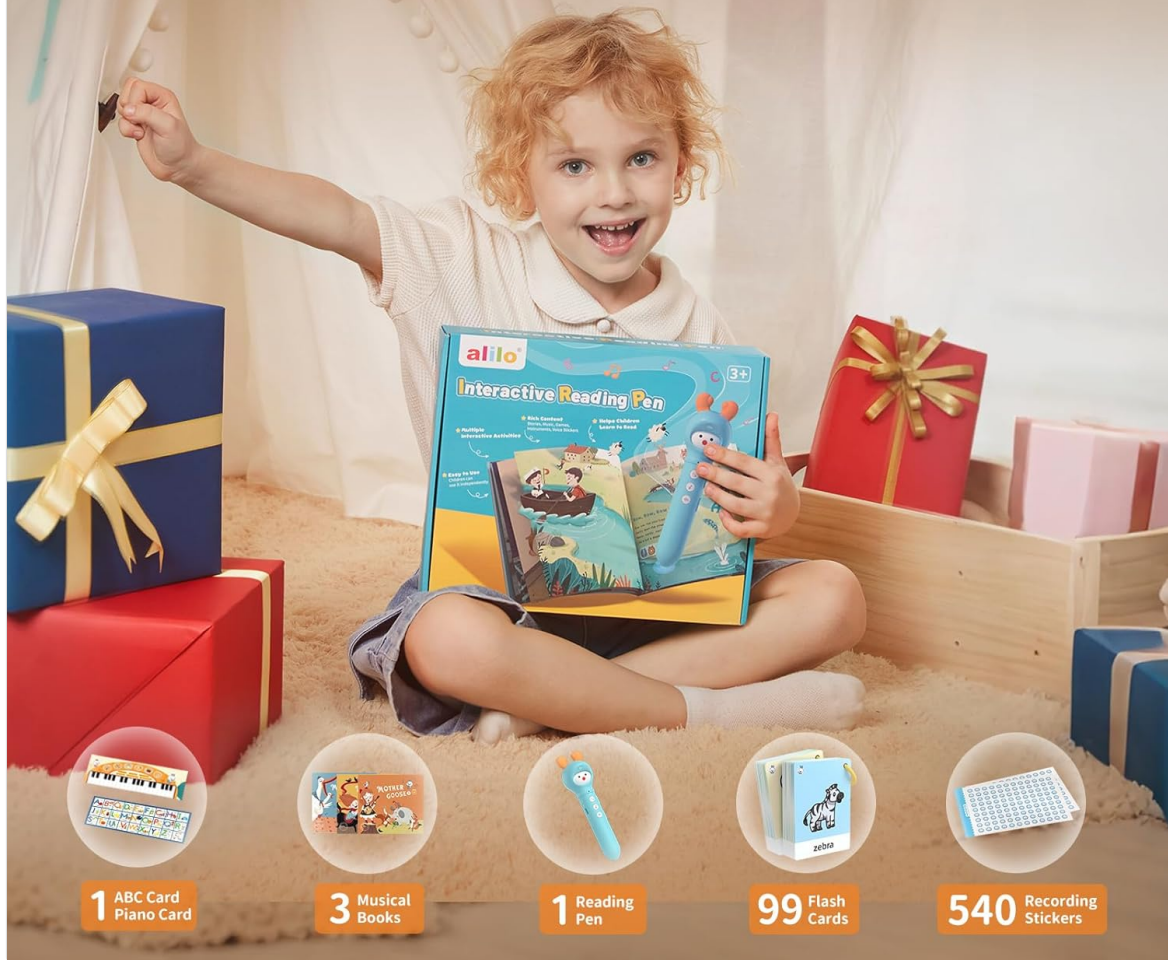
Image: The alilo Talking Pen D3C package contents, including the pen, books, cards, and accessories.

Upon opening your alilo Talking Pen D3C package, you should find the following items: