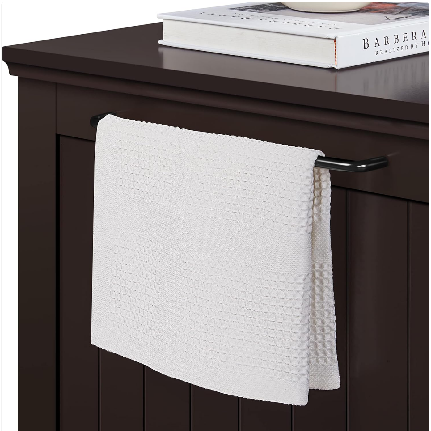
Image: Detail of the integrated towel bar, useful for hanging cleaning cloths or small tools.