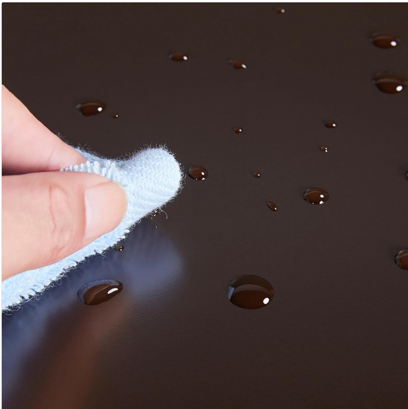
Image: Demonstrates the easy-to-clean, waterproof surface of the enclosure.