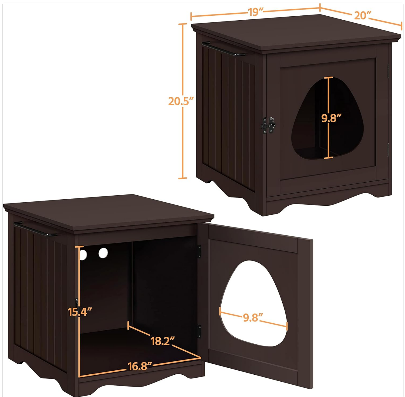
Image: Illustrates the function of the ventilation holes on the back panel for improved air circulation.