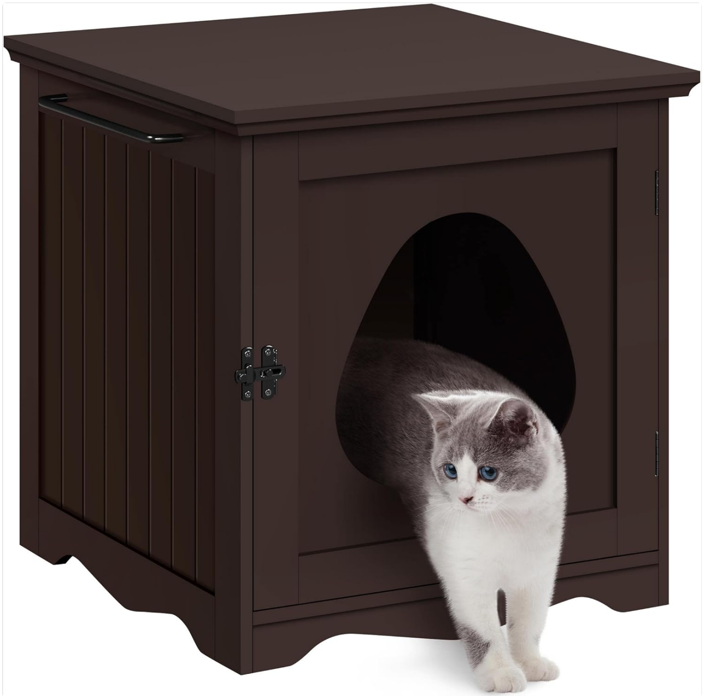
Image: The Yaheetech Cat Litter Box Enclosure in espresso finish, with a cat partially emerging from the side entrance.