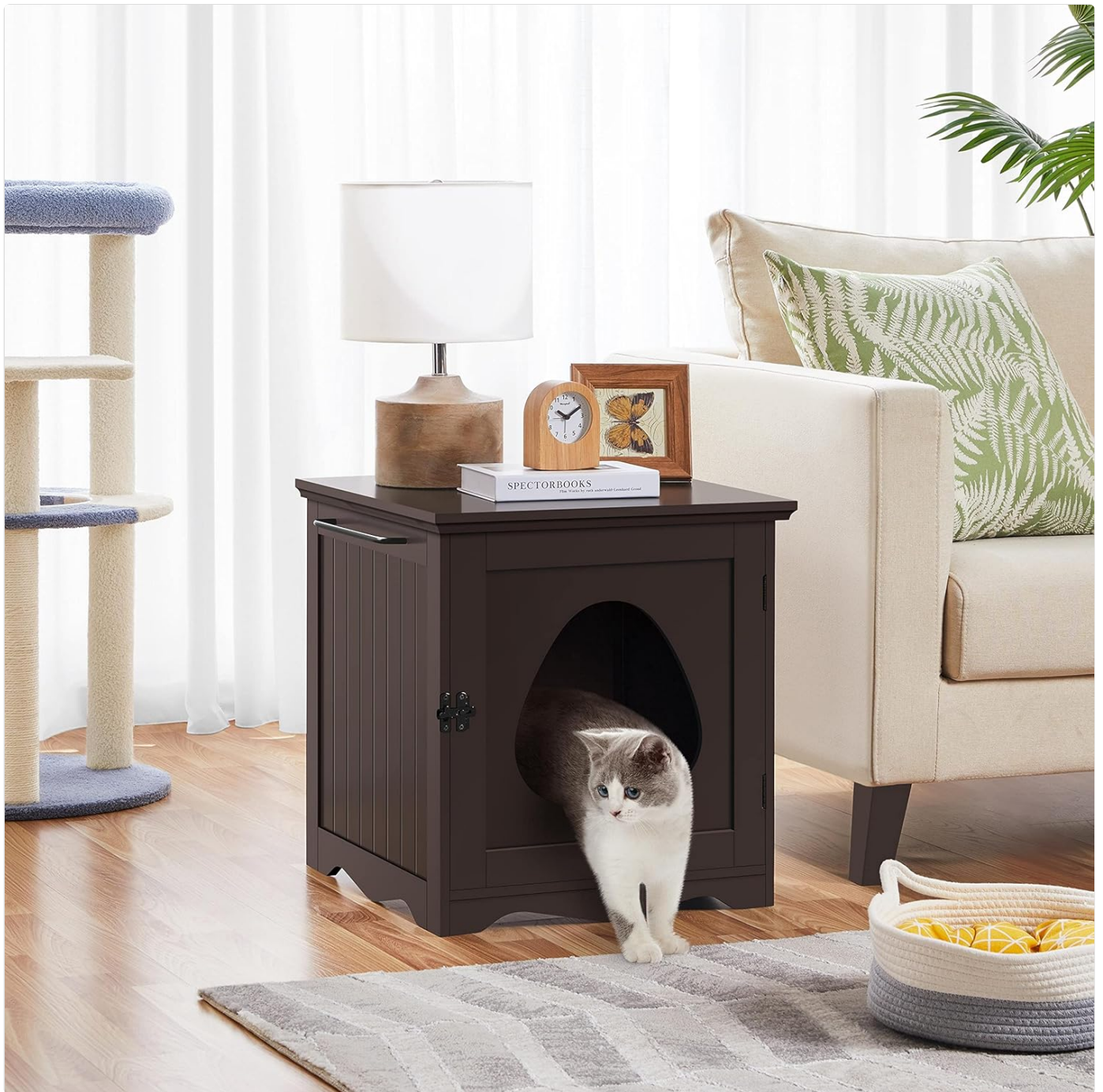
Image: The enclosure seamlessly integrated into a living room as a side table, demonstrating its versatile design.