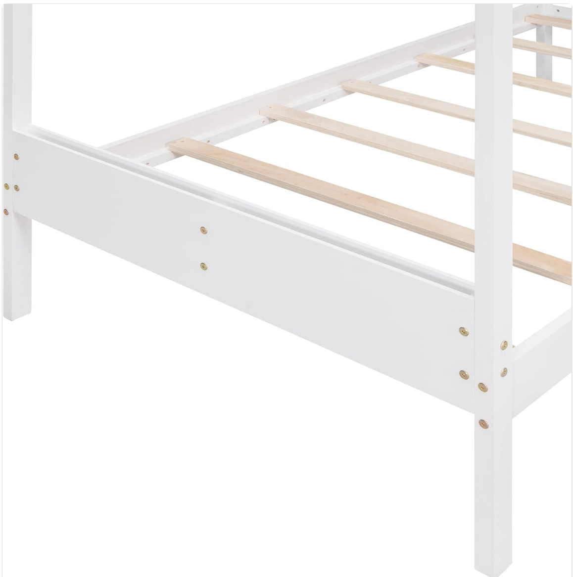
Image 3.1: A close-up view of a side rail connected to a leg post, showing the pre-drilled holes and hardware for