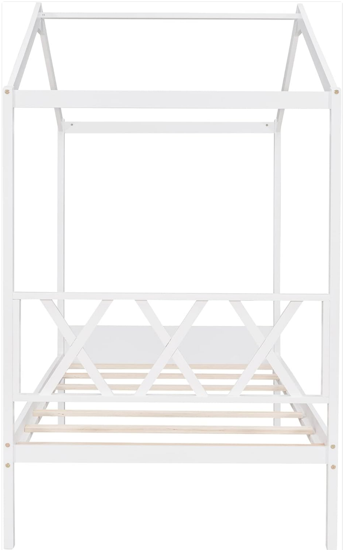
Image 3.2: The Bellemave Twin House Bed frame with all wooden slats properly installed, providing a foundation for the mattress.