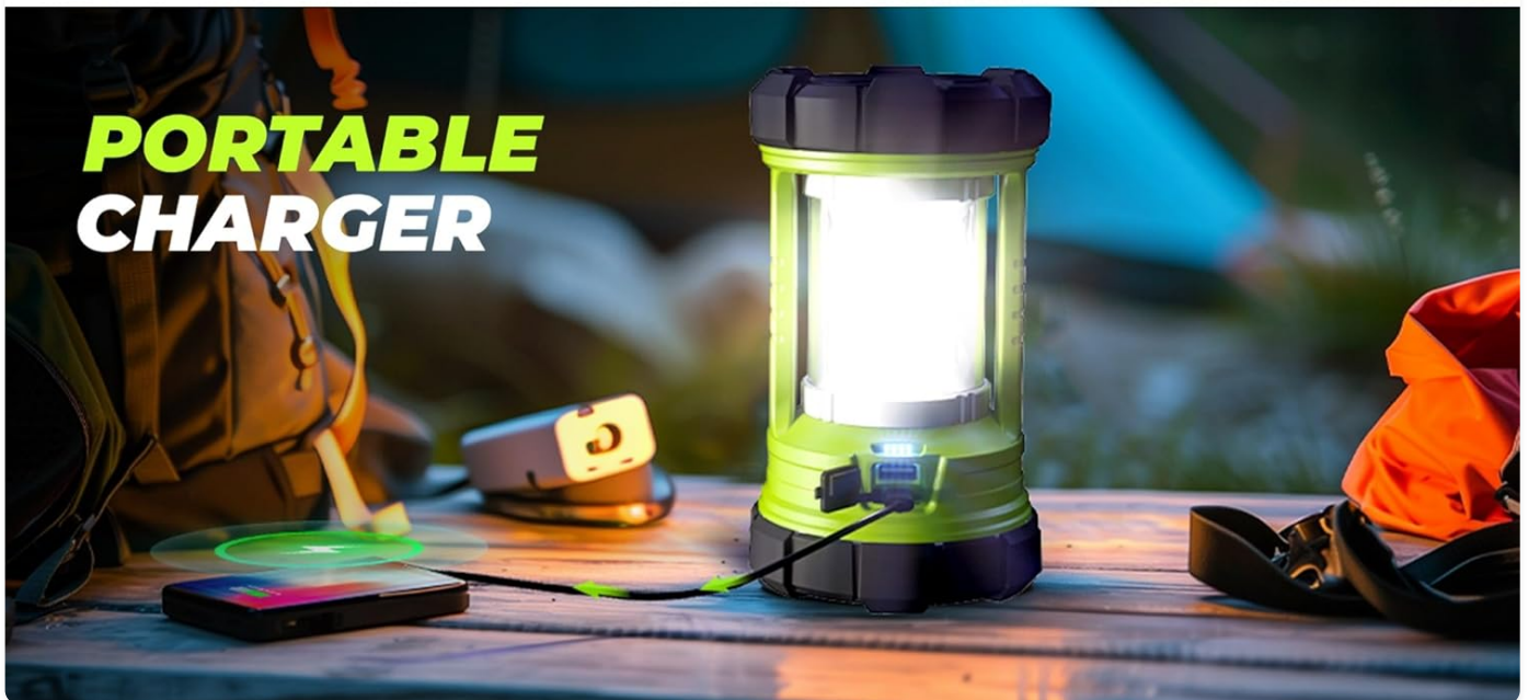
Image: The lantern displaying its 4400mAh rechargeable battery capacity, runtime, and charging time, alongside an illustration of its portable charger function.