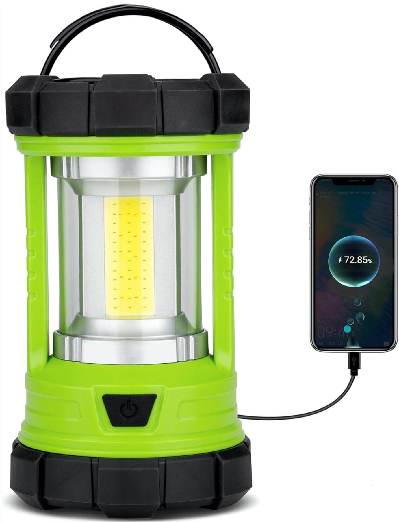
Image: The Favourlite Camping Lantern, pale green in color, demonstrating its ability to charge a smartphone via its USB port.