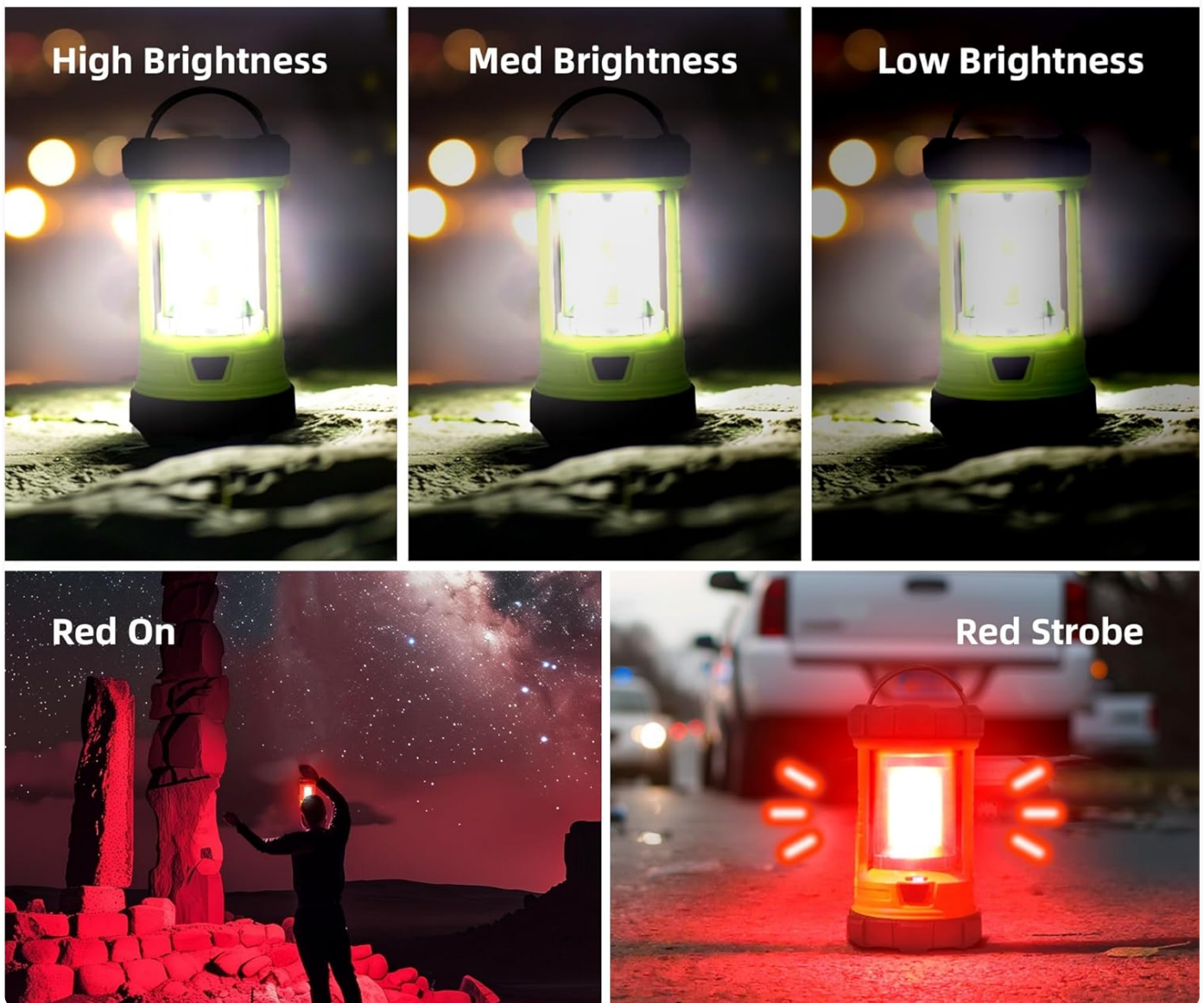
Image: Visual representation of the lantern's five lighting modes, including white light at various intensities and red light for night vision and emergency signaling.