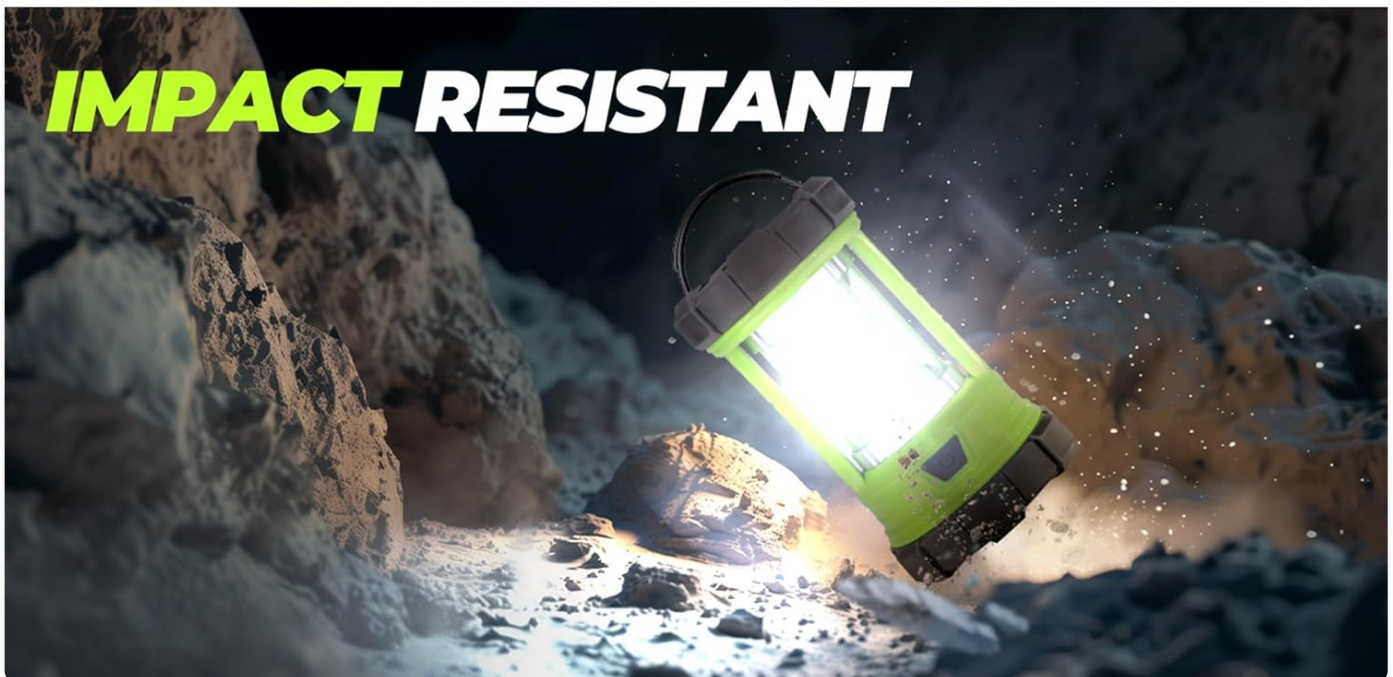
Image: Demonstrations of the lantern's durability, showing it being used in rainy conditions and surviving a fall on rough ground.