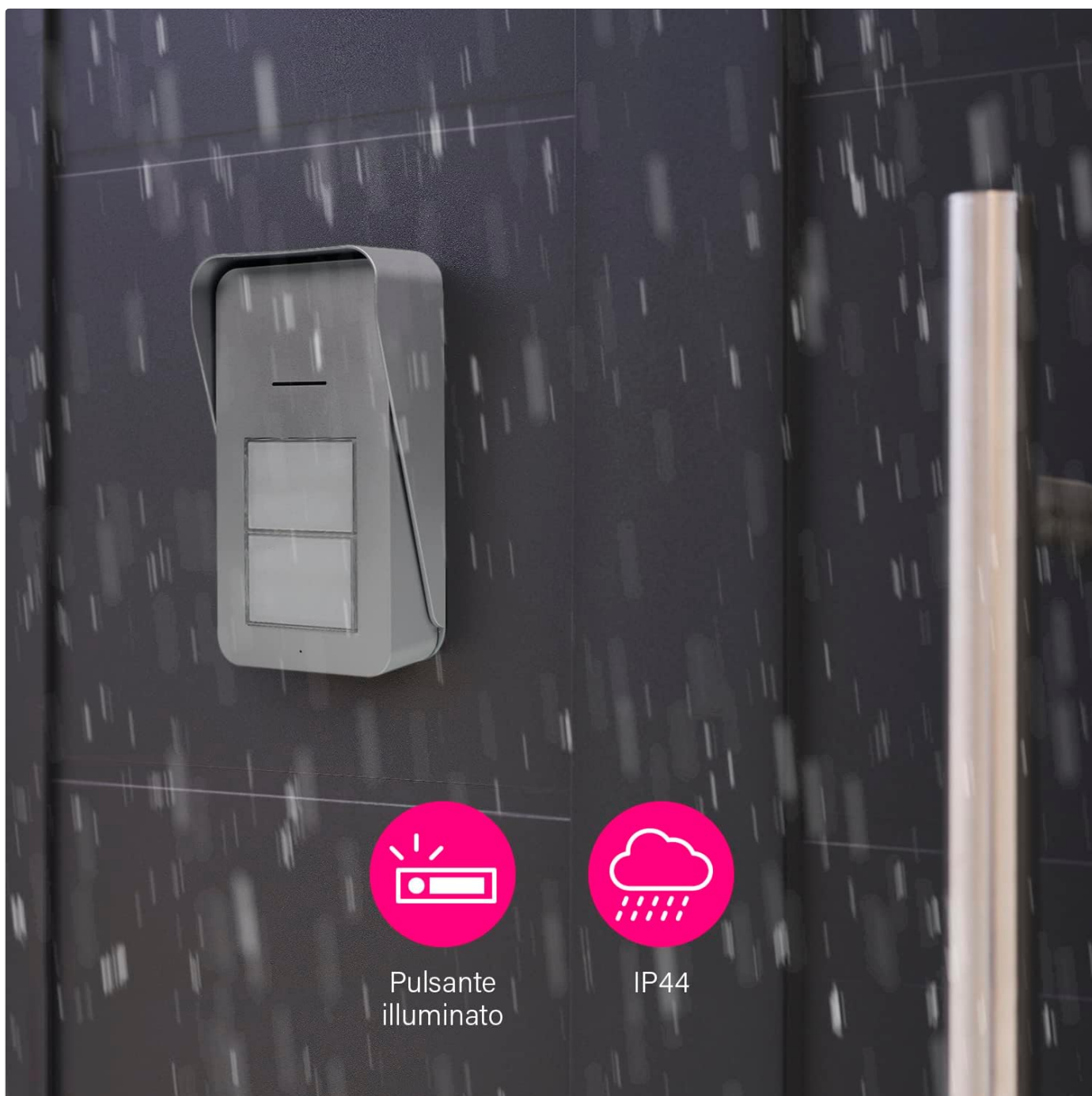
Figure 3.1: Outdoor unit with illuminated button and IP44 weather resistance.

4. Nameplate: Insert your name(s) into the illuminated nameplate slot.