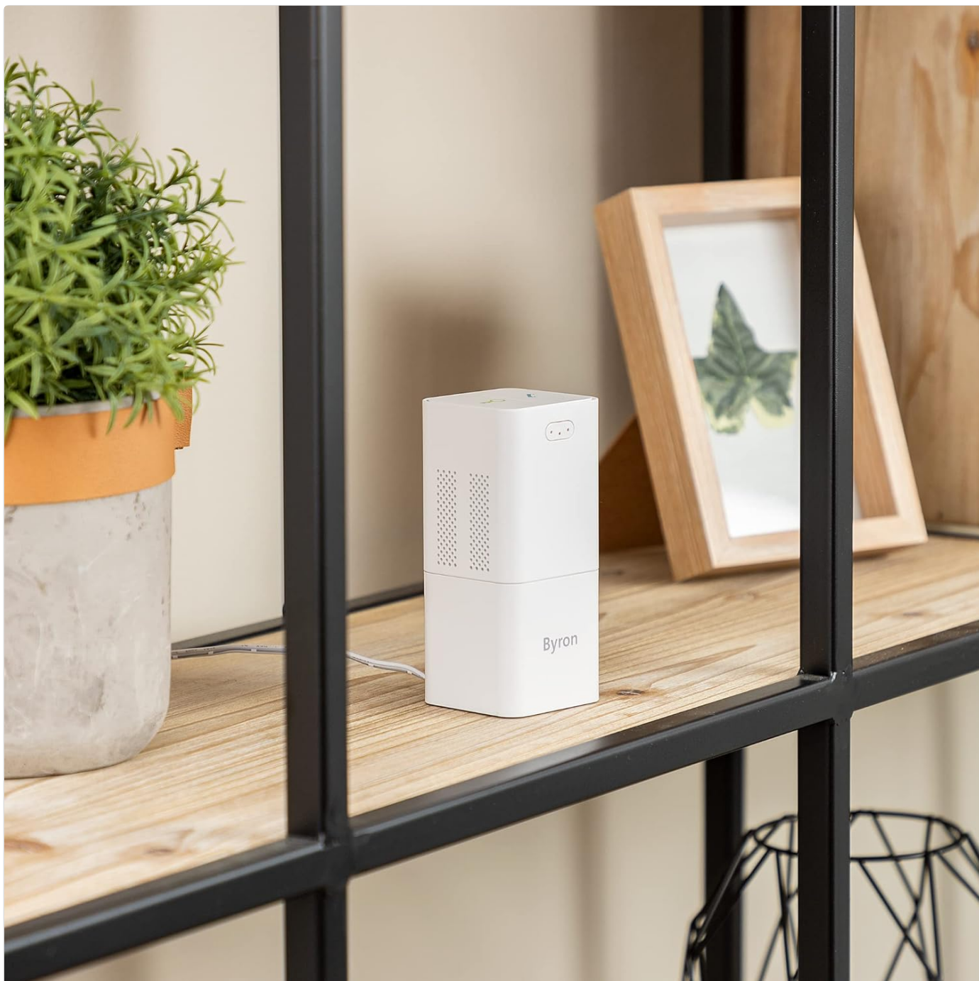
Figure 3.3: Indoor unit discreetly placed on a shelf.