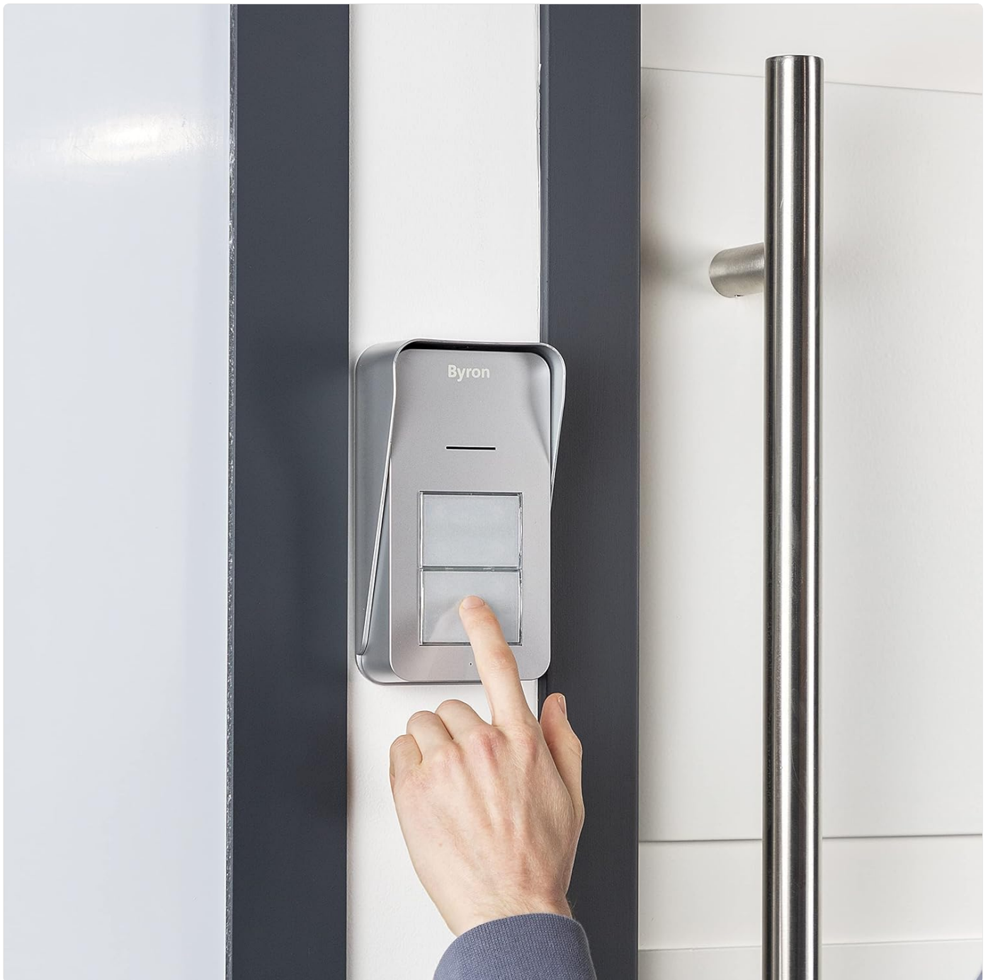
Figure 3.2: User interacting with the outdoor unit.