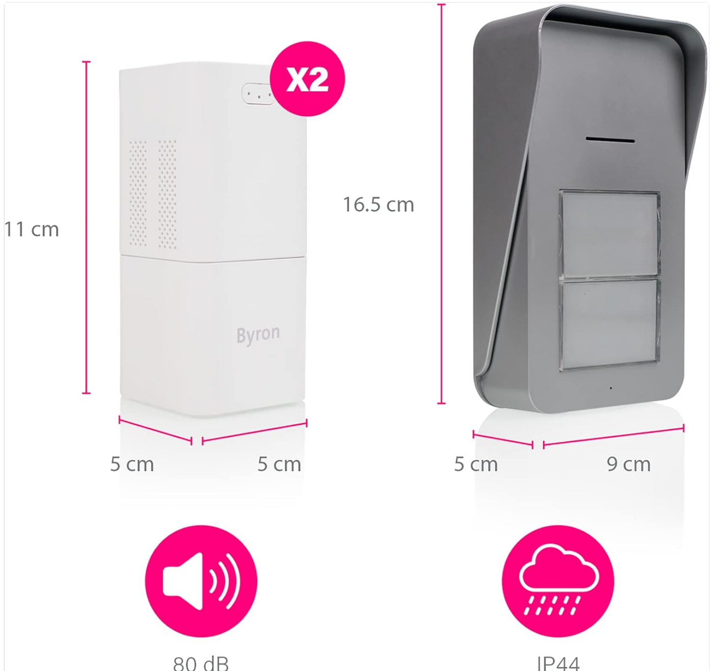
Figure 4.1: Indoor unit sound level (80 dB) and outdoor unit IP44 rating.