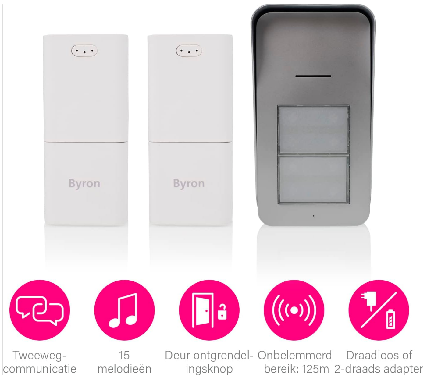
Figure 2.1: Overview of the Byron DIC-21525 system components and key features.