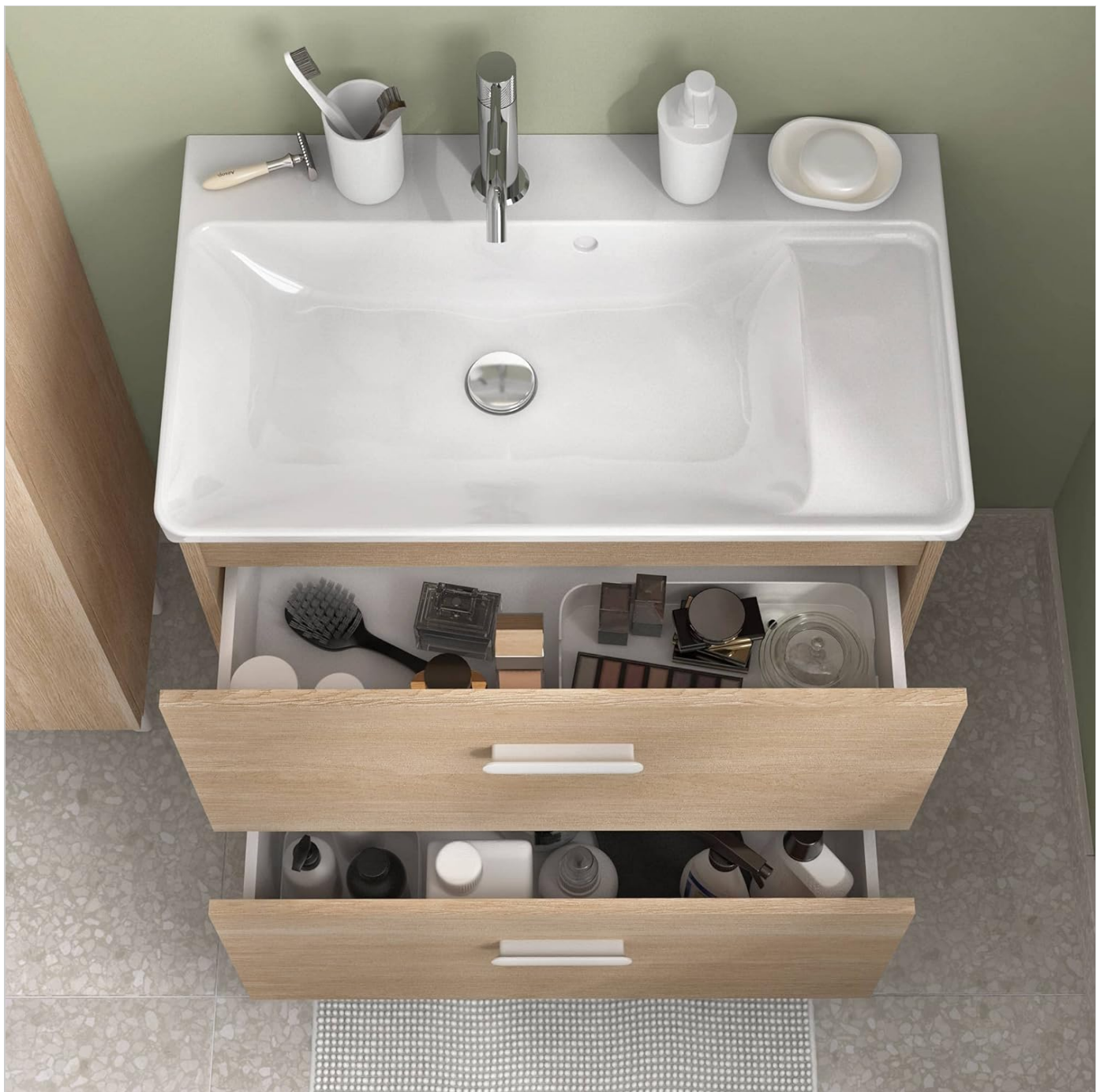
Figure 4: Top-down view of the SENSEA Easy Bathroom Vanity Unit with sink and open drawers, showcasing storage capacity for toiletries.