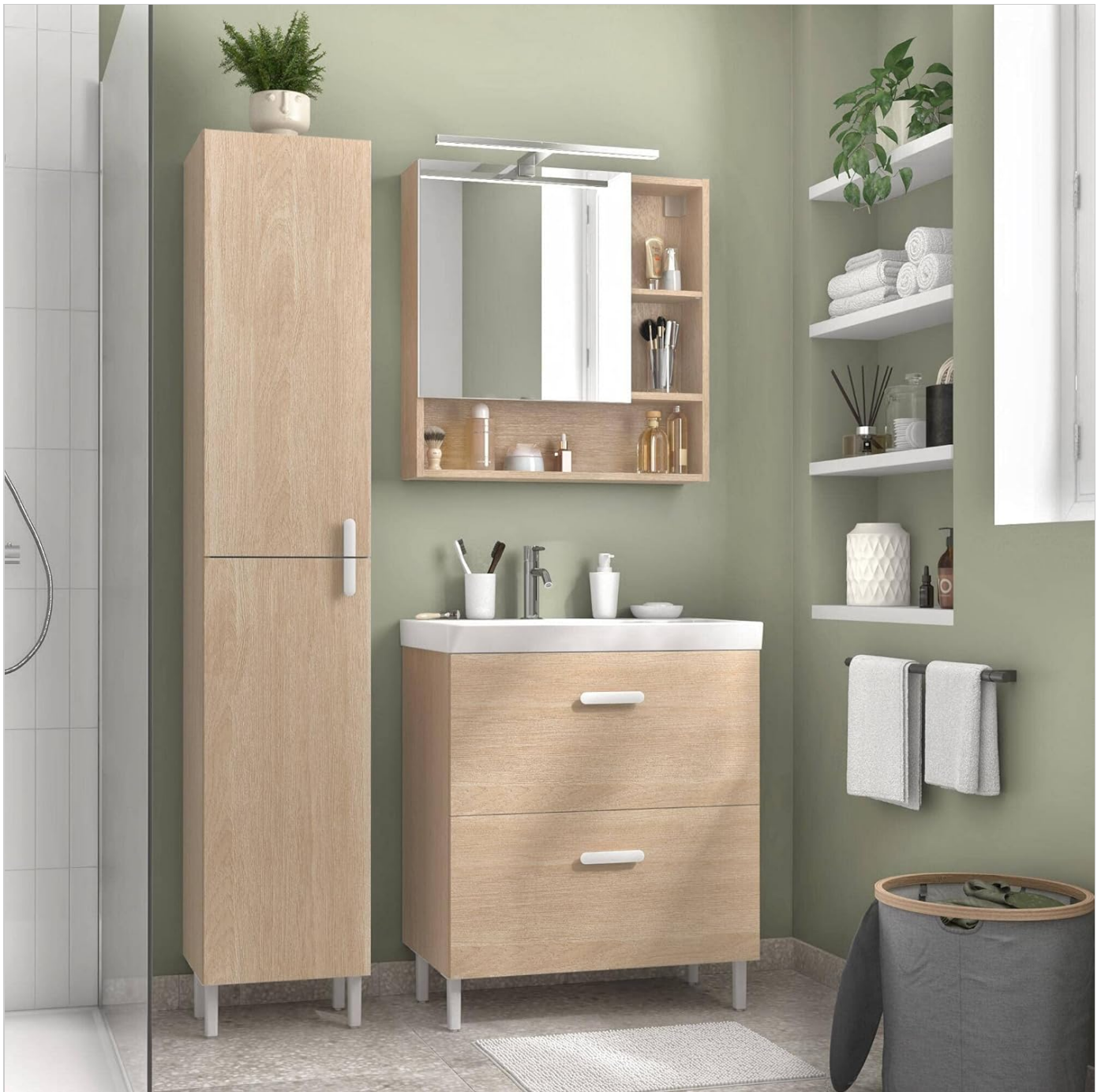
Figure 5: Complete bathroom setup featuring the SENSEA Easy Bathroom Vanity Unit alongside a matching tall storage cabinet, demonstrating its aesthetic integration into a bathroom space.