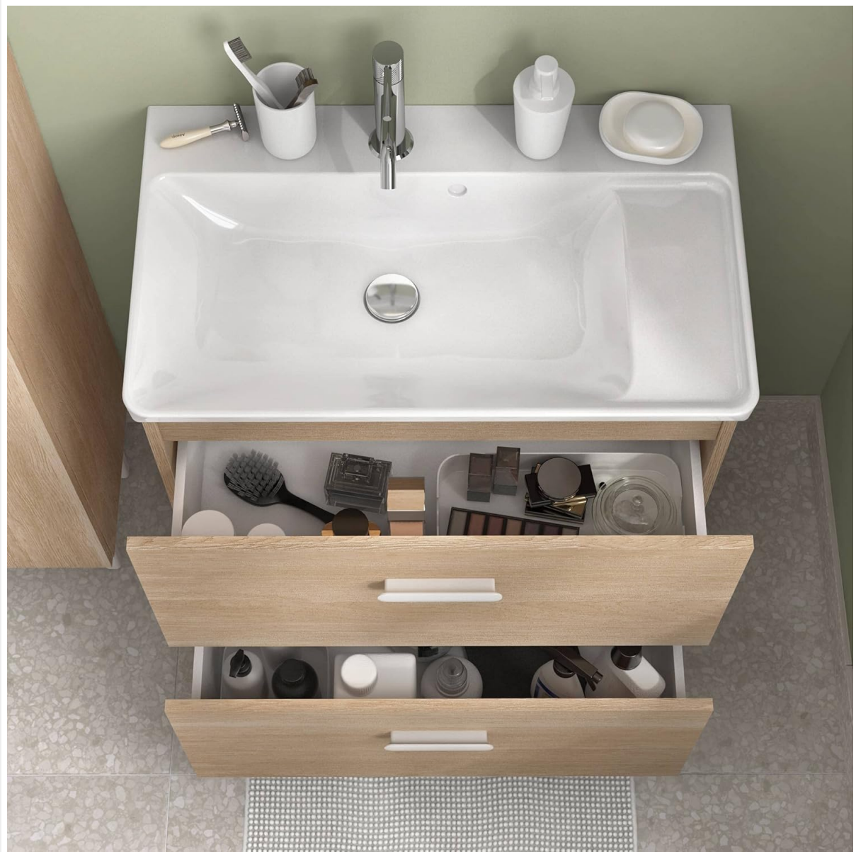
Image 4.1: Open drawers of the SENSEA Easy Under-Basin Cabinet showing storage capacity.

The cabinet features two drawers. The top drawer is designed without cut-outs to maximize storage space for smaller items. The deeper bottom drawer offers ample capacity for larger items.