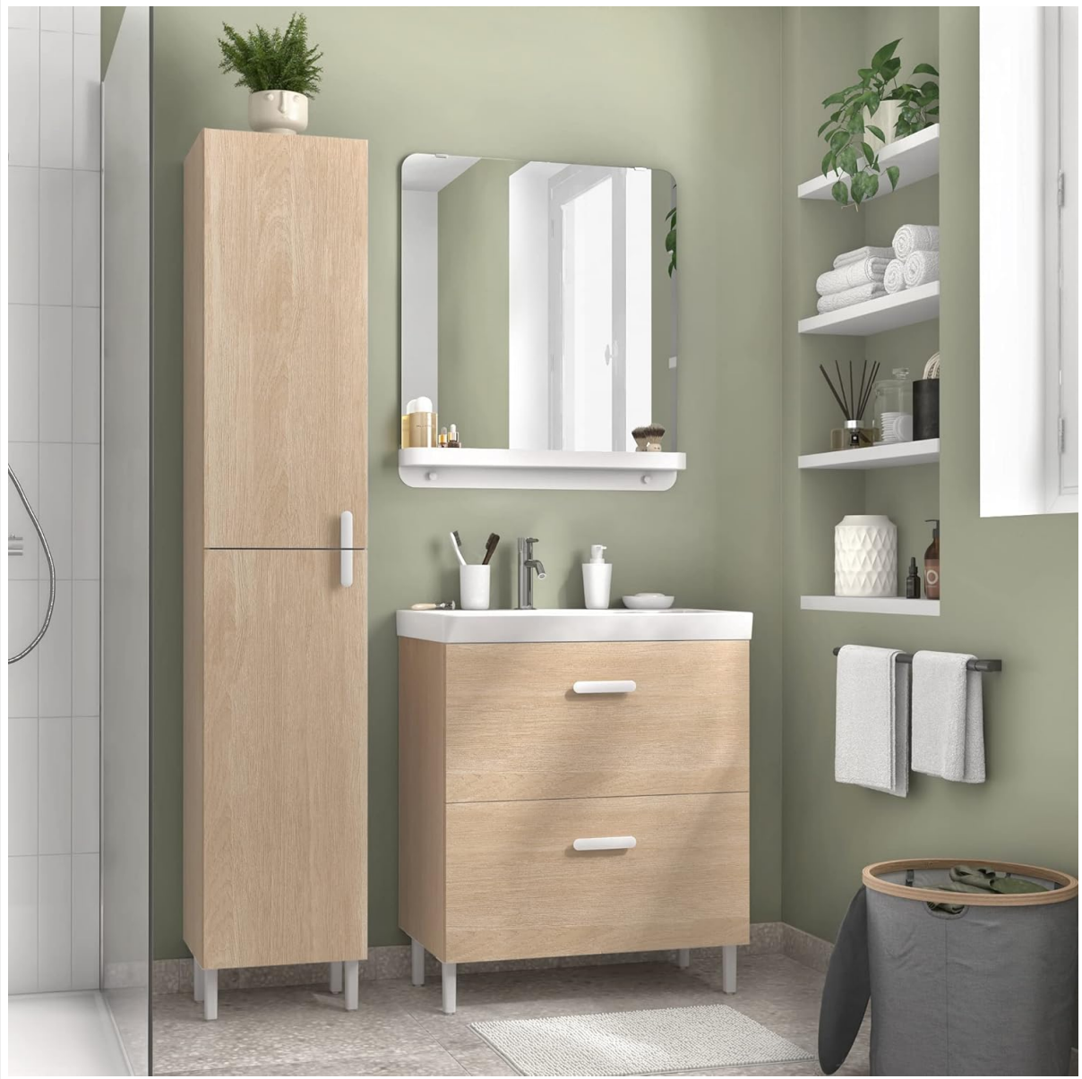
Image 1.1: The SENSEA Easy Under-Basin Cabinet integrated into a bathroom environment.