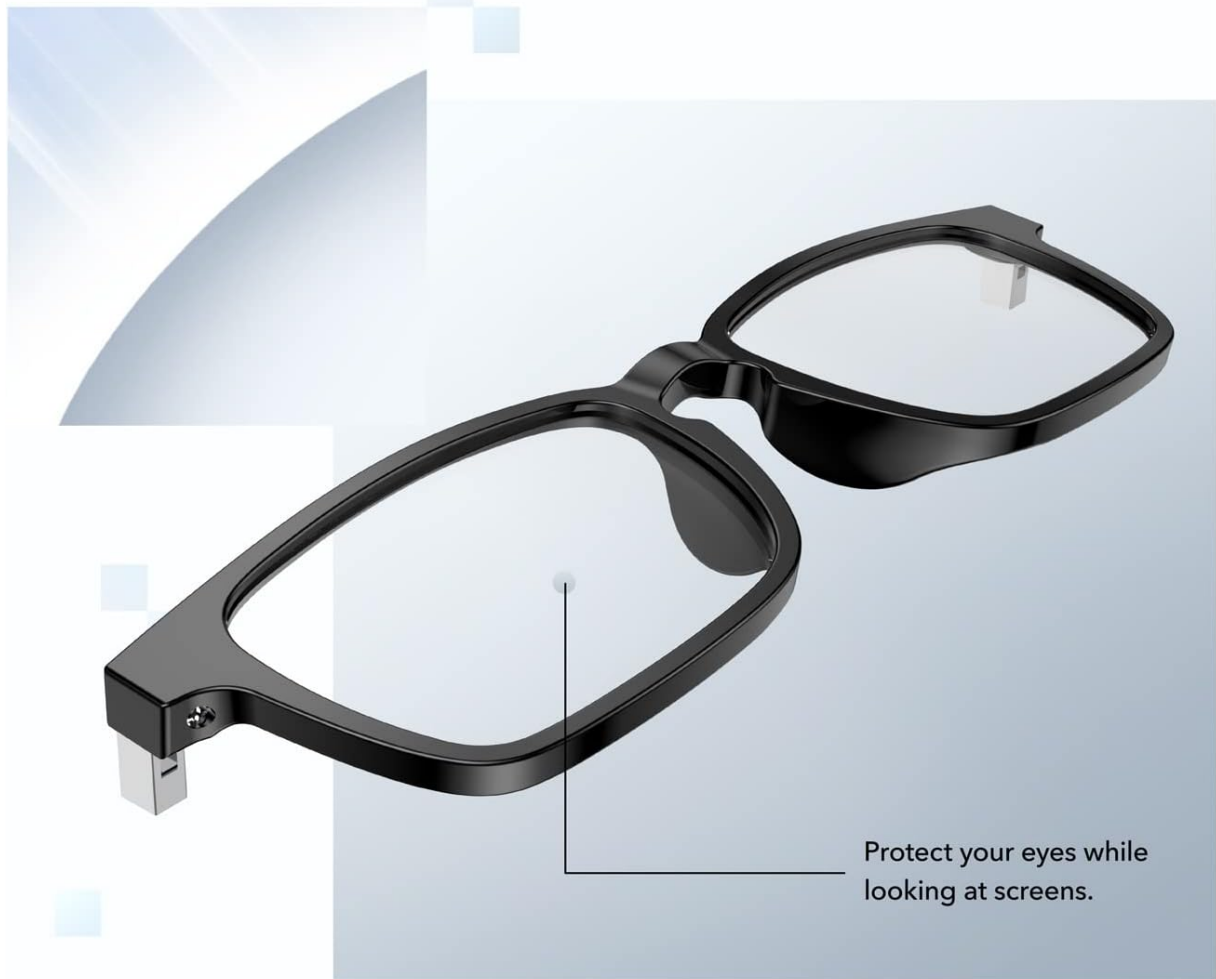
Image: Close-up of Soundcore Frames with clear blue light filtering lenses.

The lenses in the Cafe frame filter out 32% of blue light. This feature helps to reduce eye strain during extended periods of screen time, such as when using laptops, tablets, or smartphones.