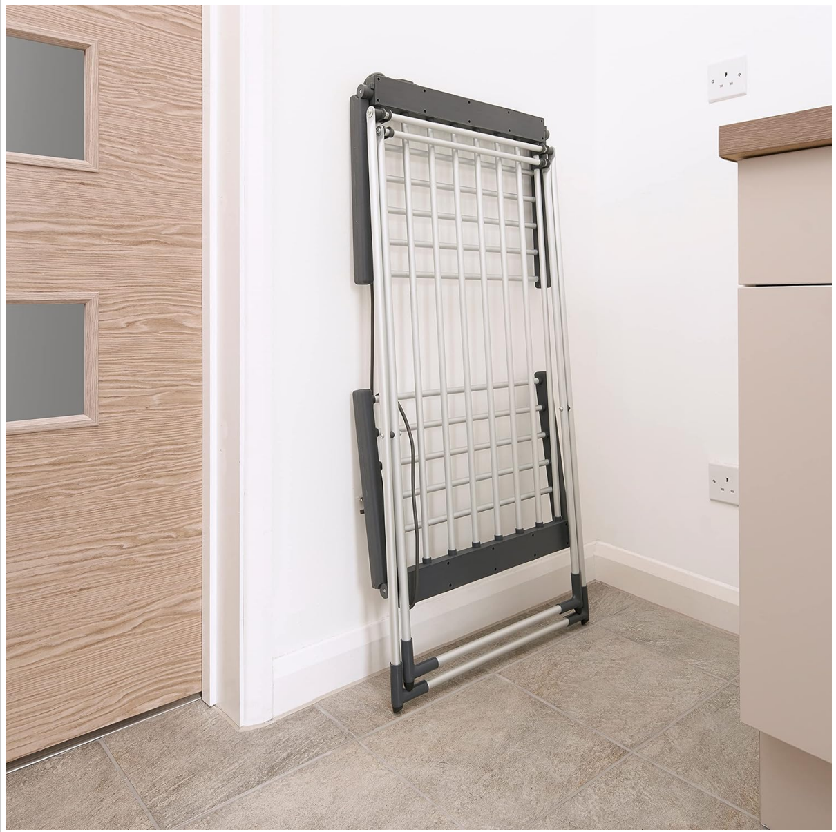
Image: The BLACK+DECKER BXAR0001GB Electric Heated Clothes Dryer is shown folded flat and stored upright against a wall, illustrating its compact storage capability.