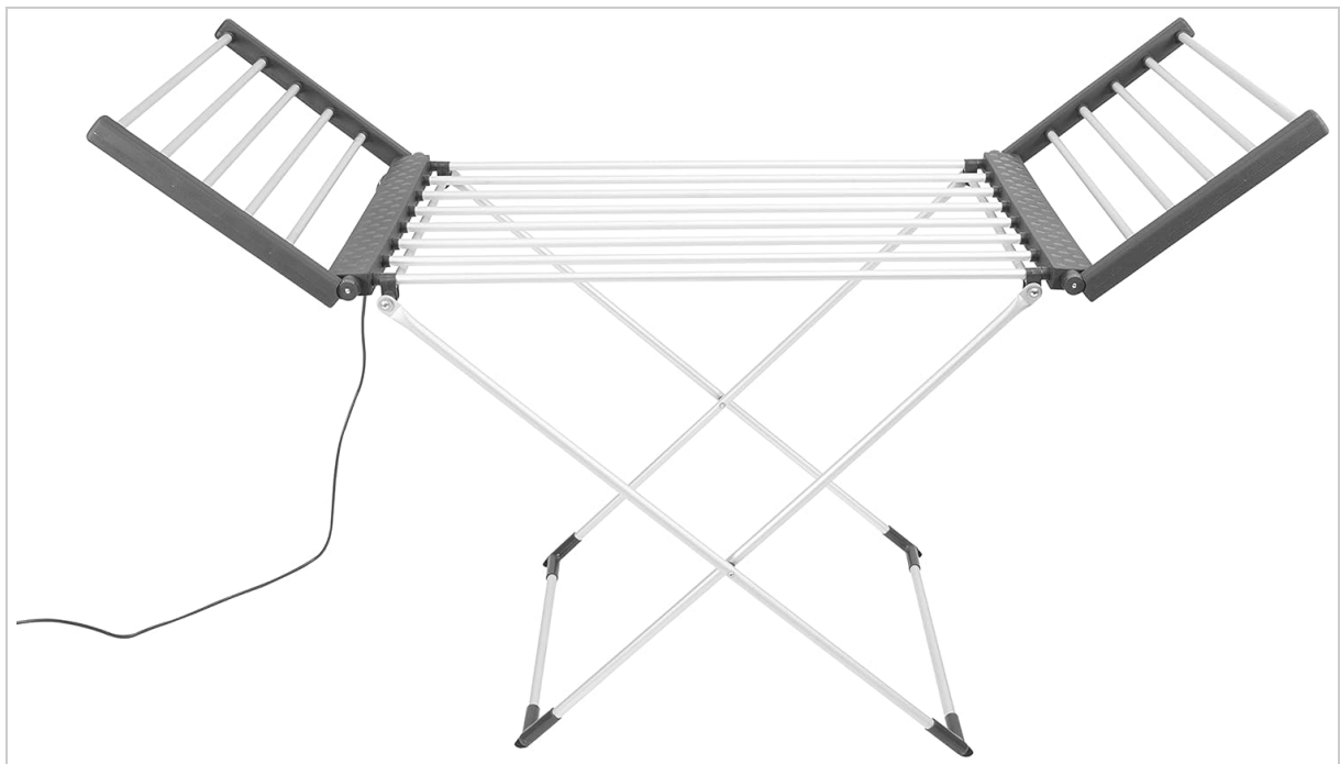
Image: The BLACK+DECKER BXAR0001GB Electric Heated Clothes Dryer shown in its fully unfolded position, ready for use. It features a central drying rack and two side wings, all with heated bars, and a power cord extending from one side.

The dryer consists of a main frame with multiple heated bars, two foldable heated wings, and an integrated power switch.