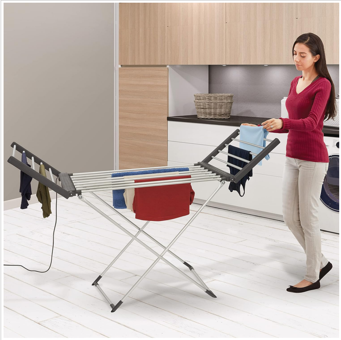
Image: A woman is shown hanging various items of clothing, including shirts and towels, onto the heated bars of the BLACK+DECKER BXAR0001GB Electric Heated Clothes Dryer in a laundry room setting.