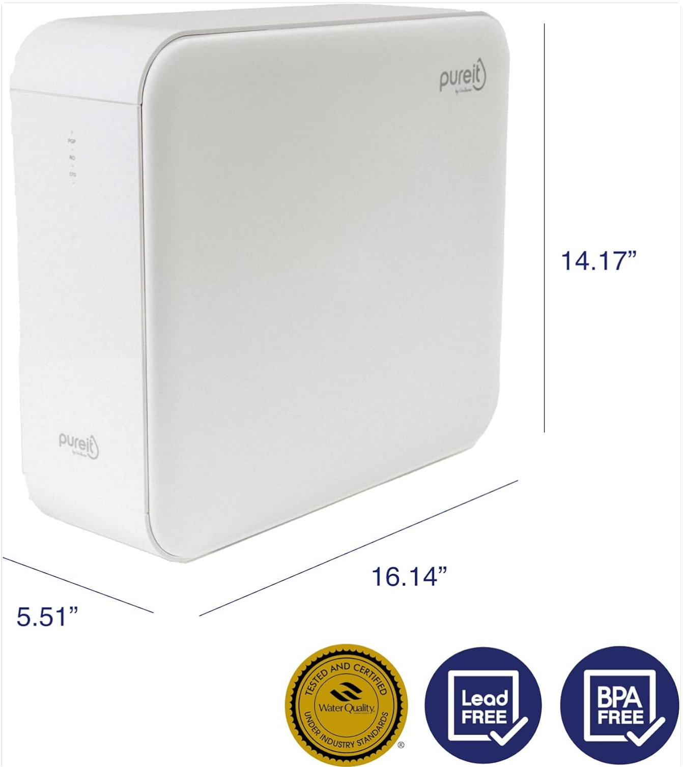
Figure 3.2: Product dimensions showing the compact size of the Pureit UR5440 unit.