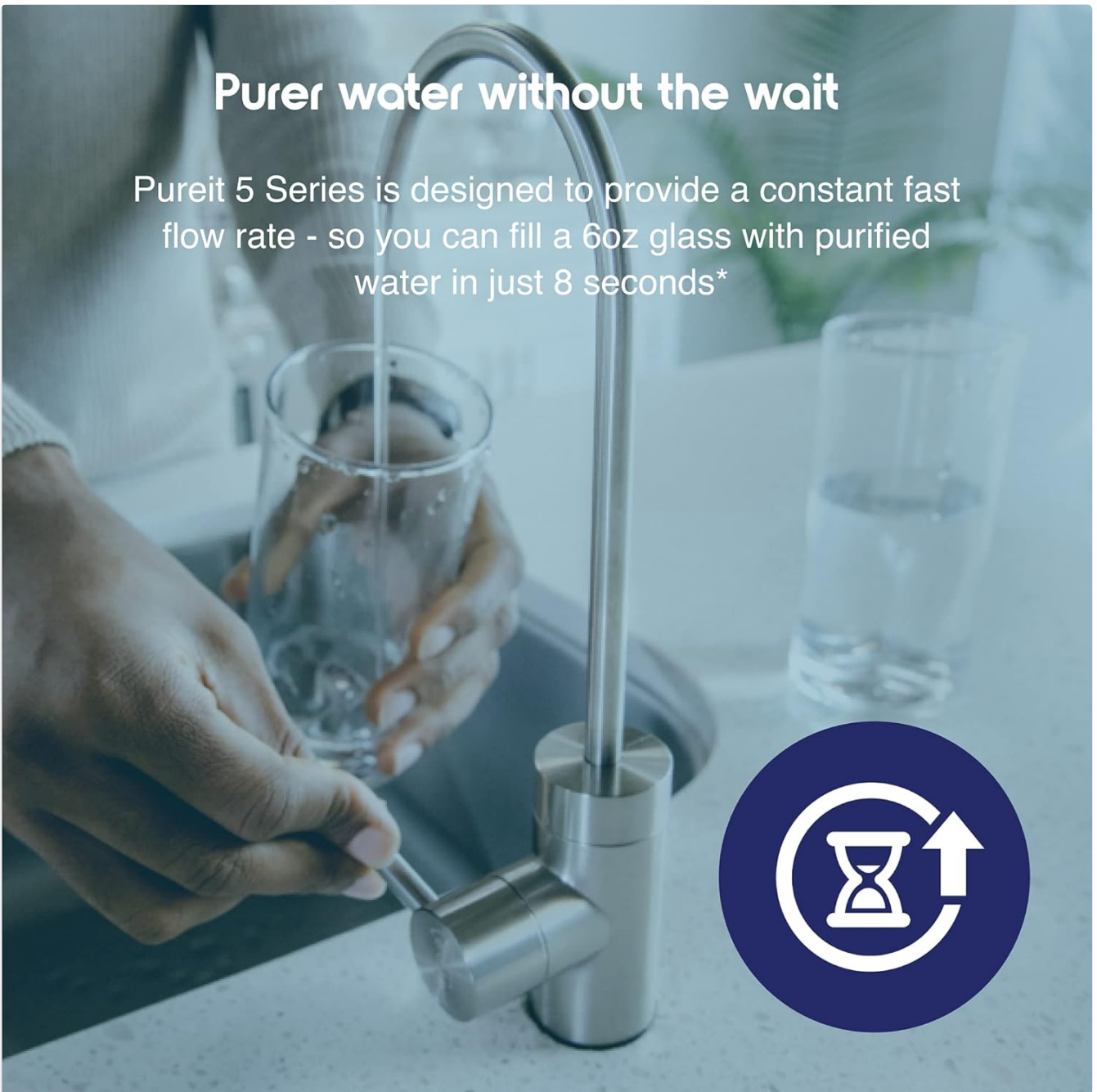
Figure 5.1: Enjoy purified water on demand with the fast flow rate.

Pureit 5 Series is designed to provide a constant fast flow rate - so you can fill a 6oz glass with purified water in just 8 seconds*