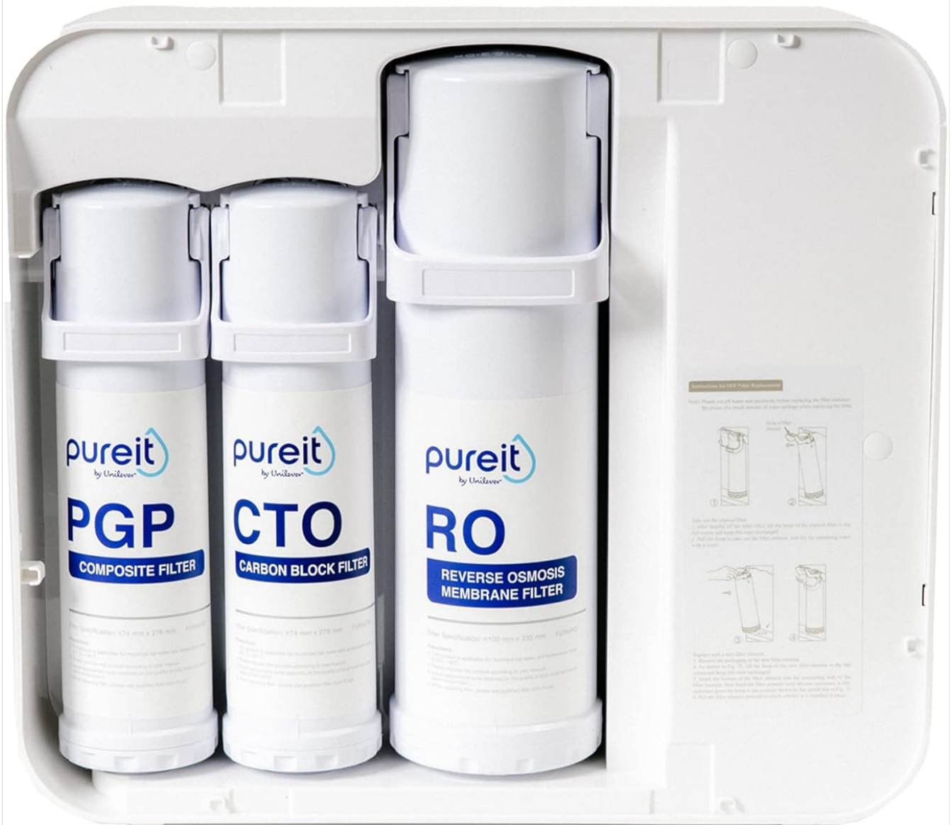
Figure 6.1: Filters are easily accessible for tool-free replacement.

Easily change filters in four simple steps with our snap in, snap out design.