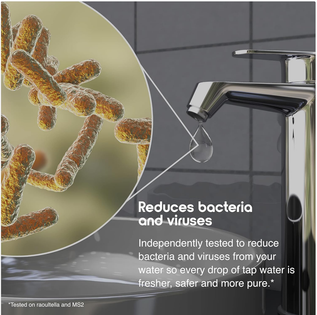
Figure 3.5: The filtration system is designed to reduce bacteria and viruses, providing safer water.