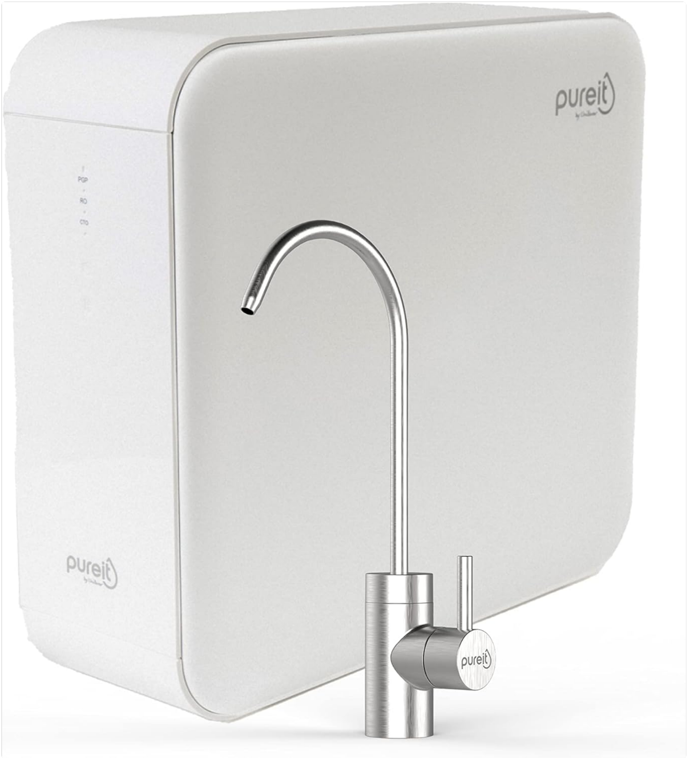
Figure 3.1: Pureit 5 Series UR5440 RO Water Purifier with accompanying faucet.