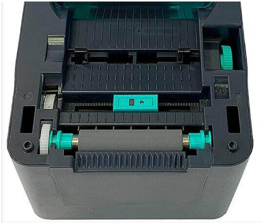
Figure 3.2: Internal view of the Fastmark M1 Series printer, illustrating the media loading path.