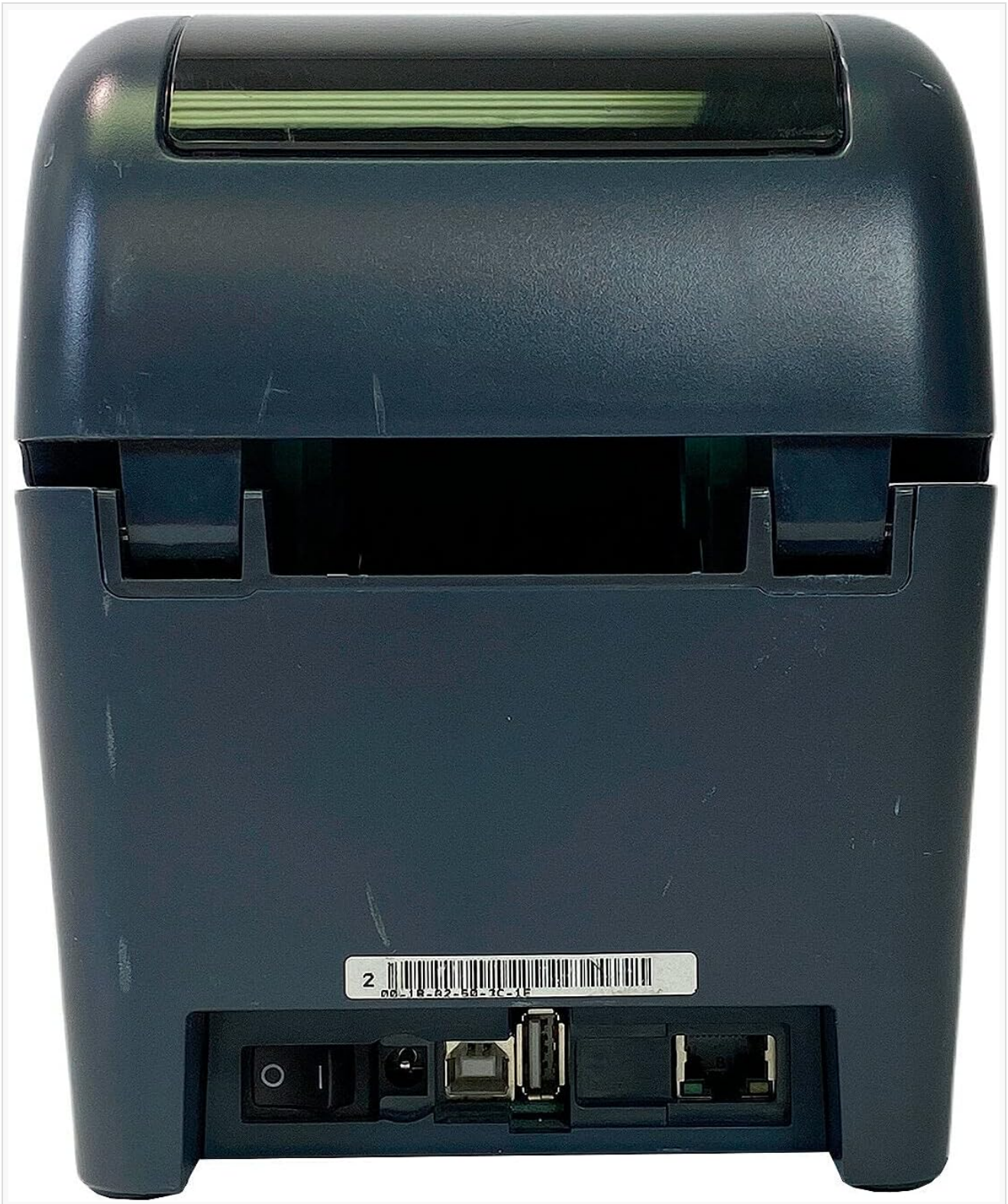
Figure 3.1: Rear view of the Fastmark M1 Series printer, highlighting the power, USB, and Ethernet ports.

The Fastmark M1 Series printer supports both USB and Ethernet connectivity.