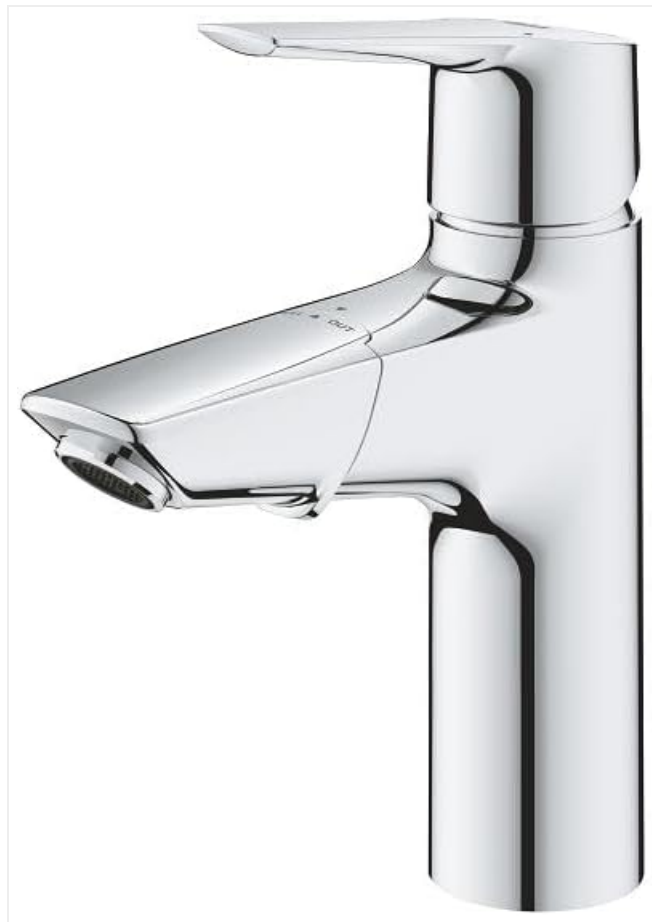
Image 3: The pull-out spout in use, demonstrating its flexibility for cleaning.