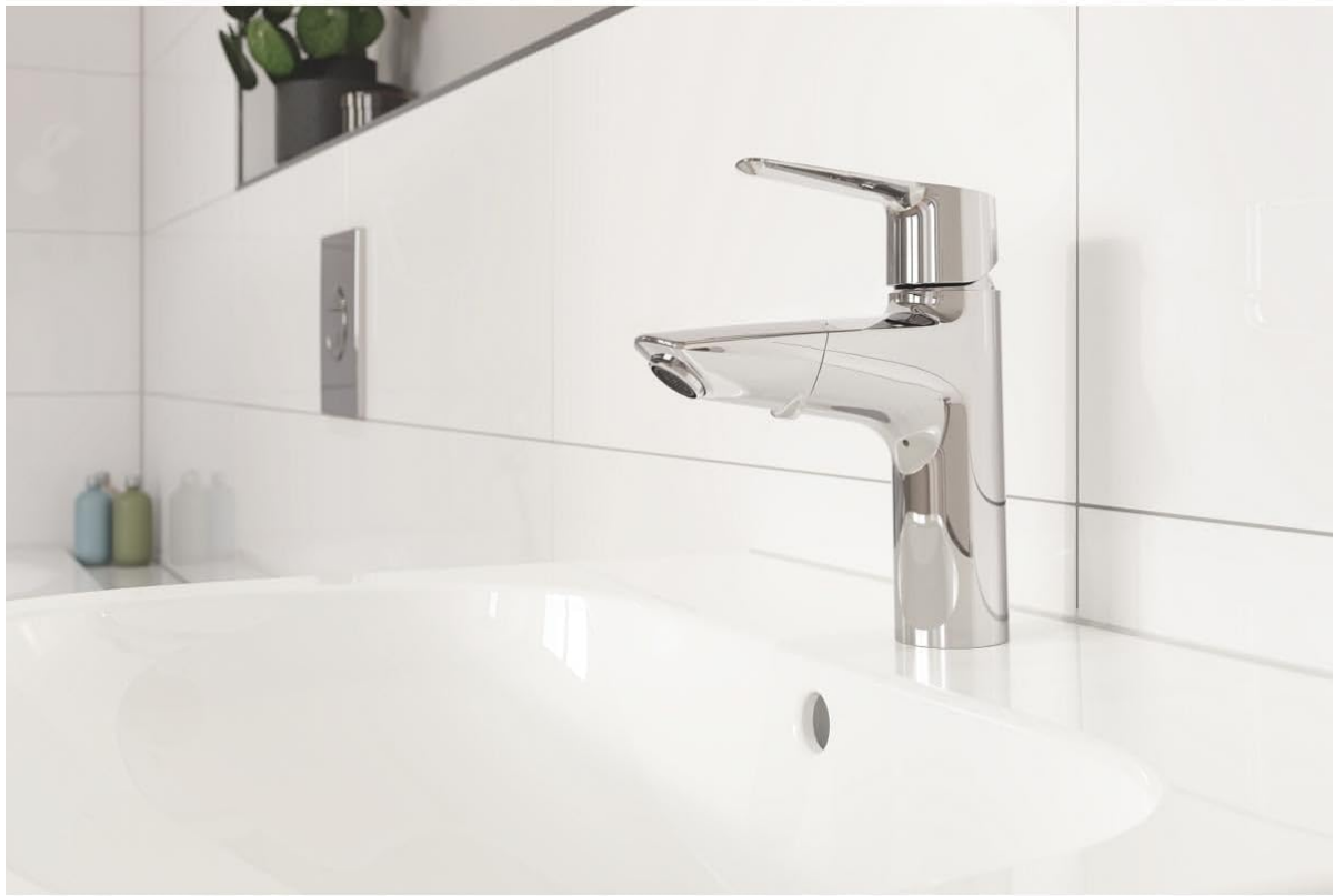
Image 4: Key features of the GROHE QUICKFIX Start tap, including the pull-out spout and temperature limiter.