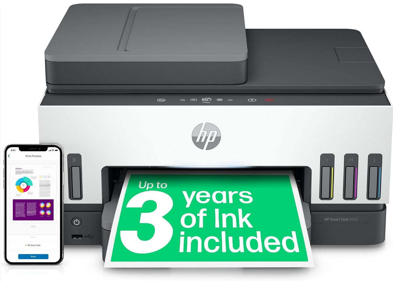
Figure 1: HP Smart Tank 7605 All-in-One Printer overview.