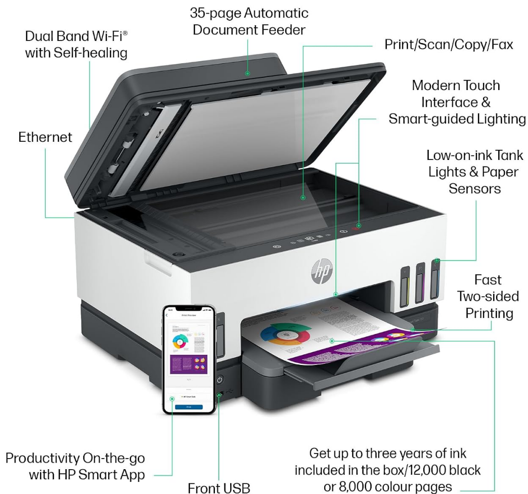
Figure 7: Product walkaround showing ADF and control panel.