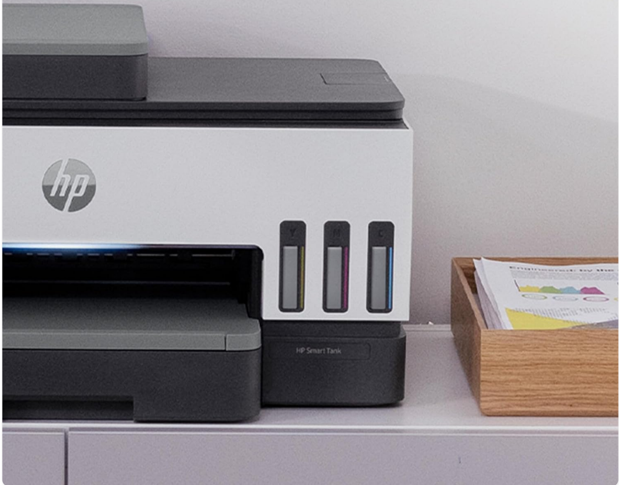
Figure 2: Included components with the HP Smart Tank 7605.