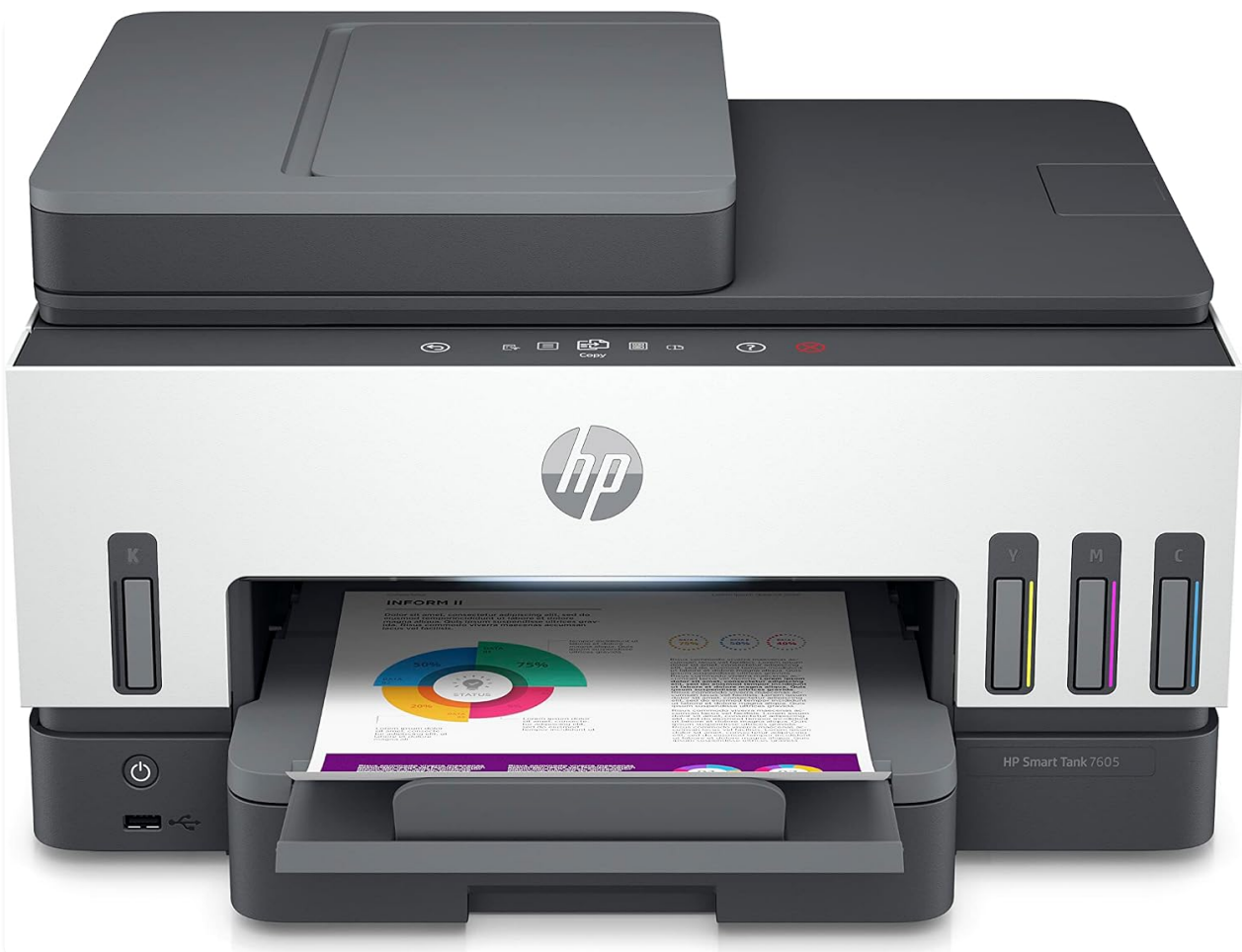
Figure 8: Visible ink tanks for easy monitoring.

The printer features low-on-ink tank lights and sensors. Monitor ink levels regularly through the transparent ink tanks or the HP Smart app. Refill tanks as described in Section 2.2 when levels are low.