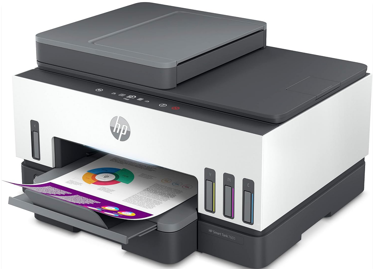
Figure 10: Commitment to reducing waste with recycled materials.

The HP Smart Tank 7605 is designed with sustainability in mind. This printer is made with 25% recycled plastic, contributing to waste reduction.