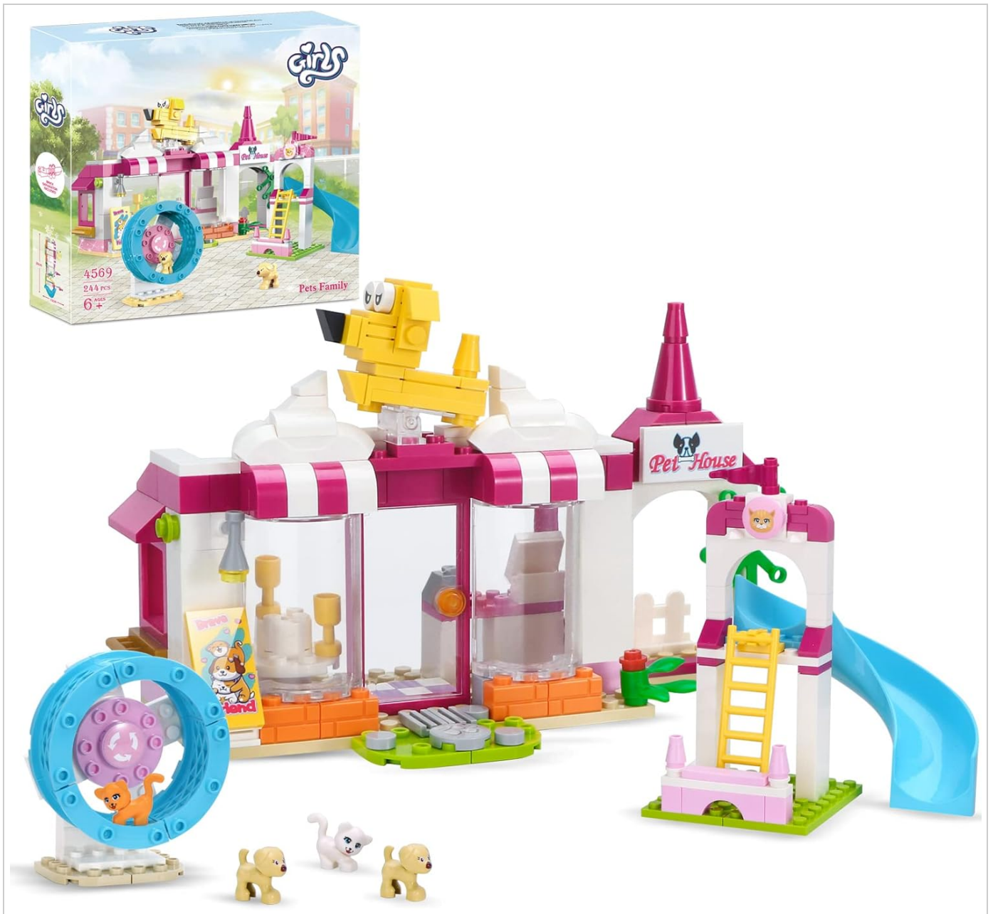
Image: The completed Tblicked Pet House Building Set, showcasing the pet day care center and playground.