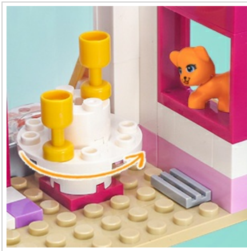
Image: Detail of a rotating feeding station within the pet house.