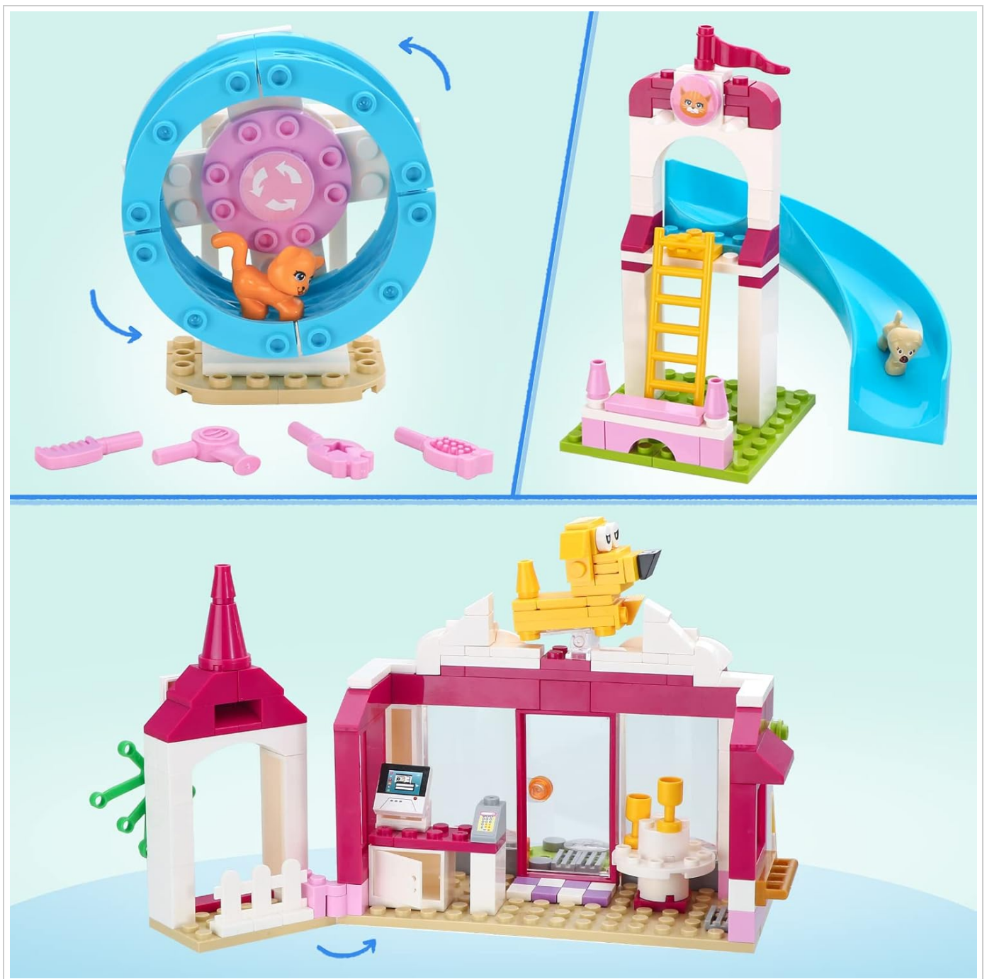
Image: Close-up of the pet house and playground, illustrating the rotating exercise wheel and slide.