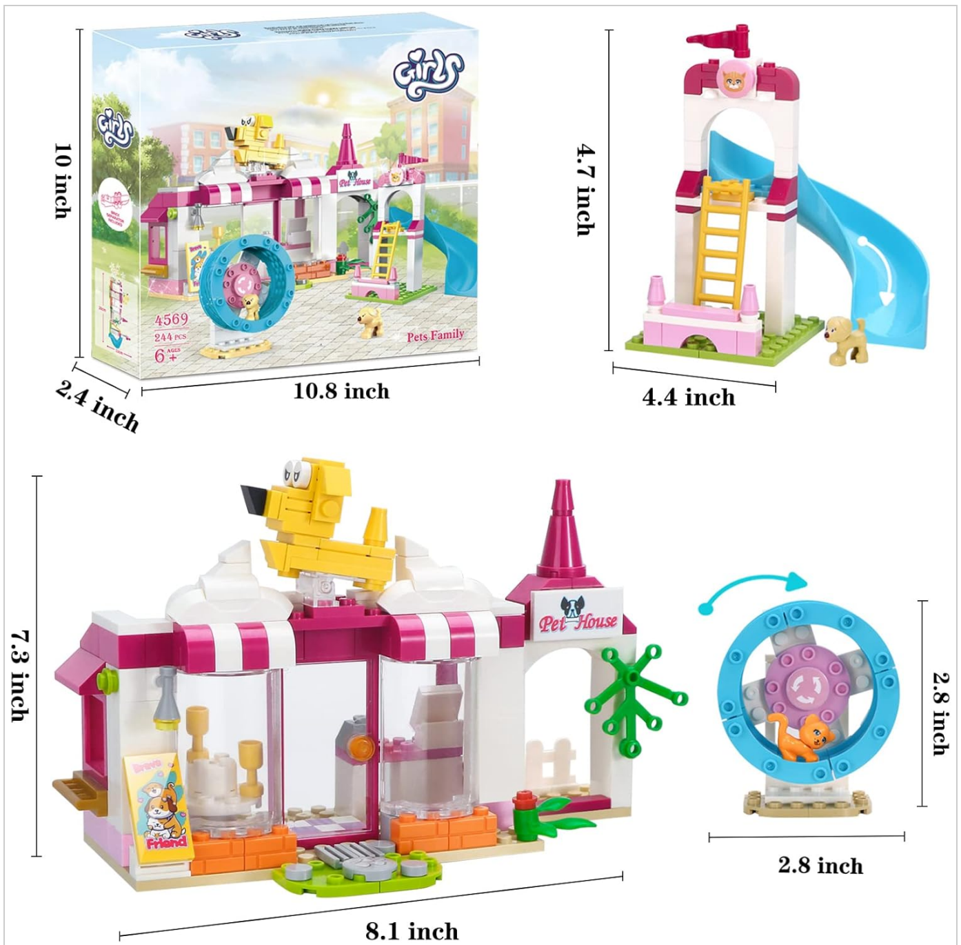
Image: Dimensional overview of the Tblicked Pet House Building Set and its individual structures.