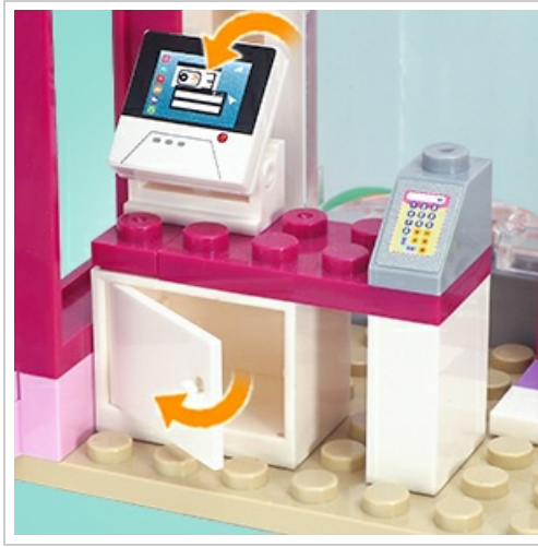
Image: Interior detail of the pet house, featuring a reception desk with a computer and cash register.