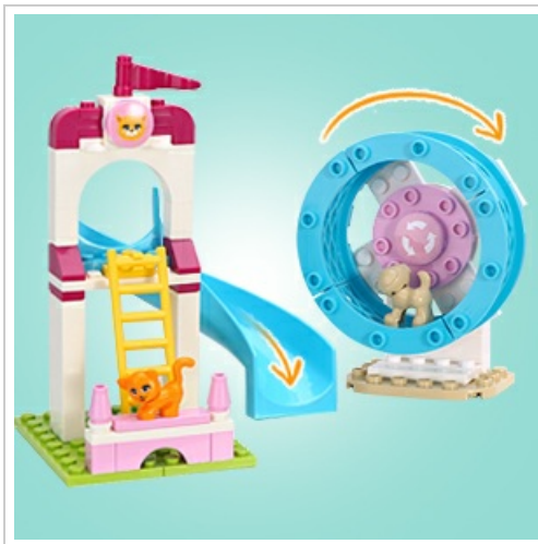
Image: The pet playground area, showing the slide and the rotating exercise wheel with pet figures.