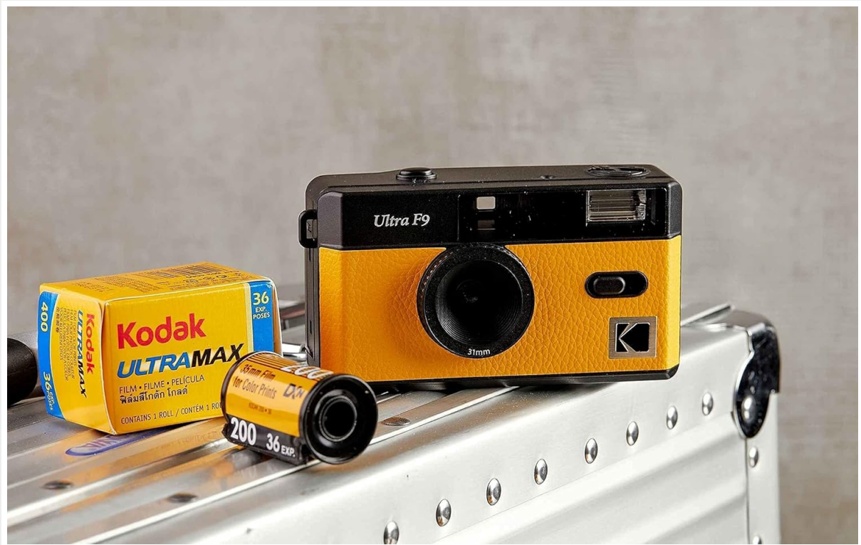
Figure 5: KODAK Ultra F9 camera with 35mm film, ready for loading.

Your browser does not support the video tag.