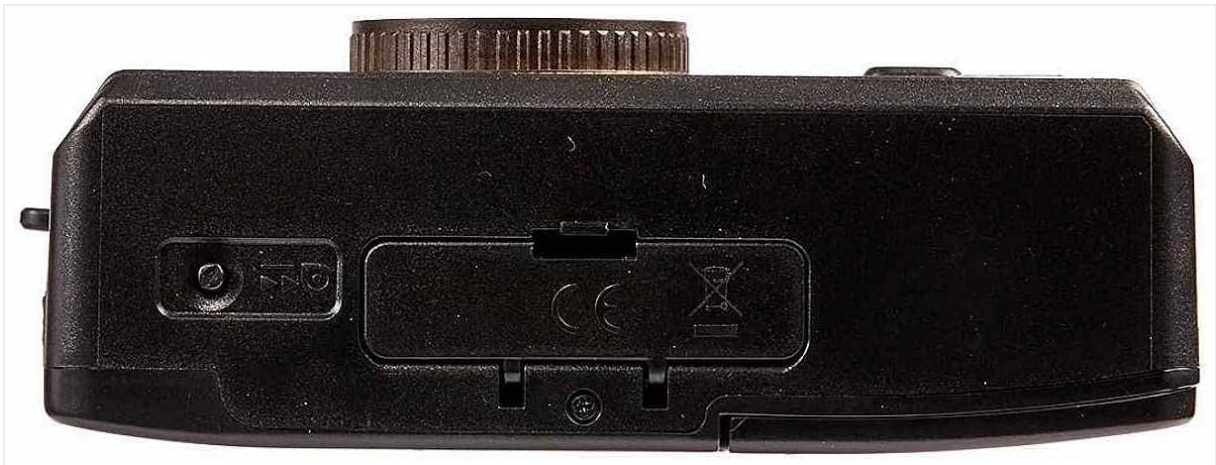
Figure 4: Bottom view of the KODAK Ultra F9 camera, showing the battery compartment and film rewind button.