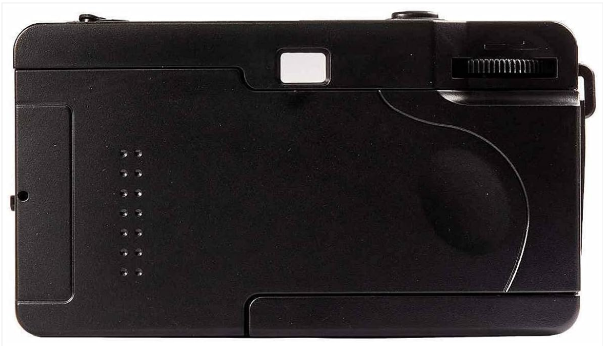
Figure 3: Back view of the KODAK Ultra F9 camera, showing the film counter and film door latch.