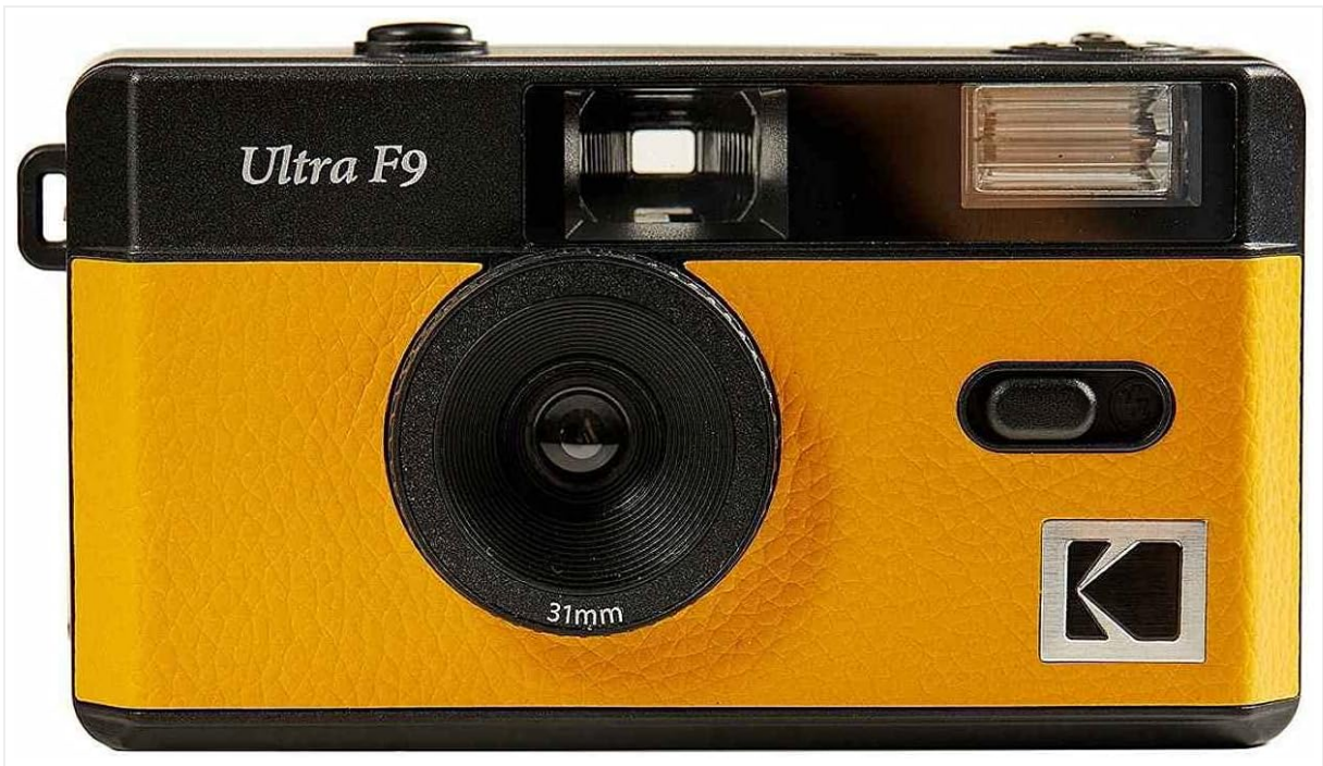
Figure 1: Front view of the KODAK Ultra F9 camera, showing the lens, viewfinder, flash, and shutter button.