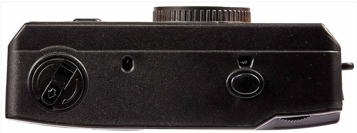
Figure 2: Top view of the KODAK Ultra F9 camera, highlighting the film advance wheel.