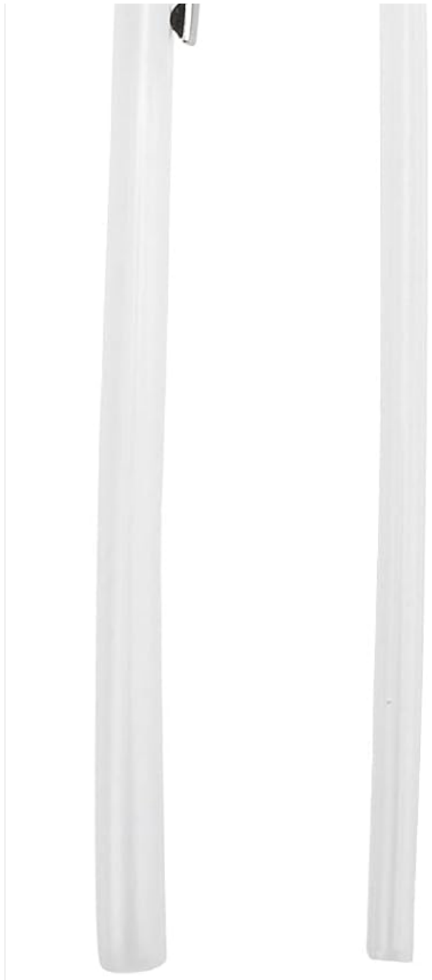
Figure 3: Main pump unit and separate extension tube.