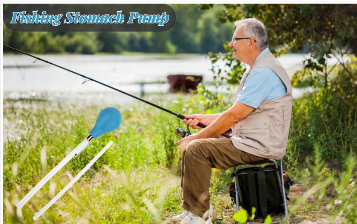
Figure 4: Illustrative image of a fly fisherman, representing the typical user environment for the stomach pump.

7. Examine Contents: Observe the contents in the tube to identify what the fish has been feeding on.