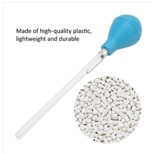
Figure 2: Close-up of the pump's material, emphasizing its lightweight and durable plastic construction.