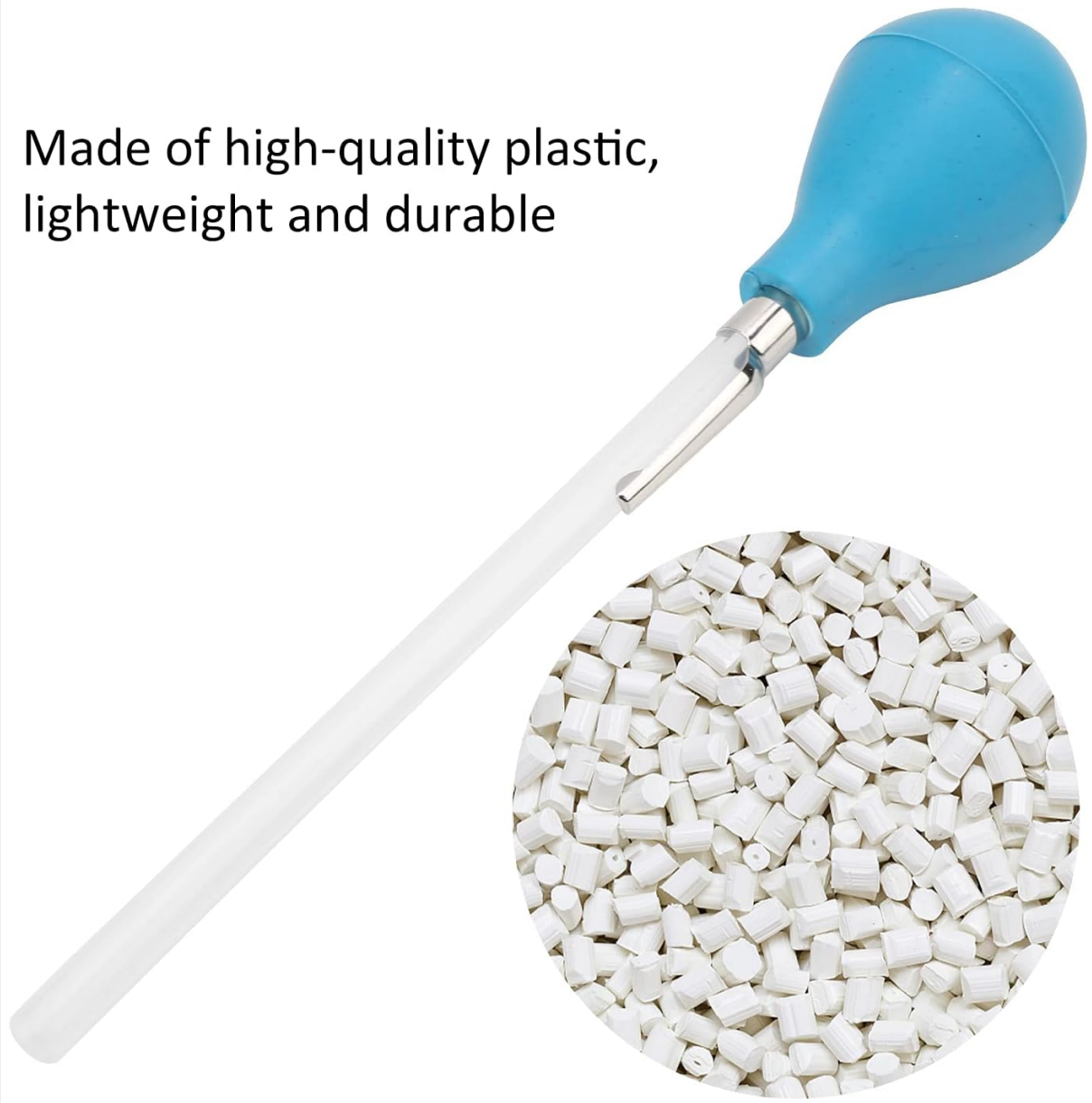
Figure 1: Narooto Fly Fishing Stomach Pump, assembled.

Made of high-quality plastic, lightweight and durable