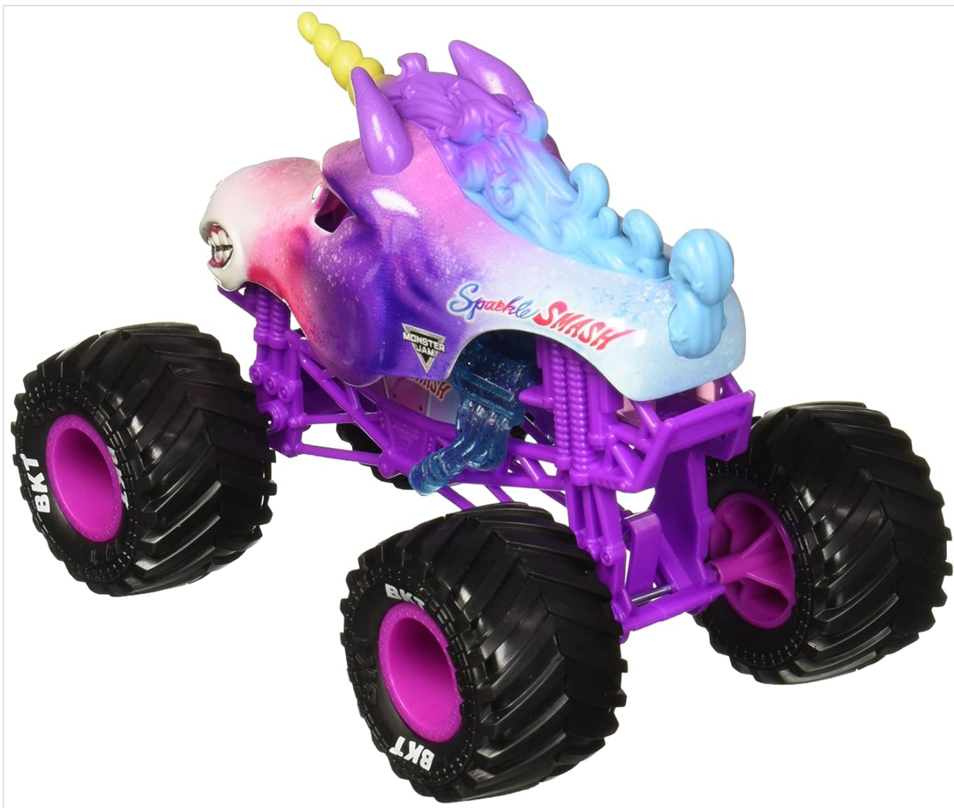
Image 1: The Monster Jam Sparkle Smash Monster Truck. This image displays the full truck from an angled perspective, highlighting its vibrant unicorn-inspired color scheme and robust design.