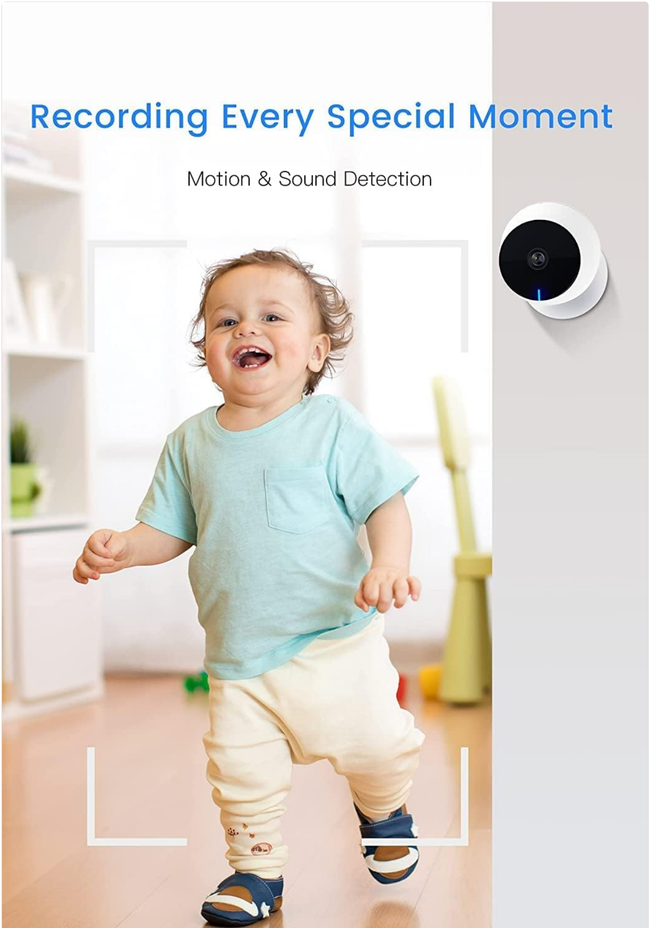
Image: The LAXIHUB M1 camera detecting motion from a baby.

Your browser does not support the video tag.