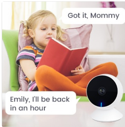
Image: Illustration of the two-way audio function for communication.