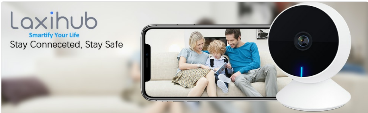
Image: LAXIHUB M1 Baby Pet Camera overview.

This manual provides detailed instructions for the installation, operation, and maintenance of your LAXIHUB M1 1080P Full HD Security Baby Monitor. Please read this manual thoroughly before using the product to ensure proper functionality and safety. Keep this manual for future reference.