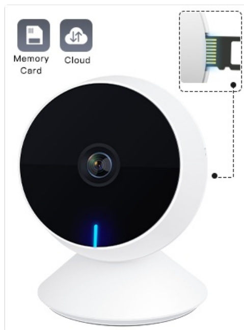
Image: Close-up of the MicroSD card slot on the LAXIHUB M1 camera.