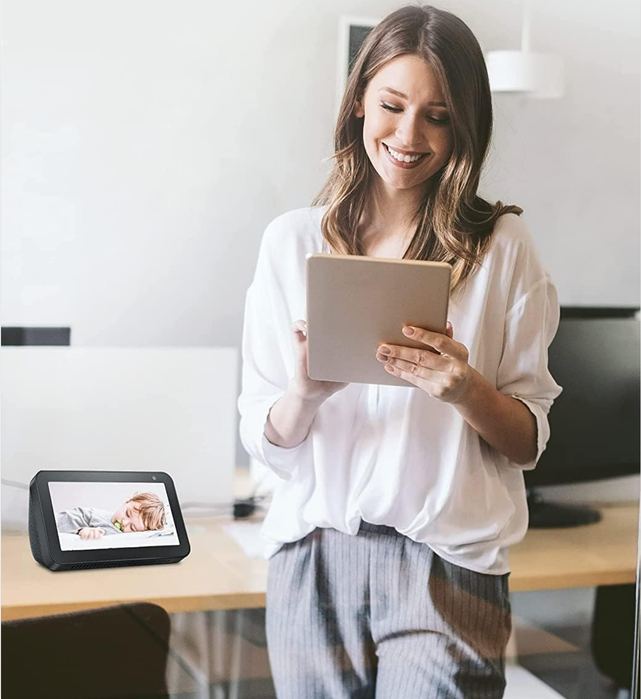
Image: The LAXIHUB M1 camera integrated with an Alexa-enabled smart display.