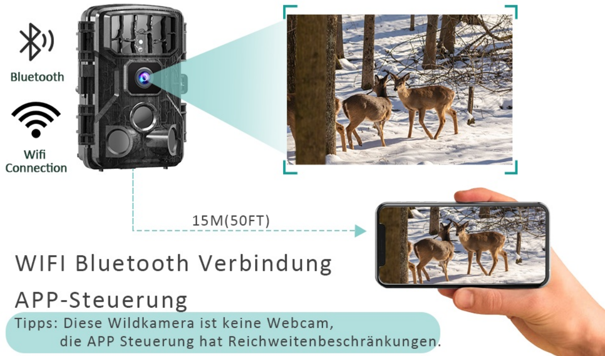
Image: The EZETAI Trail Camera captures 30MP photos and 4K/30FPS videos, suitable for detailed wildlife monitoring.