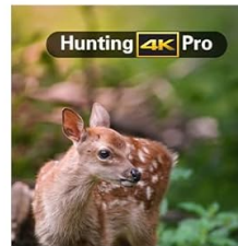
Hunting 4K pro