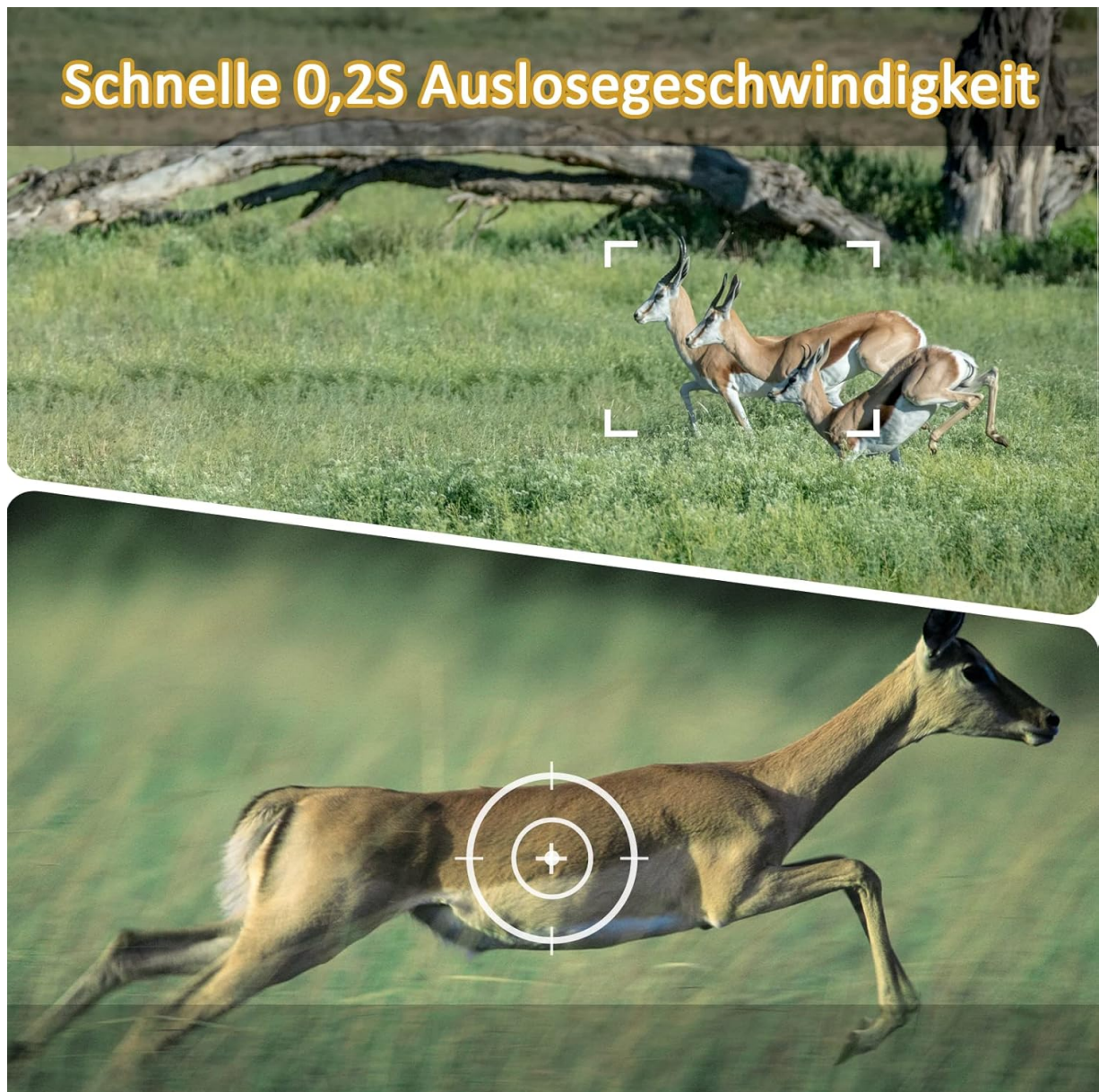
Image: The camera's 0.2-second trigger speed ensures quick capture of moving subjects.

When motion is detected within the 120° detection range, the camera will automatically trigger and capture photos or record videos based on your selected mode. The fast 0.2-second trigger speed ensures minimal delay.