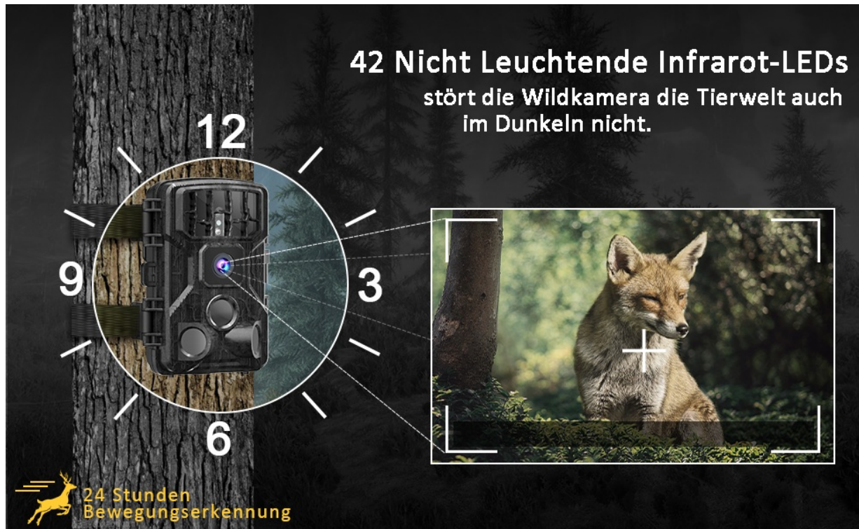
Image: The 42 non-glowing infrared LEDs ensure discreet 24-hour motion detection without disturbing wildlife.

Image: Excellent night vision performance, capturing wildlife clearly in dark environments.