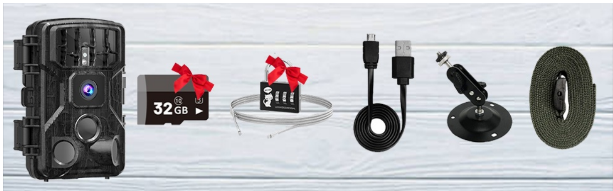
Image: Overview of the camera's main features and technical specifications.