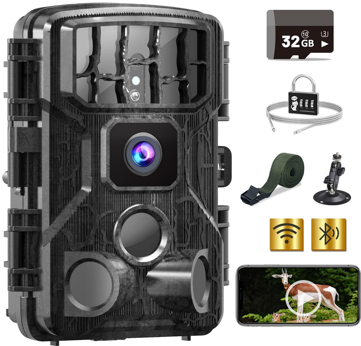
Image: EZETAI WiFi 4K 30MP Trail Camera with its complete set of accessories.