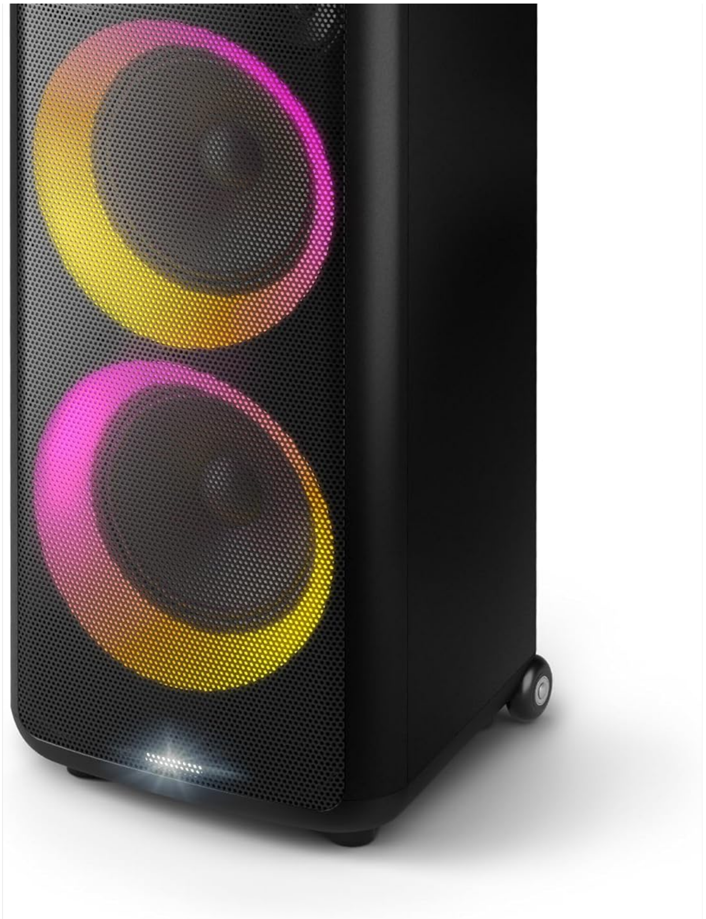
Image: The Philips X5206 Bluetooth Party Speaker, showing its front grille with two illuminated woofers and a retractable handle.