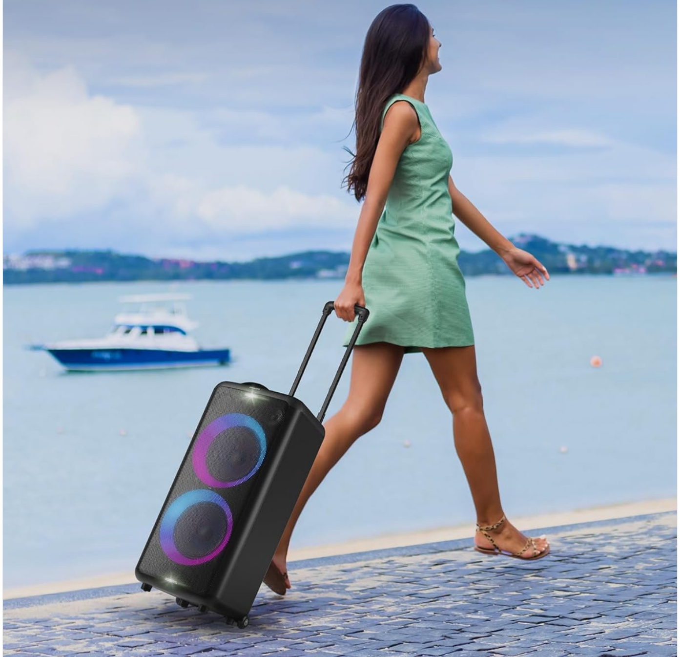
Image: A person walking outdoors, easily transporting the Philips X5206 speaker using its retractable handle and wheels.