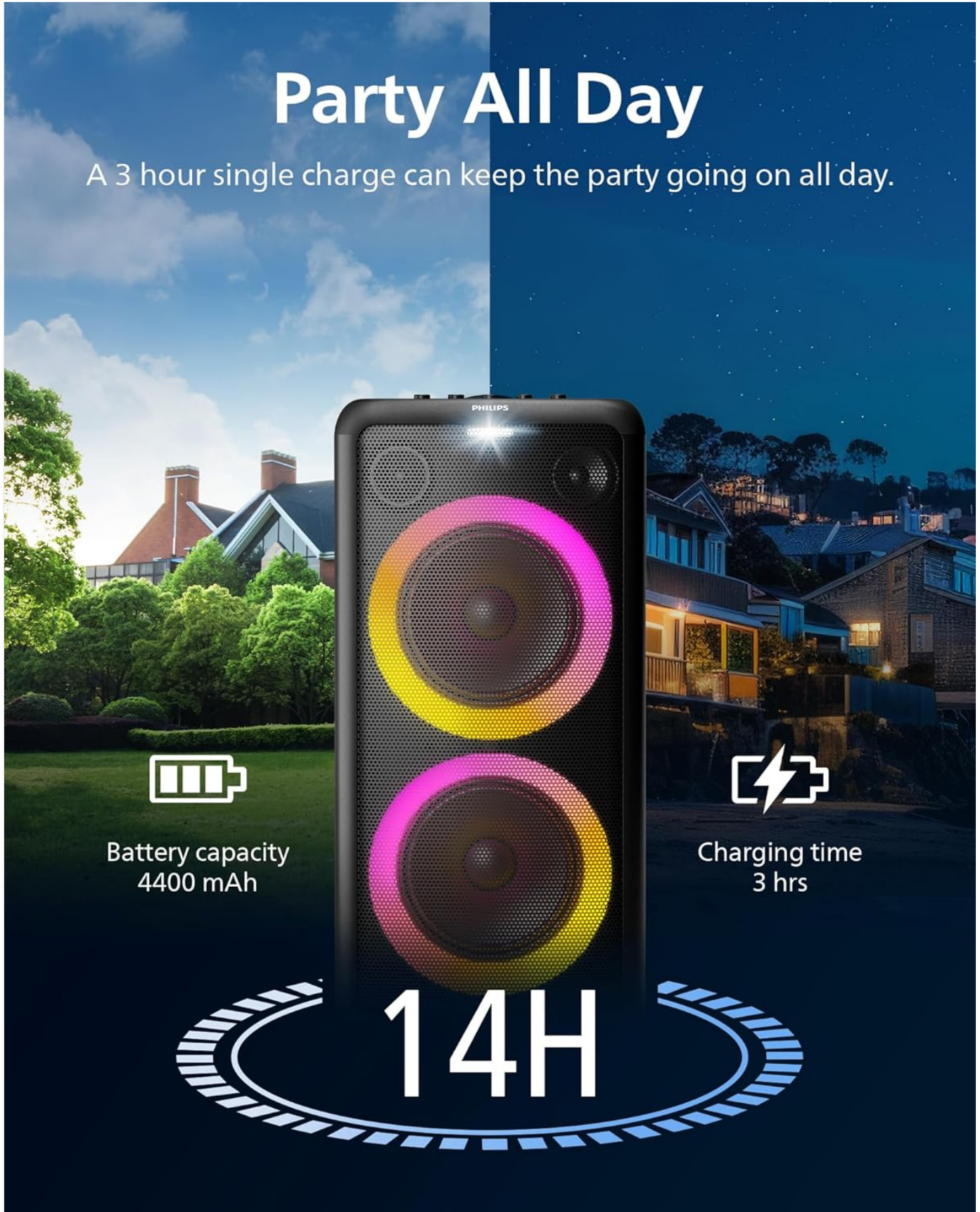
Image: An illustration of the Philips X5206 speaker with icons indicating a 4400 mAh battery capacity, 3 hours charging time, and 14 hours of playtime.

Before first use, fully charge the speaker. Connect the supplied AC power cord to the speaker's power input and then to a wall outlet. The charging indicator will show the charging status. A full charge takes approximately 3 hours and provides up to 14 hours of playtime.