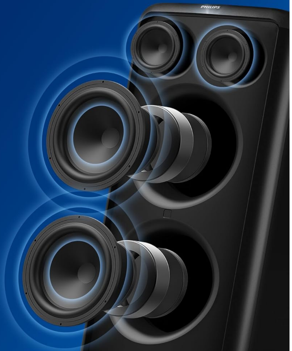
Image: An internal view diagram of the Philips X5206 speaker, illustrating its two 8-inch woofers and two 2.5-inch tweeters, emphasizing treble and bass control for voice.