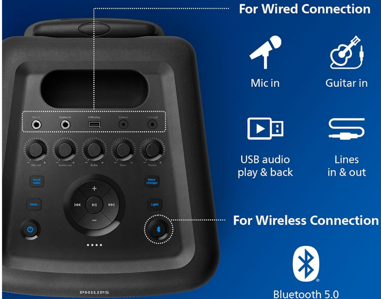
Image: A close-up of the Philips X5206 control panel, highlighting the microphone, guitar, USB, and line-in/out ports for both wired and wireless (Bluetooth 5.0) connections.

Multi-uses in one machine, includes Bluetooth, Mic in, Guitar in, USB, Lines in & out.